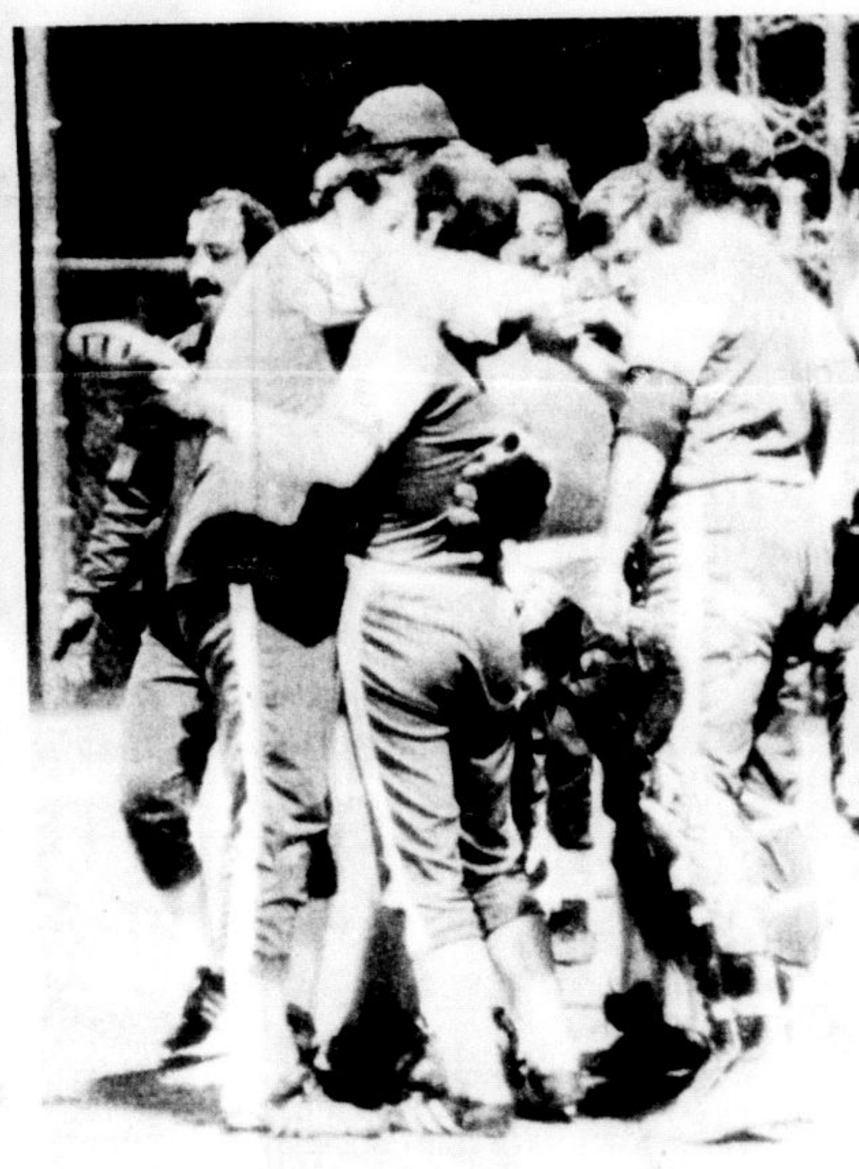
CONGRATULATIONS are exchanged by members of the Thornborrow BP-Muffles team after they defeated McDuffe Equipment in the first game of the Milton Fastball League finals Thursday evening at Brian Best Park.