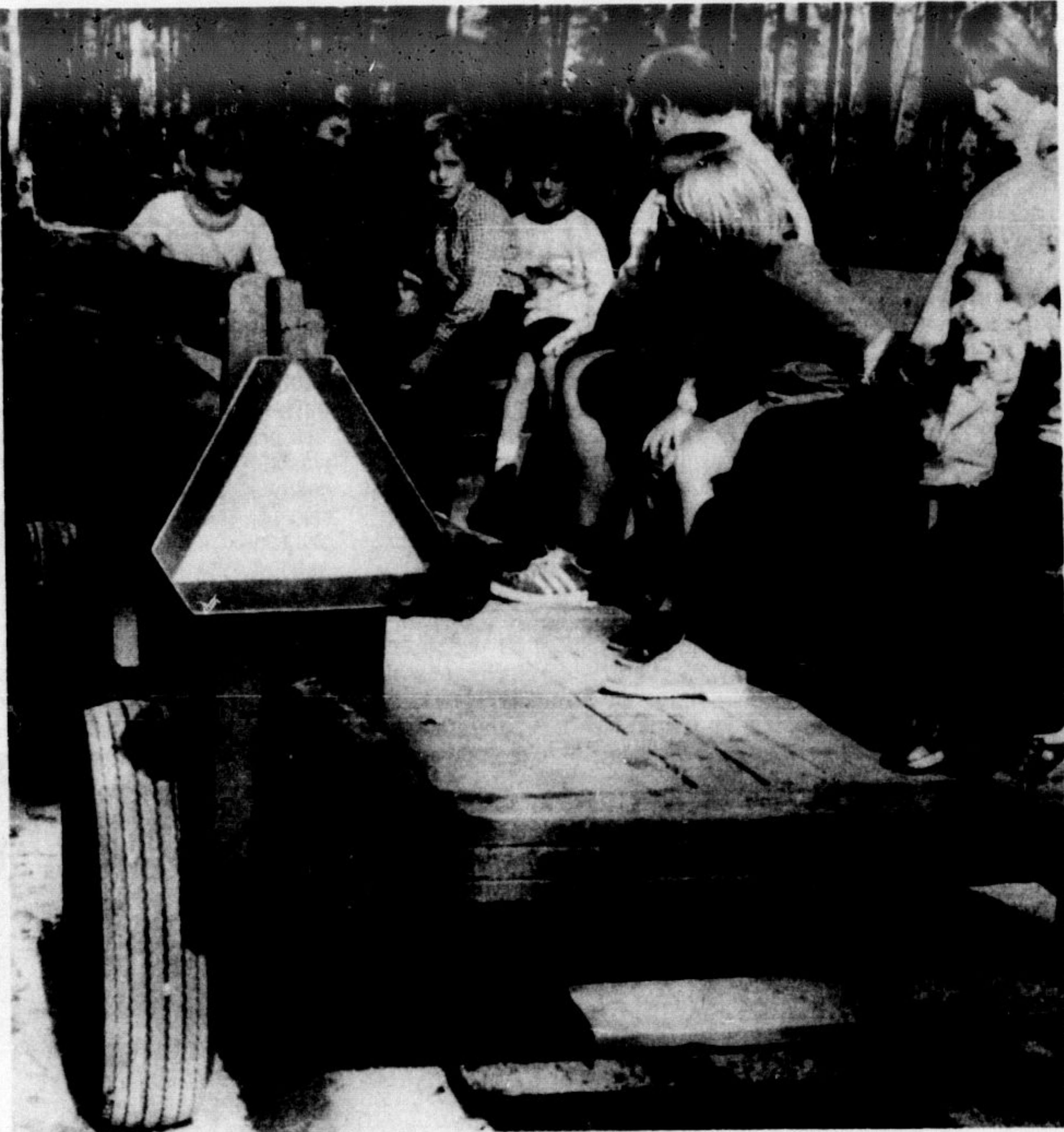
ALL ABOARD for a trip to the demonstration sawmill. A more scenic drive you'll never find. Mountsberg staffers are expecting large crowds of people to visit the conservation area during weekends in October.