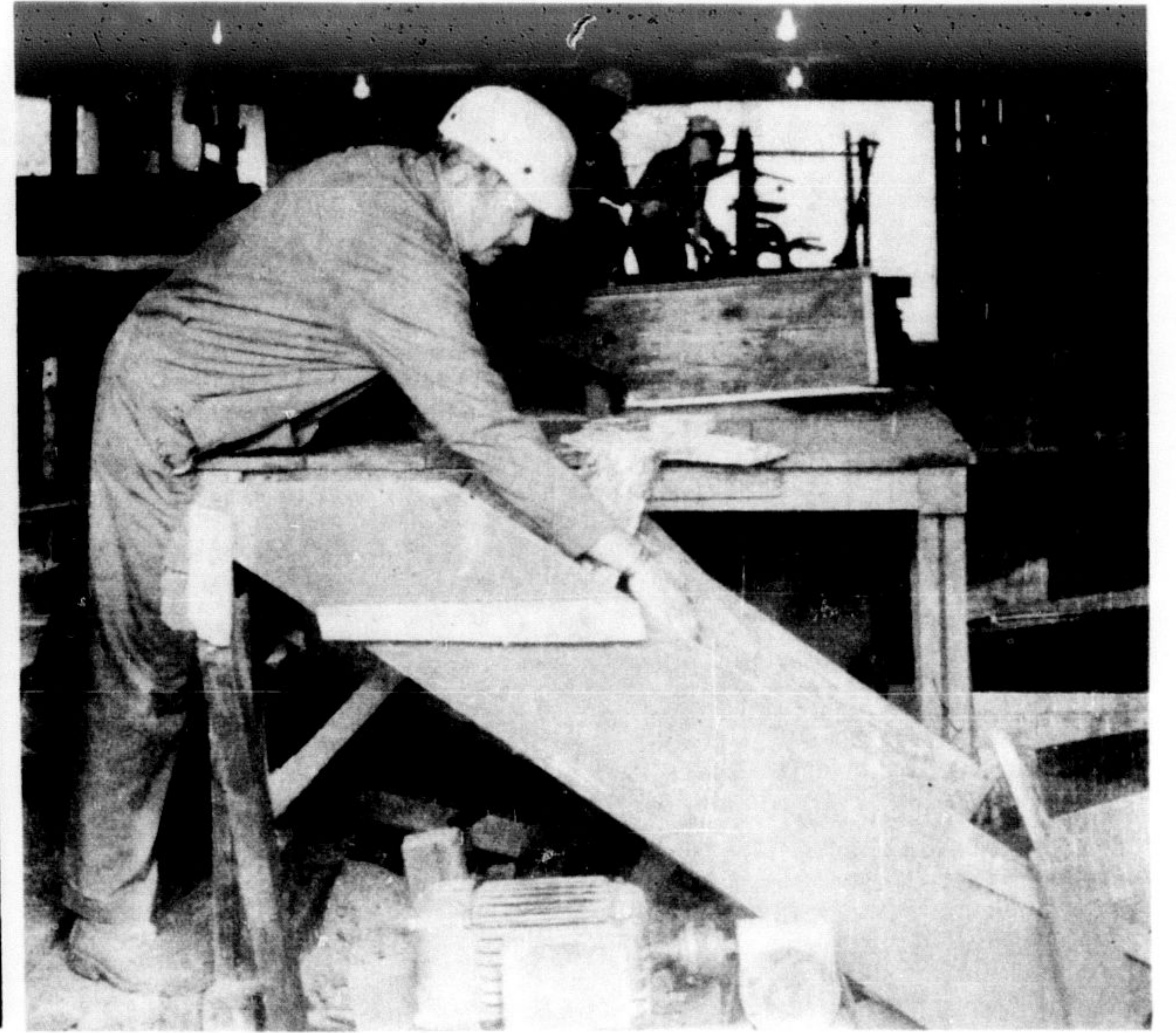
DEMONSTRATION of the old sawmill is one of the highlights this fall for visitors to Mountsberg Conservation Area. Much of the lumber cut at the mill is used for projects conducted by the Halton Region Conservation Authority.