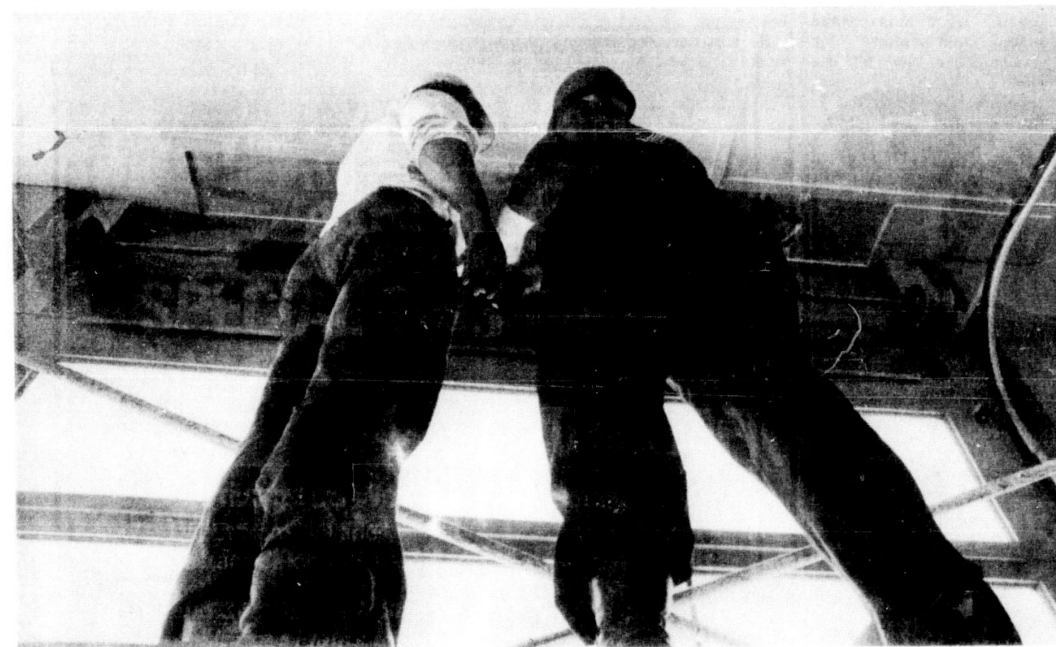
TEARING DOWN an old building is not a simple task. Town works crews and Maplehurst inmates spent several days taking apart doors and

surrounding the area would necessitate more parking space, said Milton council, and the station was torn down this week.