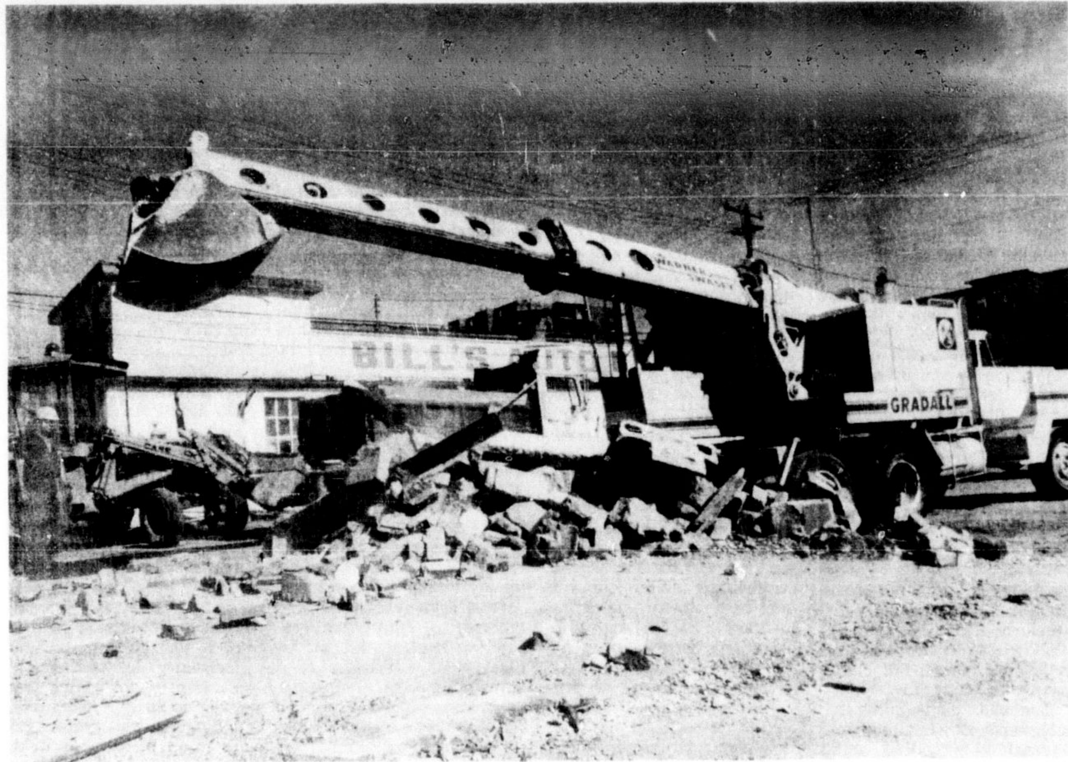
ADDITIONAL PARKING space is the reason behind the demolition of the old Sunoco gasoline station beside the town hall. Future development

surrounding the area would necessitate more parking space, said Milton council, and the station was torn down this week.