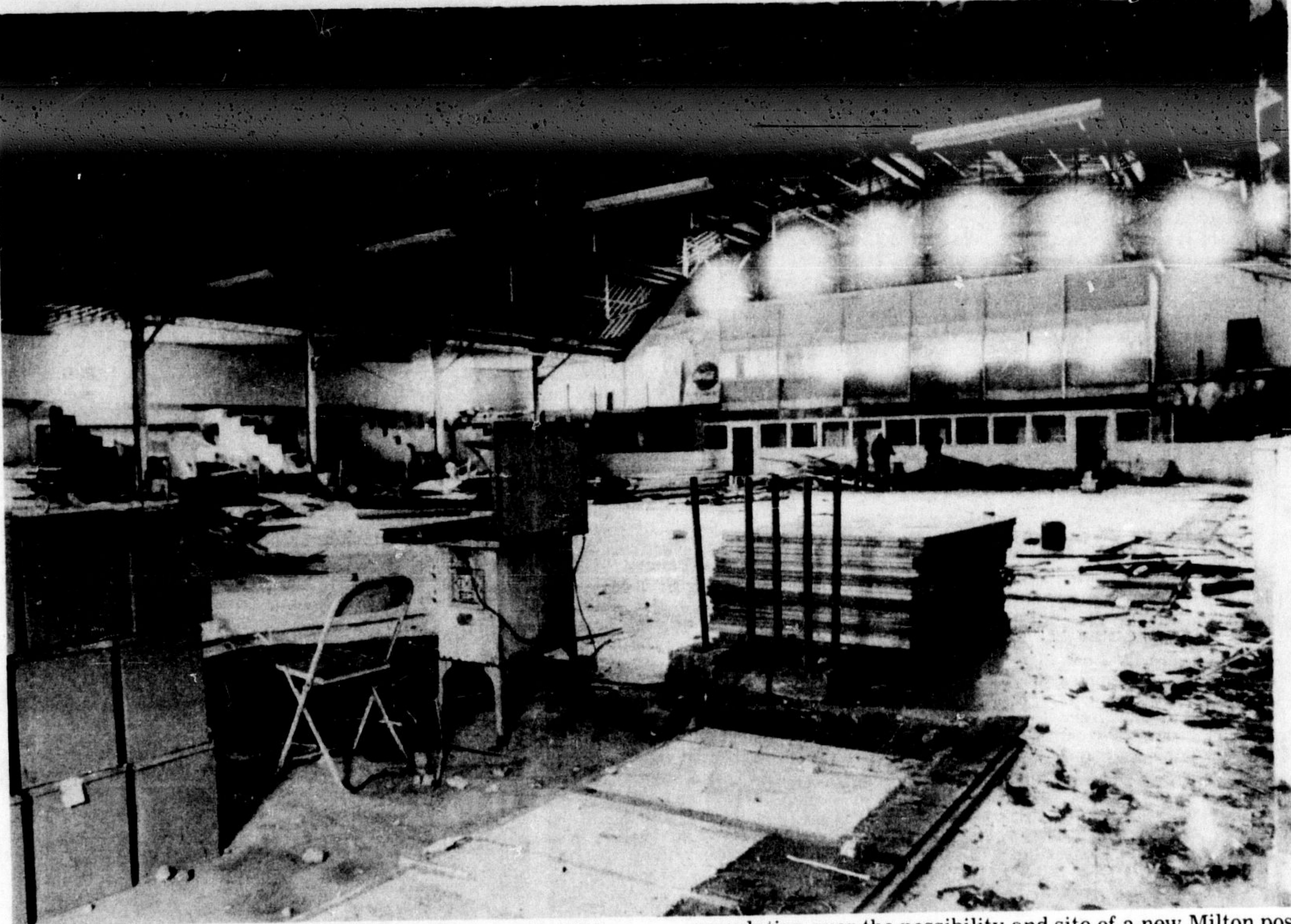
THE BROWN ST. ARENA is in its final days, as demolition crews take apart and tear down the condemned building. The destruction of the building follows several months of

speculation over the possibility and site of a new Milton post office. The federal government has purchased the arena land.