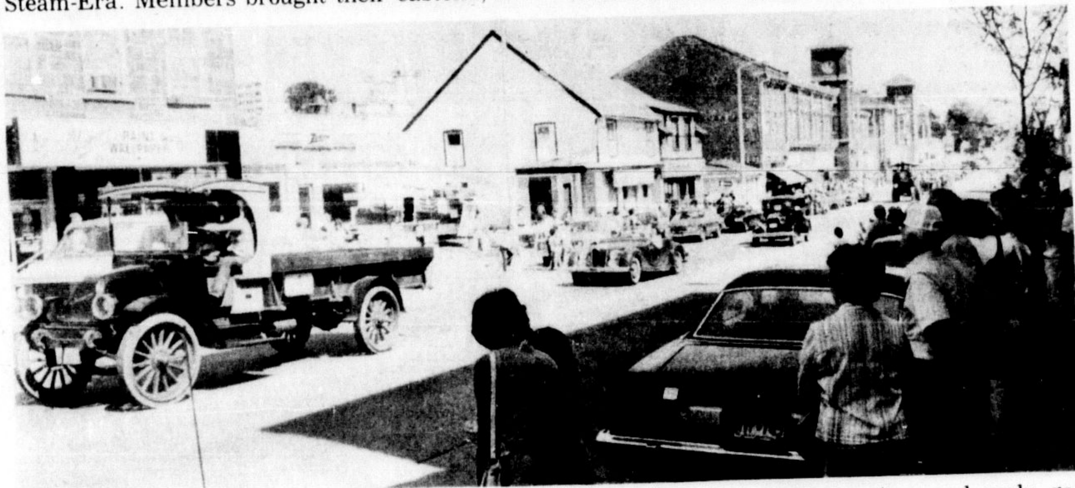
THE PAST ON PARADE passed through Milton Saturday when the Steam-Era organizers held their annual parade to the fair grounds. Antique cars and trucks, steam engines and early gas tractors made up the mile-long parade.