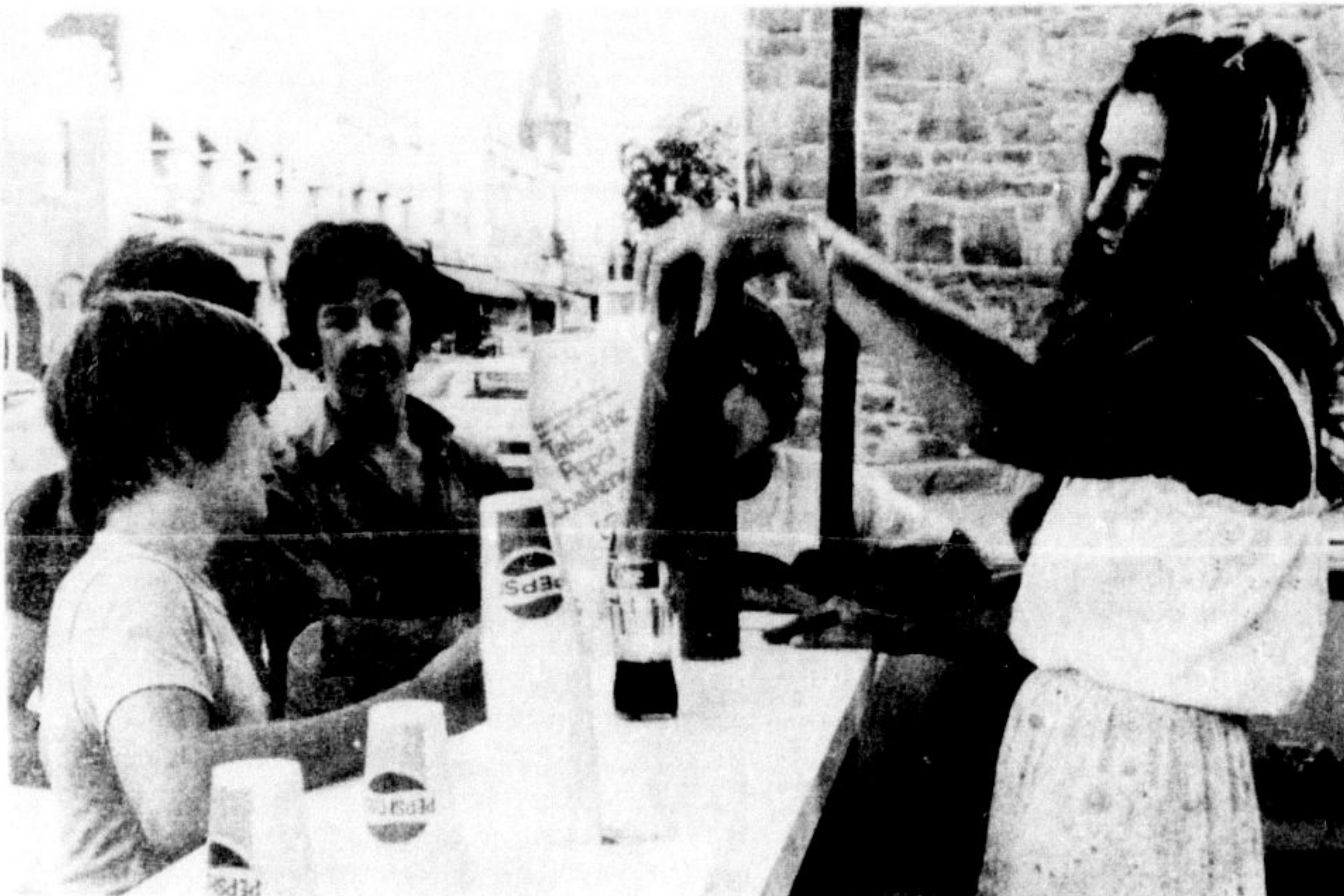
AWWW, YOU CHOSE THE COKE! Miltonians had fun trying the Pepsi challenge during the weekend as the Pepsi booth toured the downtown core, Mall and fair grounds. The taste test didn't always result in a victory for the sponsor's brand, admitted the attendant.