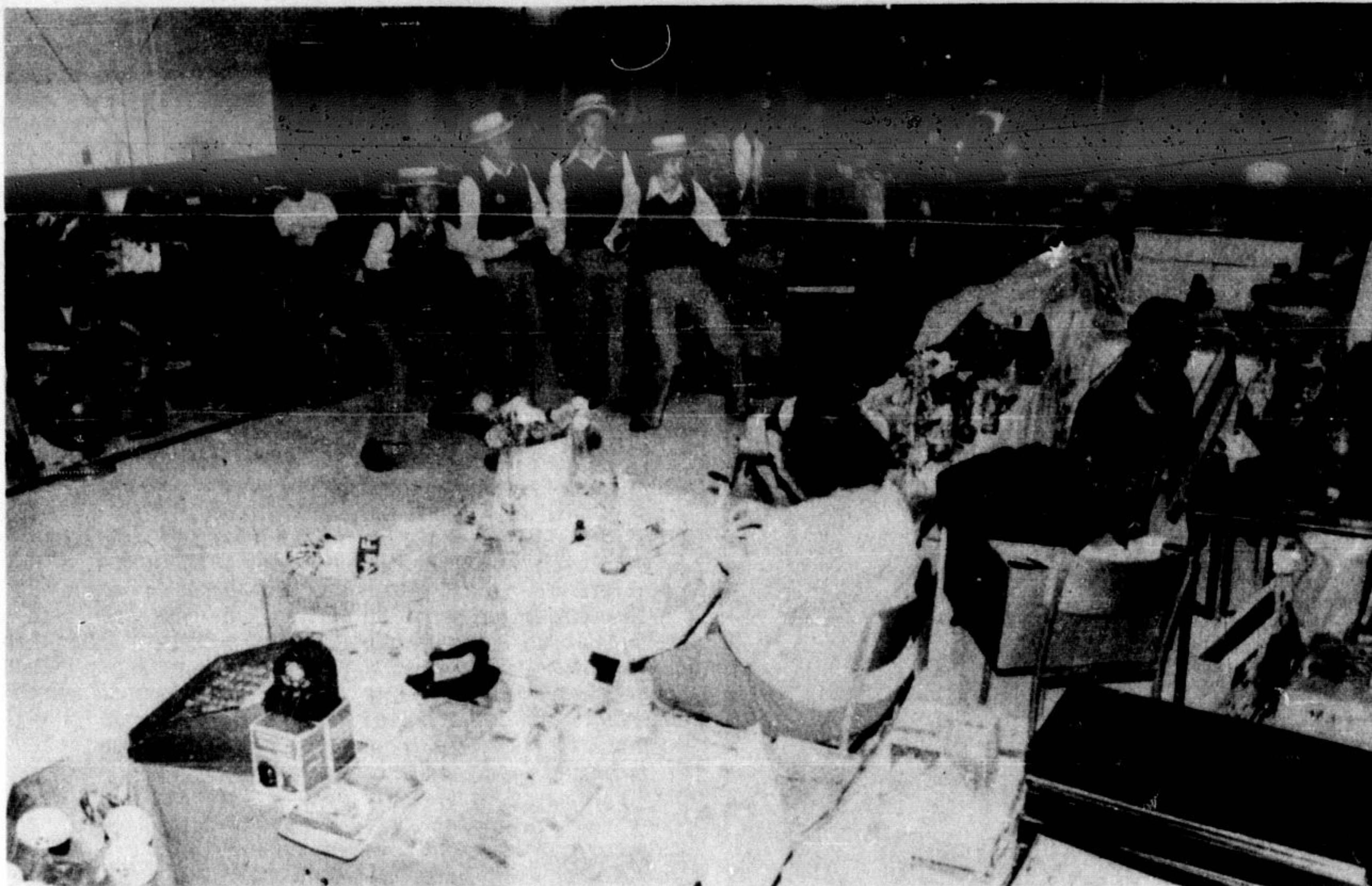
"WE'D LIKE TO SERENADE YOU," said the Old Fashioned Edition barbershop quartet from Oakville as they strolled around town Friday night — and they did just that at the Flea Market in the old fire hall. Buyers and sellers enjoyed their colorful rendition of a couple of old favorites.