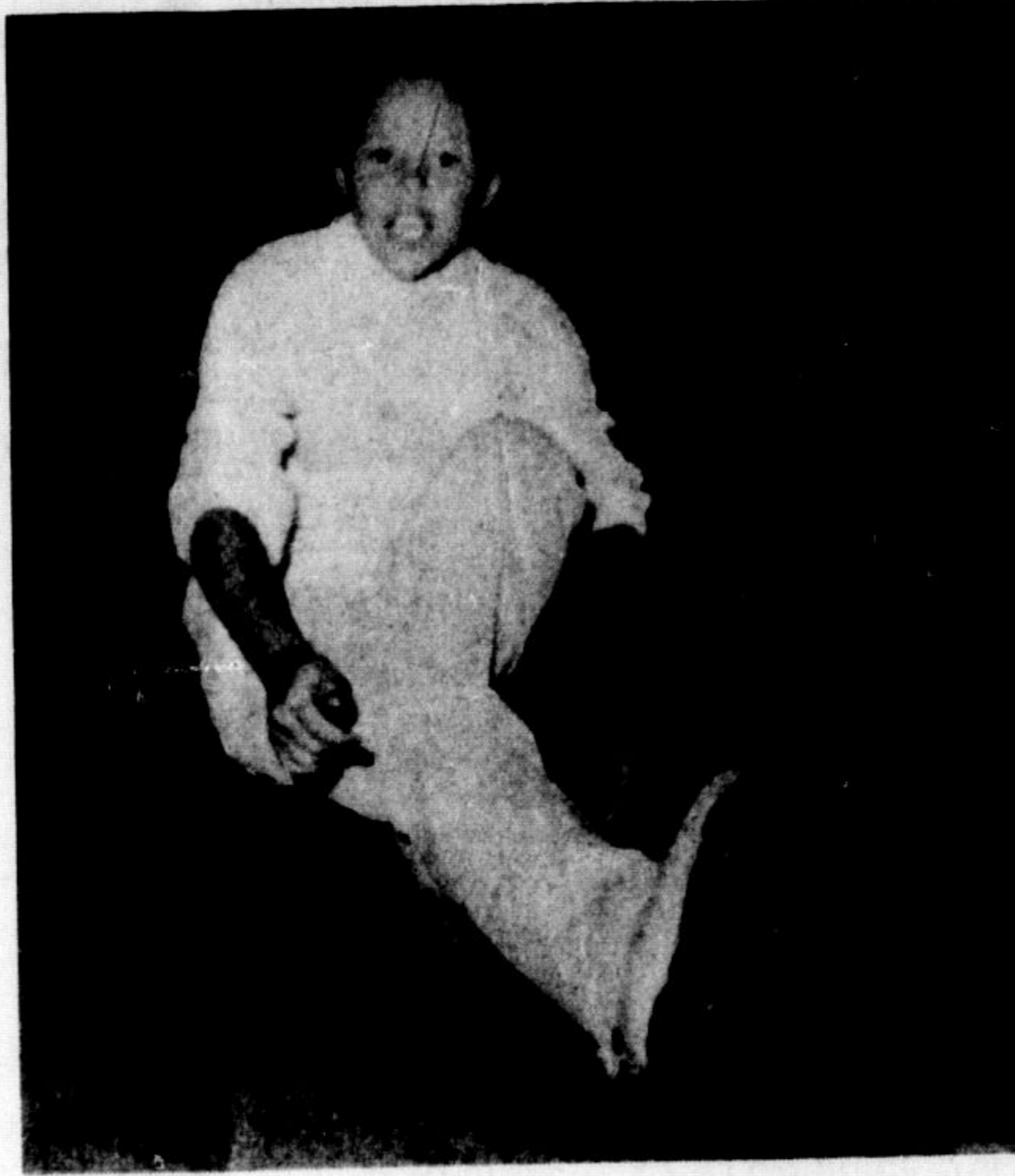
EVERYBODY SEEMS to have a stunt or trick they like to do in front of a camera, like this sit-down artist.