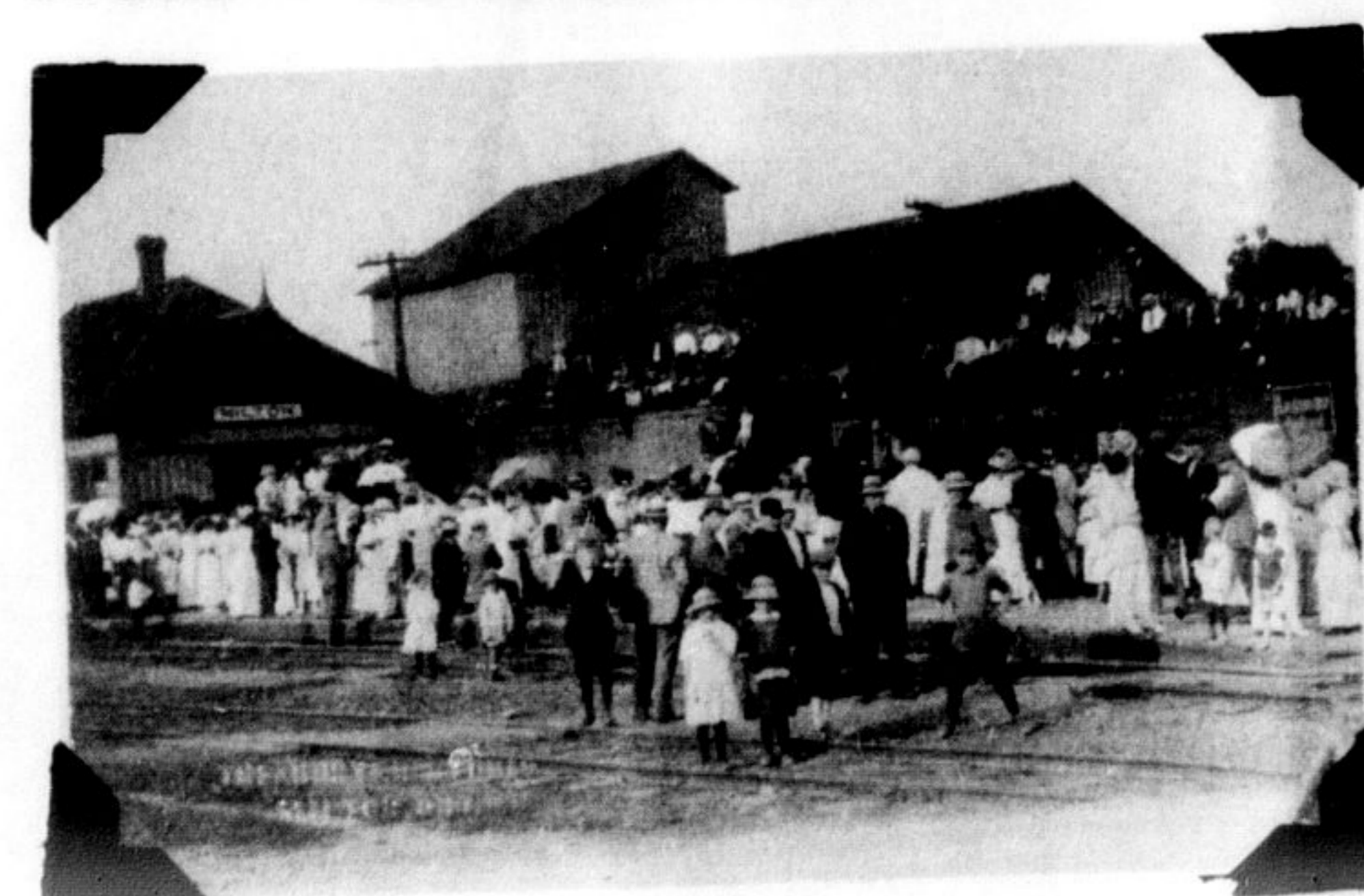
The railways were active spots and a large crowd gathered at the old CN station on Bronte Street to see the 164th Battalion off to war about 1918. The CN station is now serving as the Chamber of Commerce information centre.