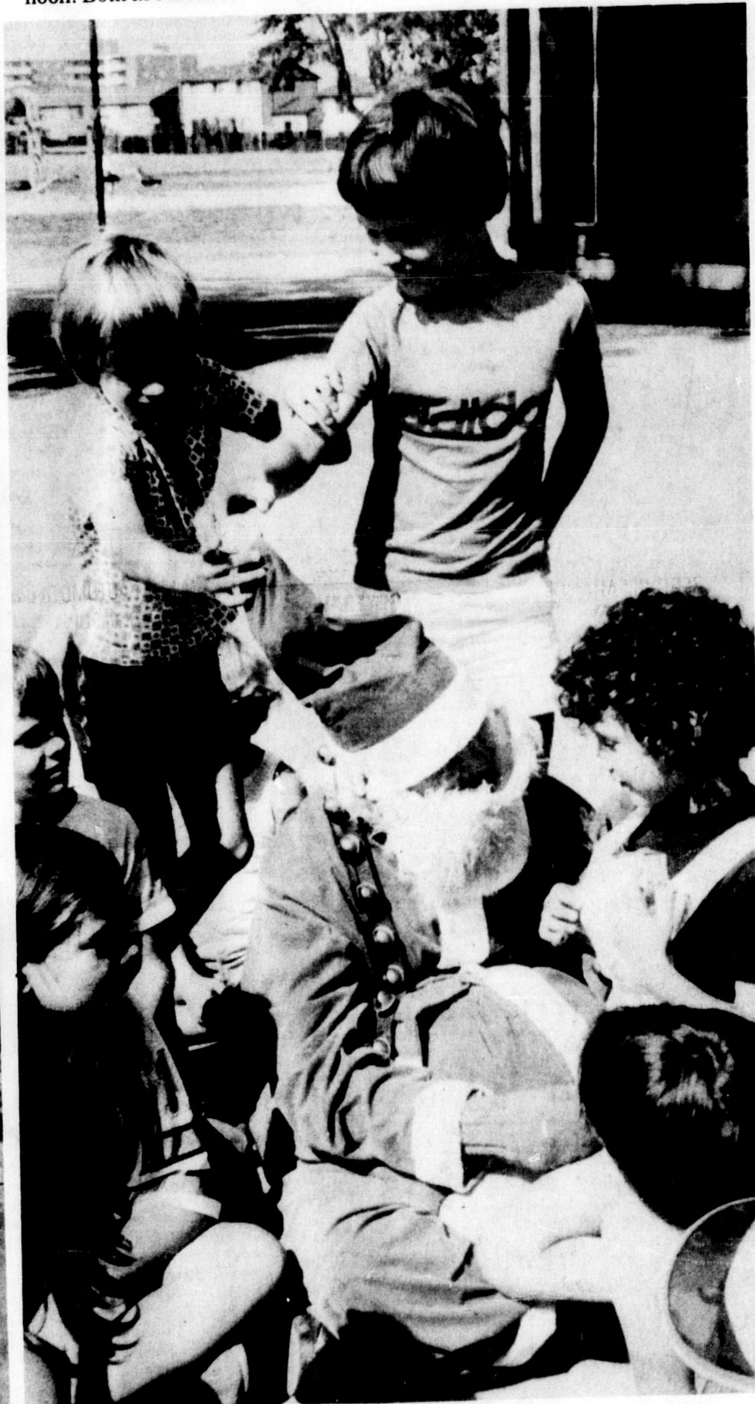
CHRISTMAS in July was one of the treats in Parks and Rec's Play Leadership Program. But visit from Santa Claus and Christmas carols didn't make the day any cooler.