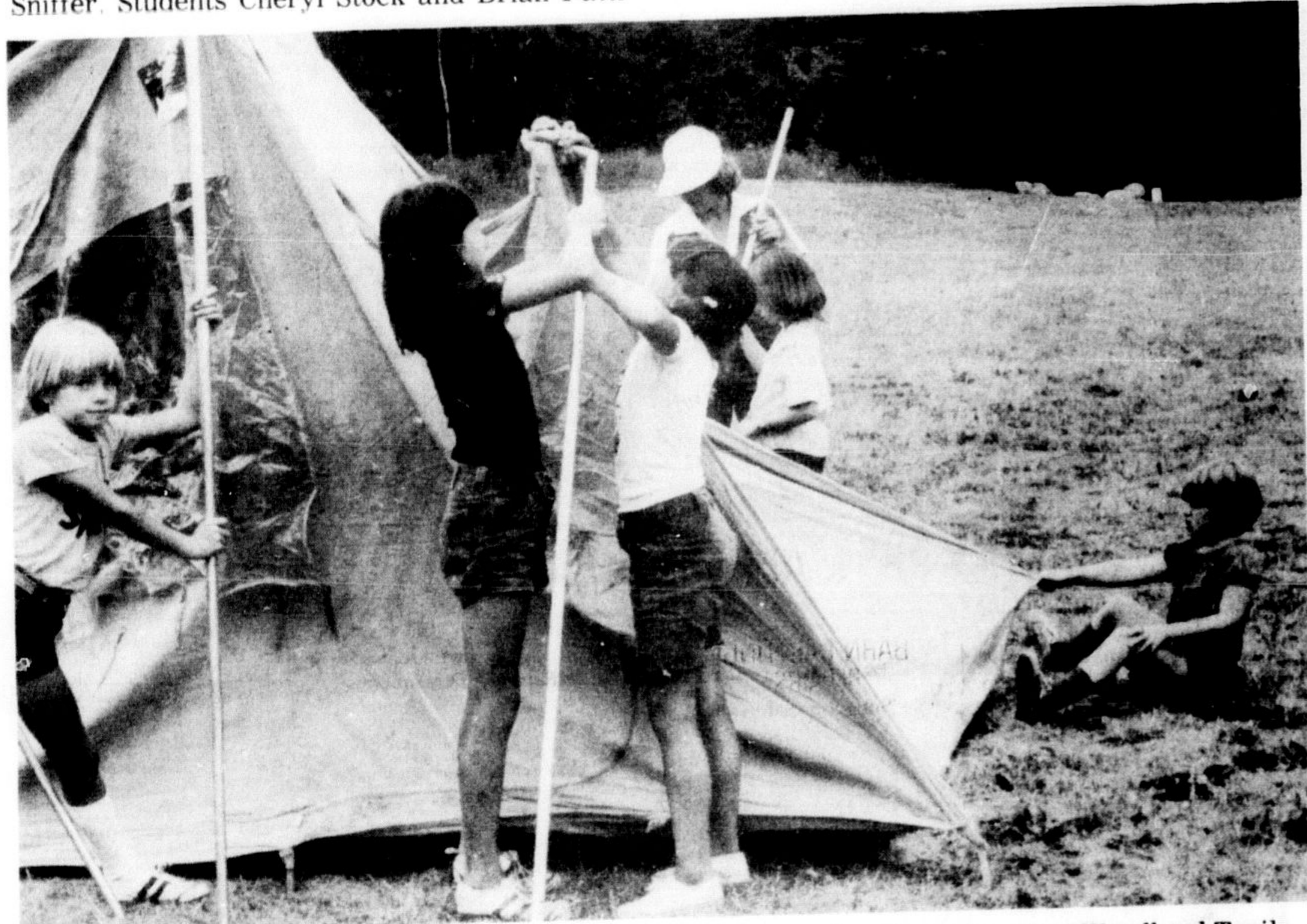
CO-OPERATIVE effort gets a tent up in no time. Camping skills, swimming, canoeing, archery, are but some of the activities offered by Camp Mildaca, a day camp operated by Milton Parks and Recreation Department at Woodland Trails. Four two-week sessions are held during the summer. The last commences Aug. 14 and registrations are still being taken.