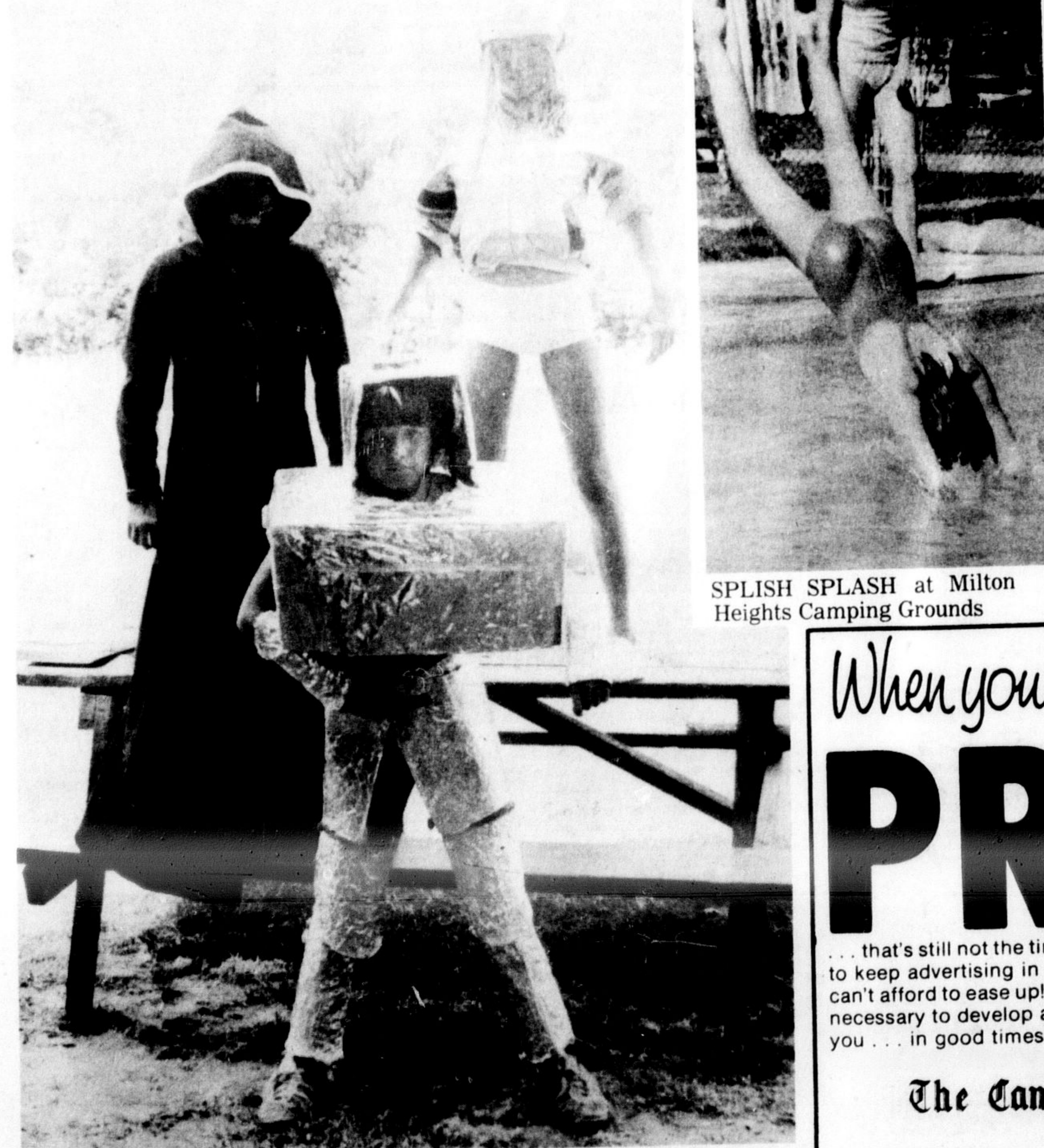
SPLISH SPLASH at Milton Heights Camping Grounds