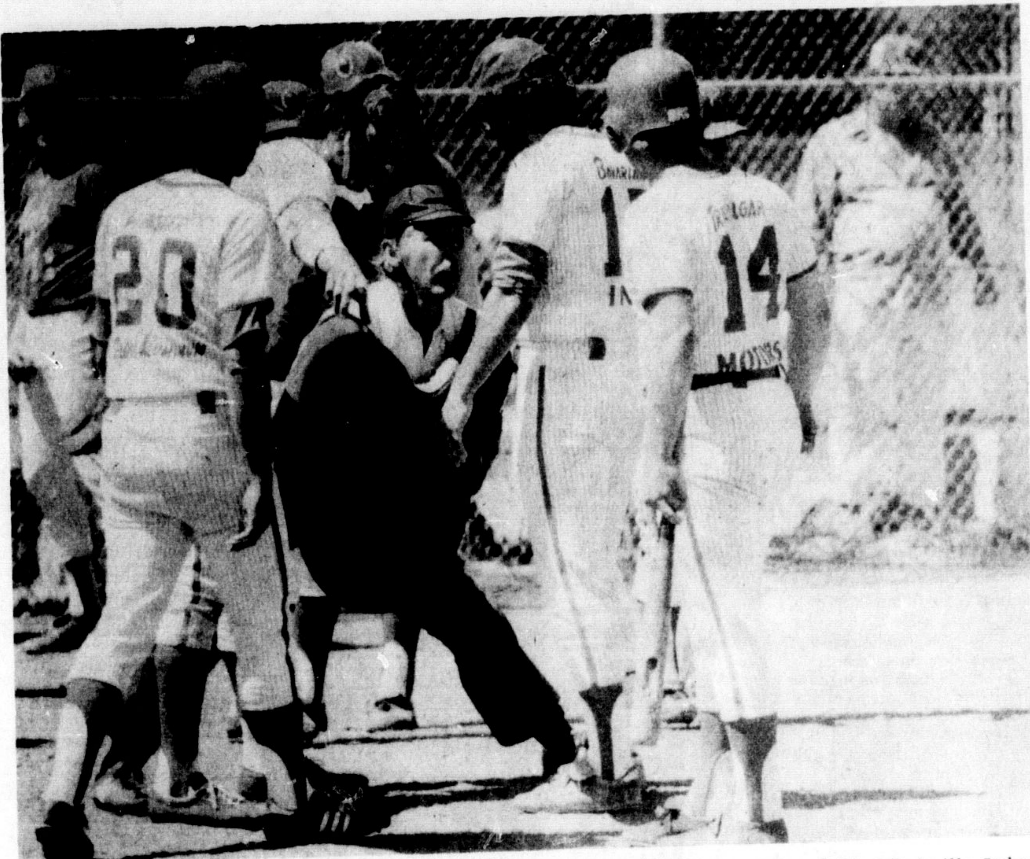
MILTON MERCHANTS hotly protested an umpiring decision in Saturday's game at Best Park, but the home team lost the argument.

much to the delight of the visiting Oakville Oaks contingent. Oakville went on to thump the Merchants on the scoreboard, too.