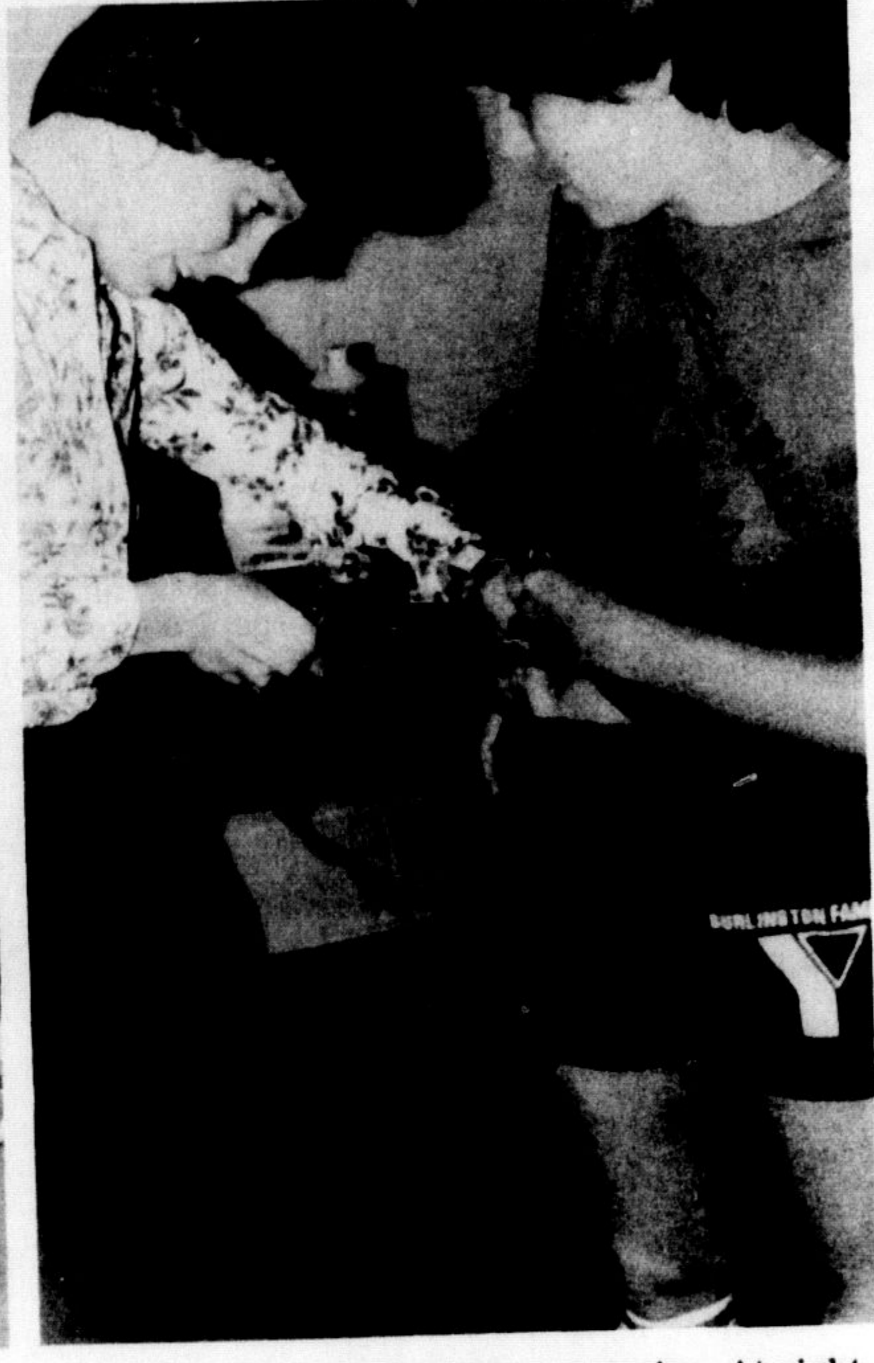
THE FITNESS VAN is coming to Milton on Monday, July 31 to test local residents on their fitness level. At left, staffers check a volunteer for cardio-vascular fitness while monitoring the