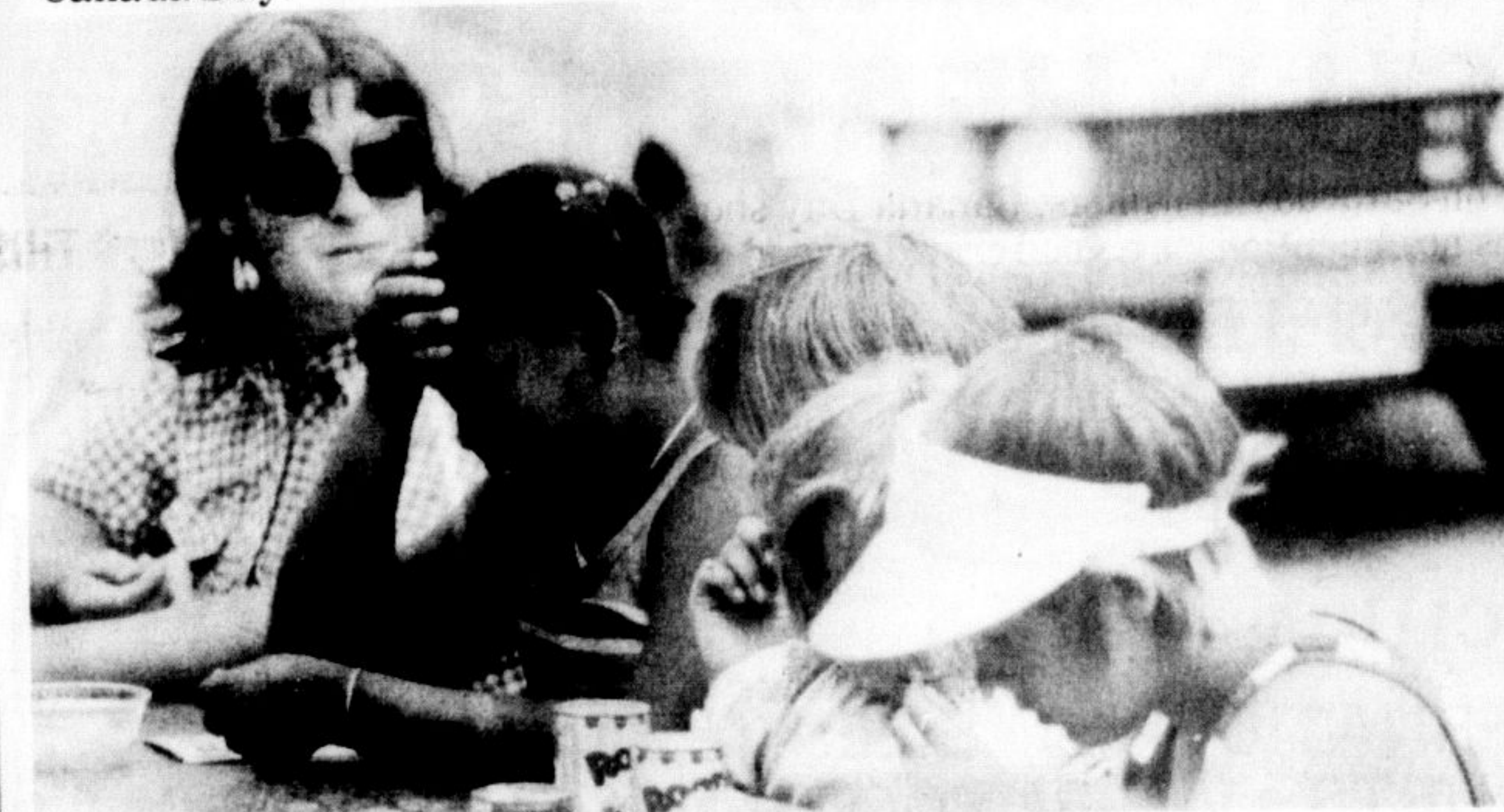
EYES DOWN, watch your cards, and the Kinsmen-sponsored bingo games were underway on Main St. Saturday, as part of the town's July 1 holiday festival. Young and old enjoyed the games.