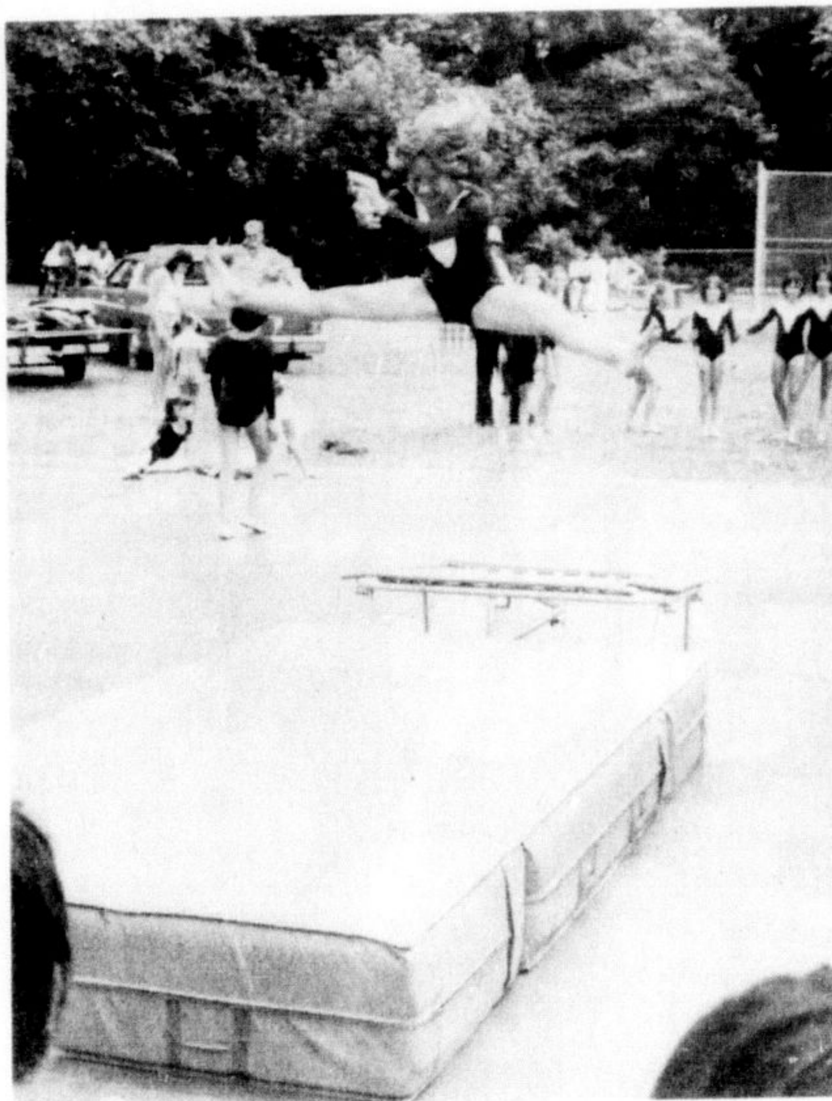
YOUTHFUL GYMNASTS demonstrated their skills during a Halton Gymnastic Club demonstration at Community Day Saturday afternoon. A good crowd watched the show.