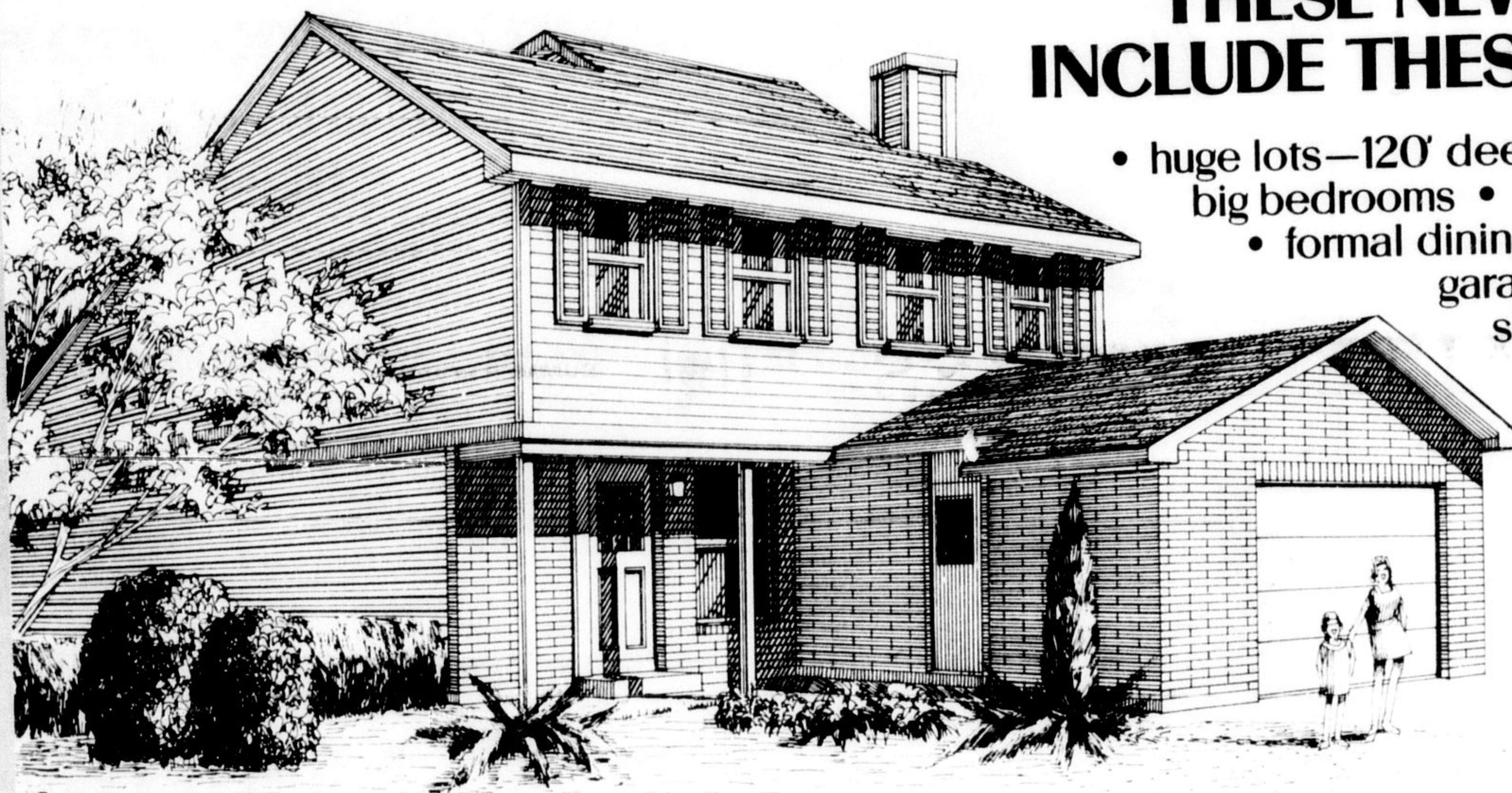
The Heatherwood from $61,990 Artist's Conception

THESE NEW DETACHED* HOMES INCLUDE THESE INCREDIBLE FEATURES: