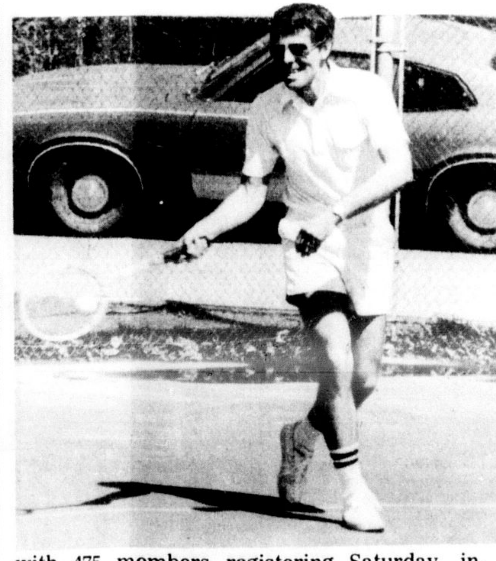
with 475 members registering Saturday, including 275 seniors, 140 juniors and 39 intermediates. Fifty participated in the get-acquainted tournament Sunday.