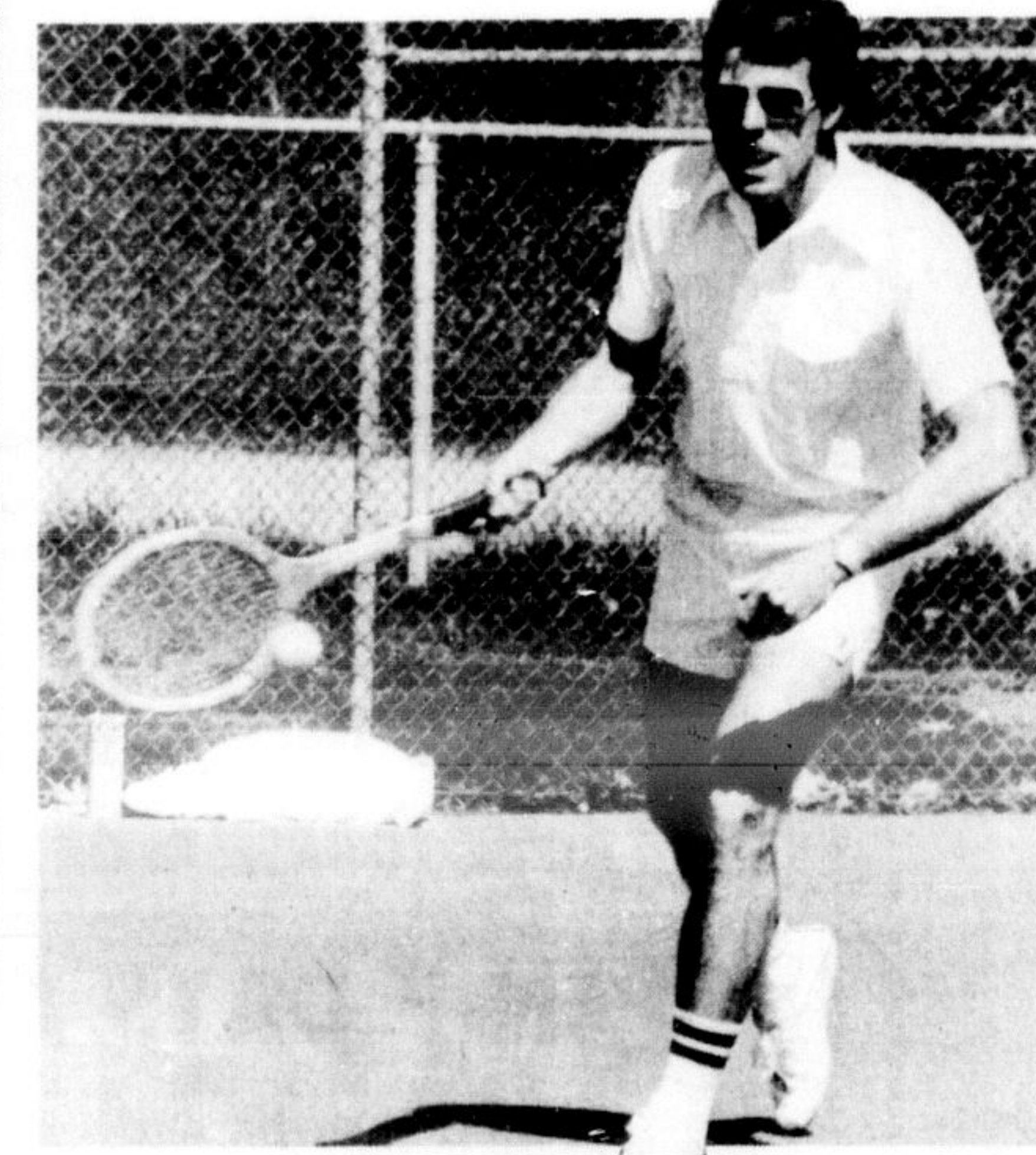
managers banquet held the evening before. Milton tennis club members are in full swing

"We realize he's still a junior level competitor but