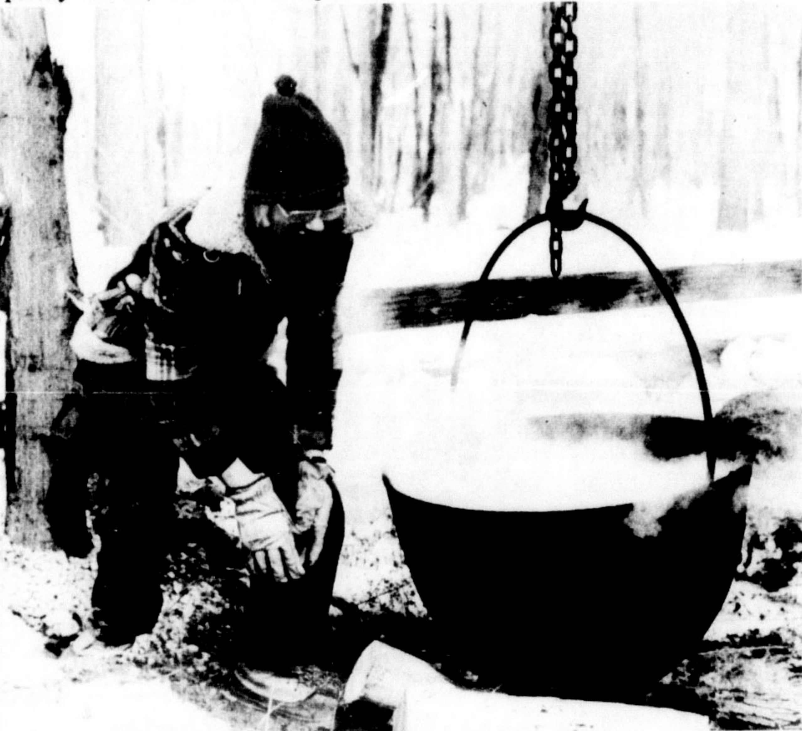
festival demonstrates the process of maple syrup and candy-making with both traditional and modern processes.