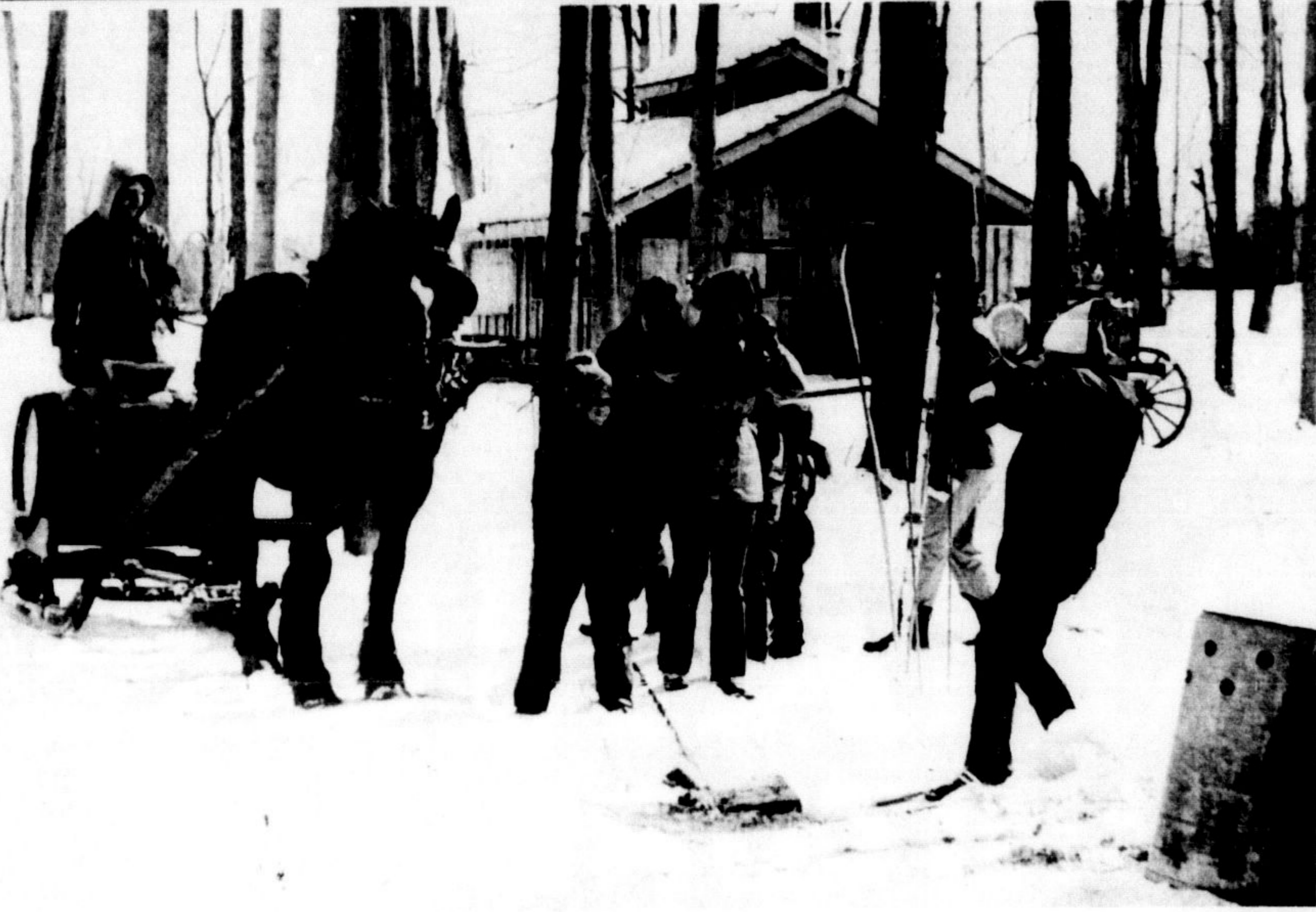
IT'S A DAY FOR PICTURES, as visitors to Mountsberg's maple syrup festival pose beside the Centre's own horse-drawn sleigh. There is plenty to do, see and sample as the annual