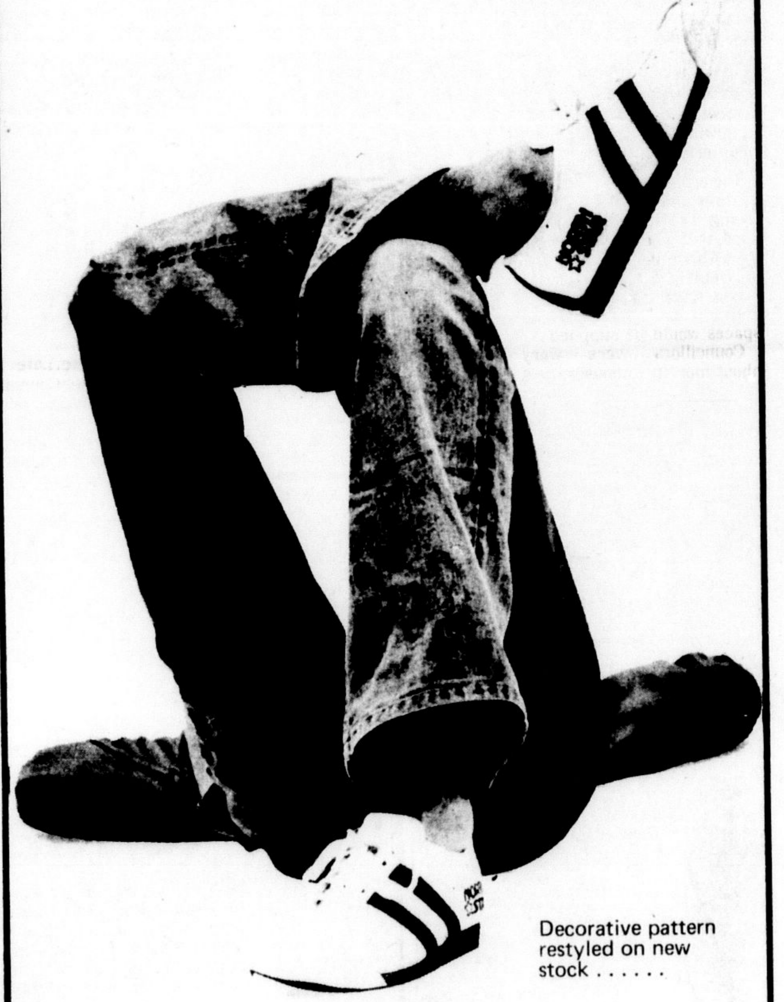
Decorative pattern restyled on new stock.....

$1188 STOCK UP FOR THE WHOLE FAMILY AT THIS LOW LOW PRICE!