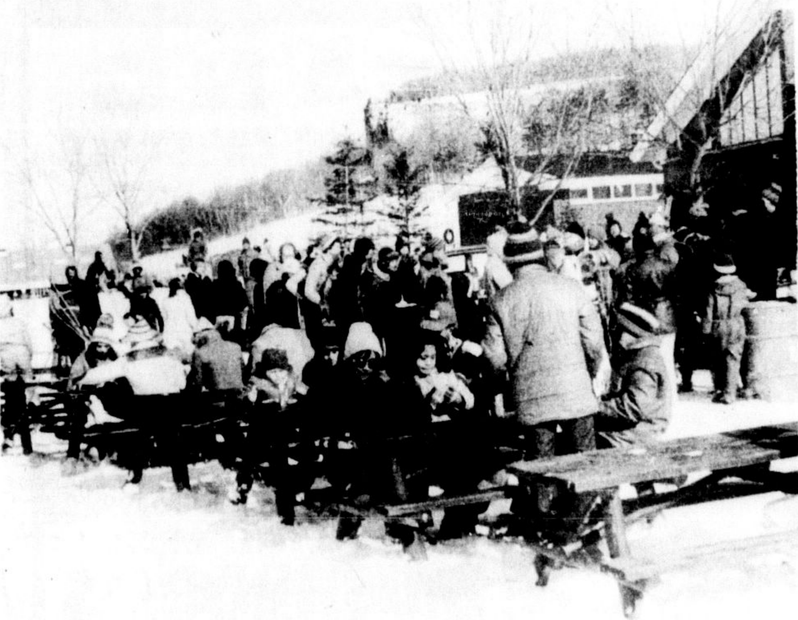
THE OAKVILLE Rod and Gun Club was overwhelmed with people wanting pancakes and sausage. They sold out early.