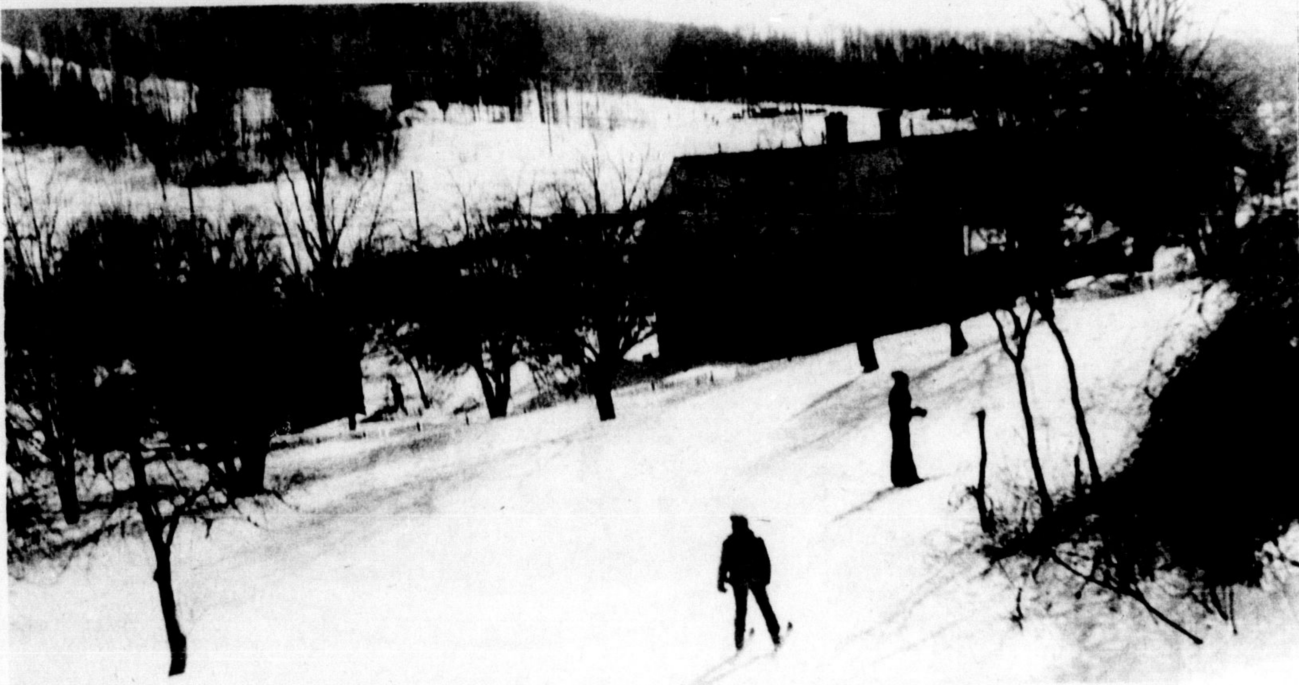
SKIERS WERE TREATED to an excellent view as well as fine conditions Sunday at the regional winter carnival.