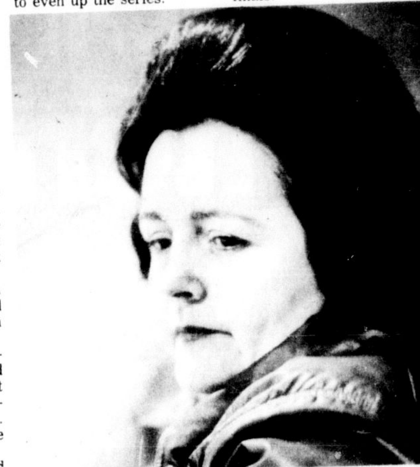
She's number one in Flyers' fan book

Flyers will be at home Friday night against Oakville Blades or Dixie Beethives, whoever wins that series being wrapped up this week. At press time Streetsville had two crushing wins over Georgetown and it appears they will be in the league finals.