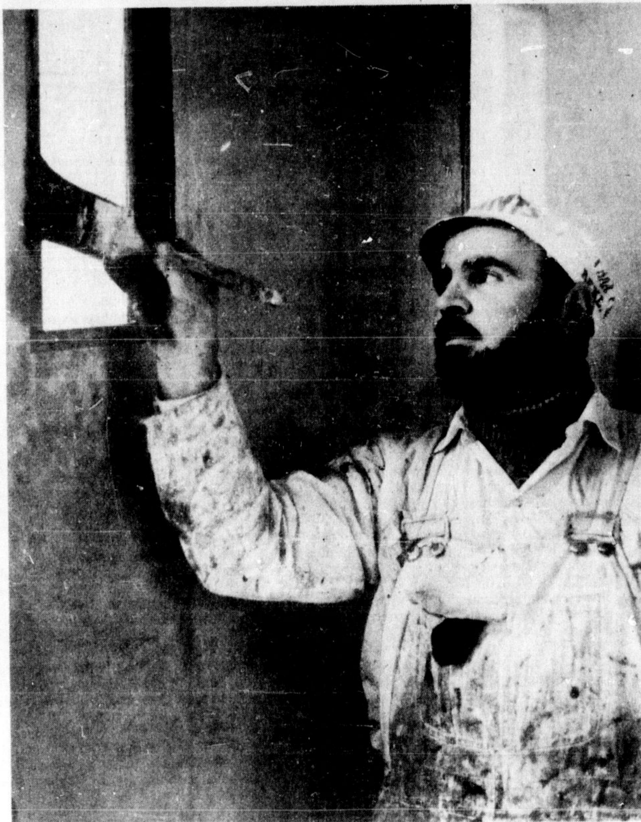
PUTTING THE FINISHING TOUCHES on Milton's new Sports Centre is one of the painters contracted to work on the job. Work was scheduled to be completed Monday, in time for the public skating program.