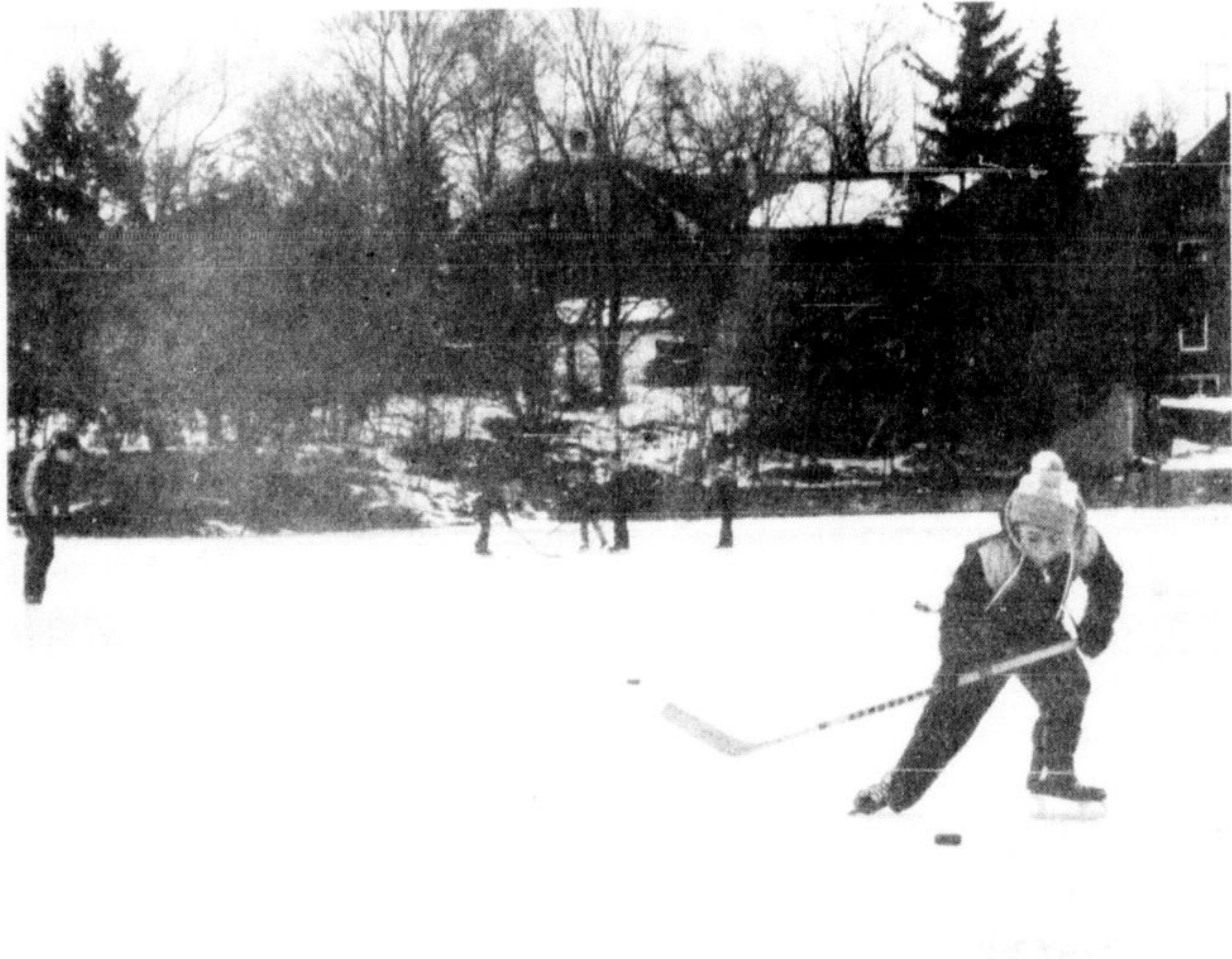
WHILE AWAY FROM SCHOOL during the Christmas holiday many students took advantage of the frozen Mill Pond in Centennial Park. Pickup hockey games or pleasure skating were evident during most of the holiday period because of cold temperatures combined with little precipitation.

many students and families to take advantage of the large frozen pond, over the Christmas holidays.