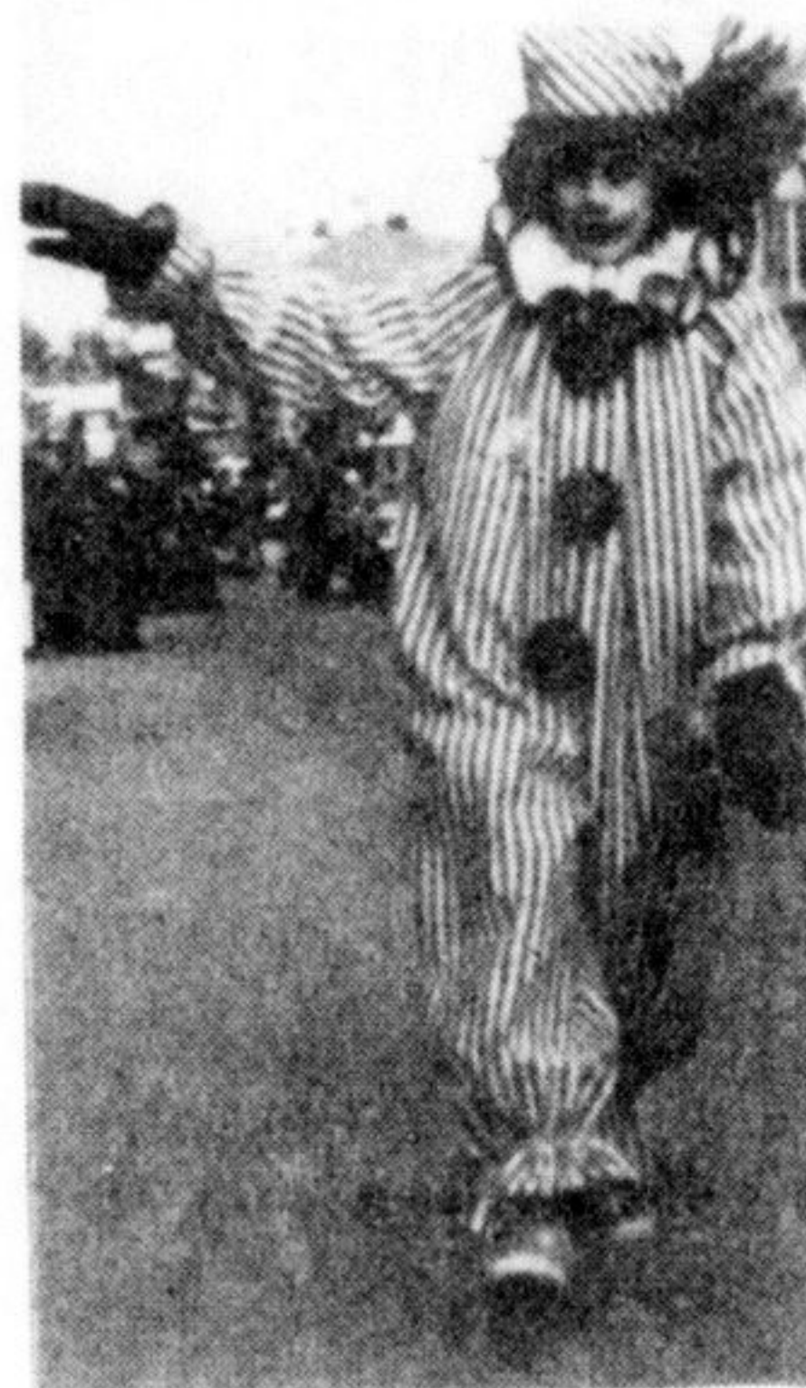
WAVING to all his (her?) friends at the parade is a Burlington Clown. There were 50 clowns from the Burlington school at the parade.