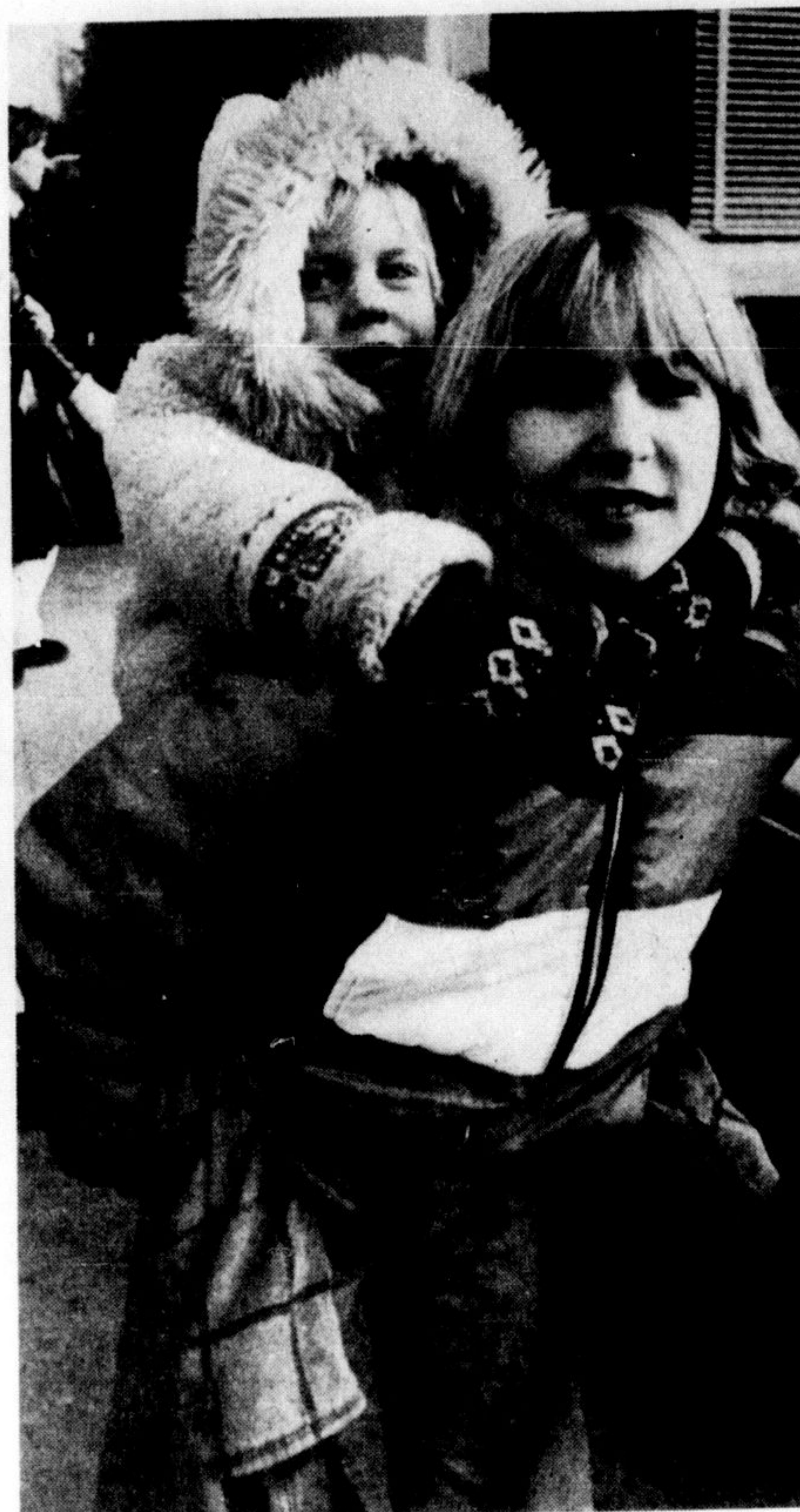
RIDING HIGH for a better view of the parade, this little one used a friendly back for a vantage point. Thousands lined the streets to cheer St. Nick's arrival Saturday, and it was a grand parade.