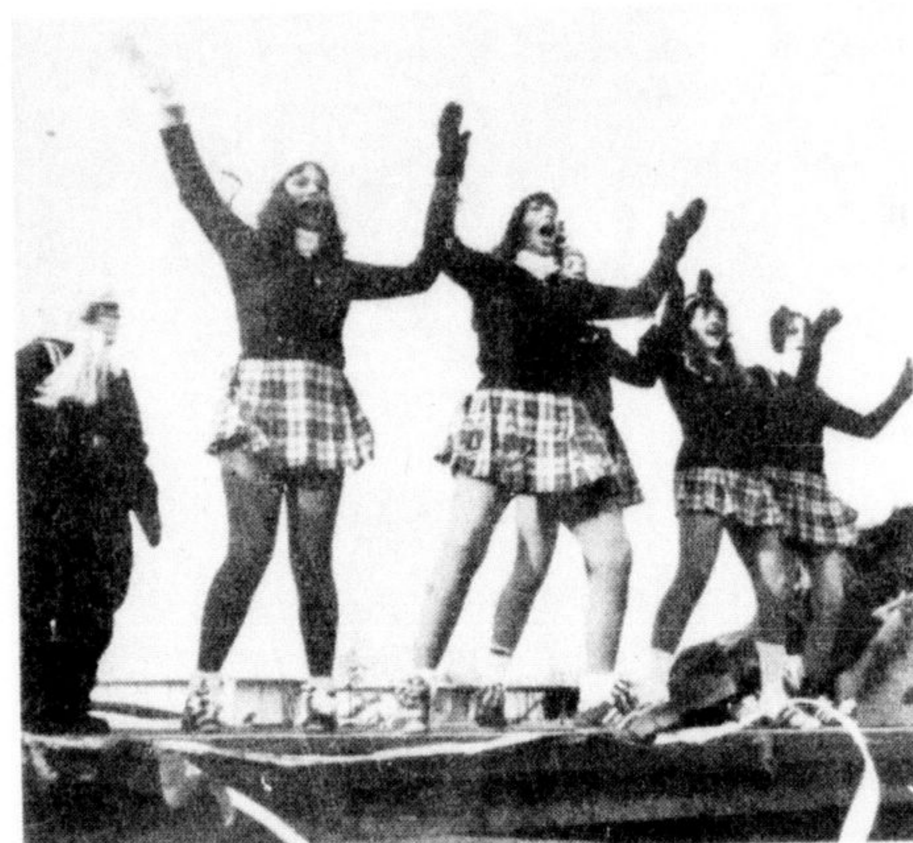
LET'S HEAR IT for good old Milton District High School, urged the cheerleaders riding on the school float in the Santa parade. The girls kept themselves warm with cheerleading antics.