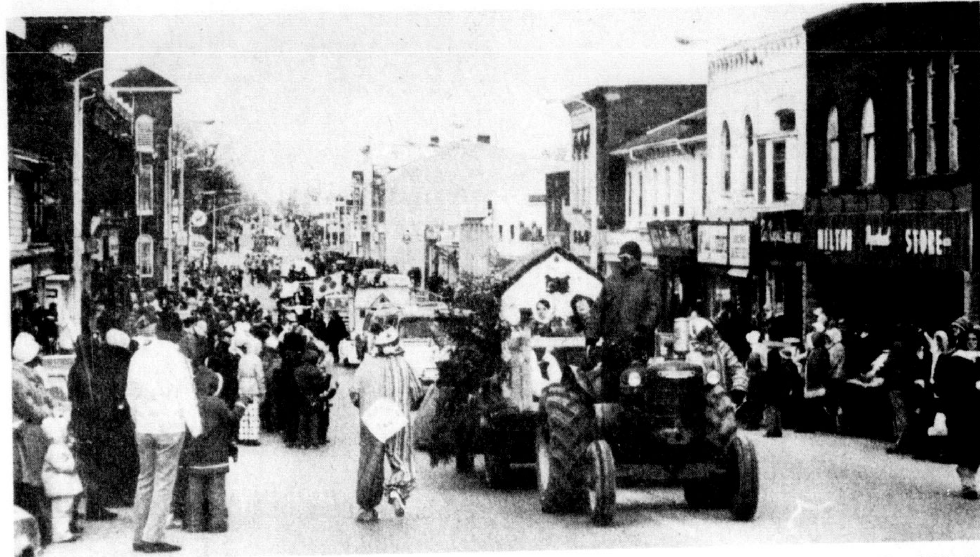
PEOPLE LINED the route all the way from the Ernest C. Drury School on Ontario St. to the corner of Main and Brown Sts. Saturday to watch the Santa parade. While many people picked spots along the parade route, the heaviest crowds congregated along Main St.