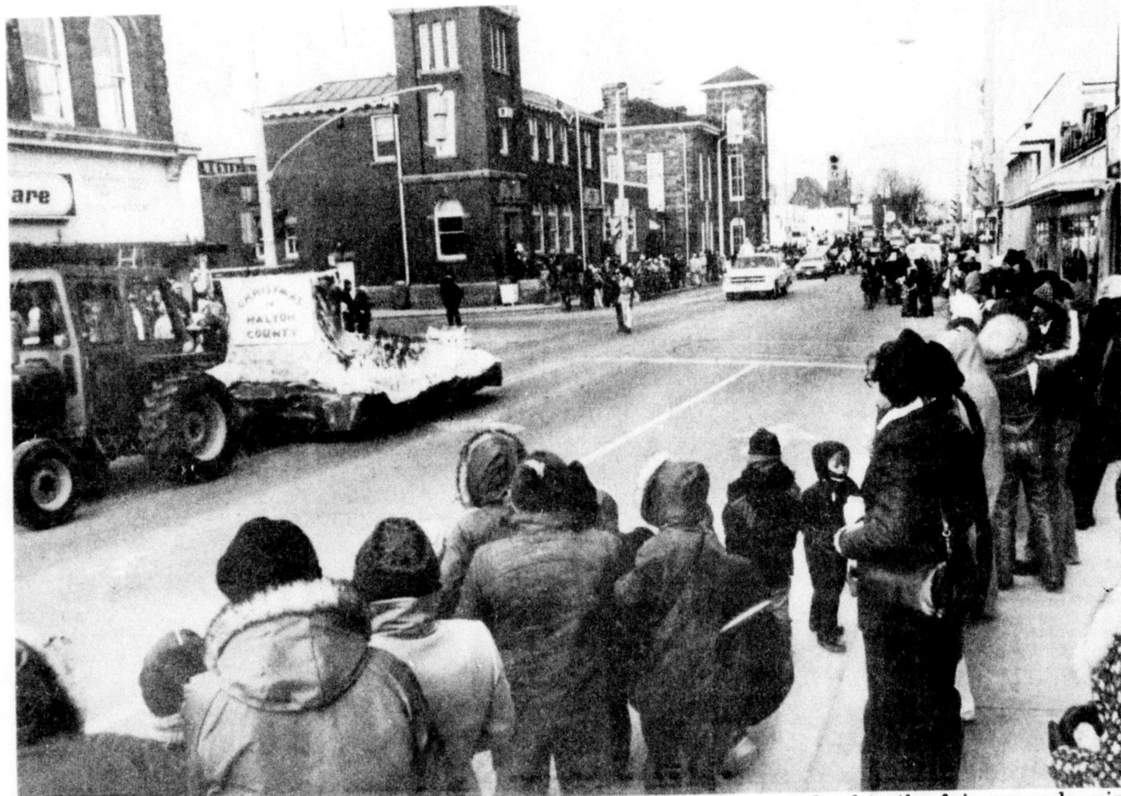
A LARGE CROWD braved the cold weather to witness Saturday's Santa Claus parade through Milton. The longer than ever parade wound its way from Drury School to the fair grounds, via Ontario and Main Sts. and provided plenty of thrills for the little folks.