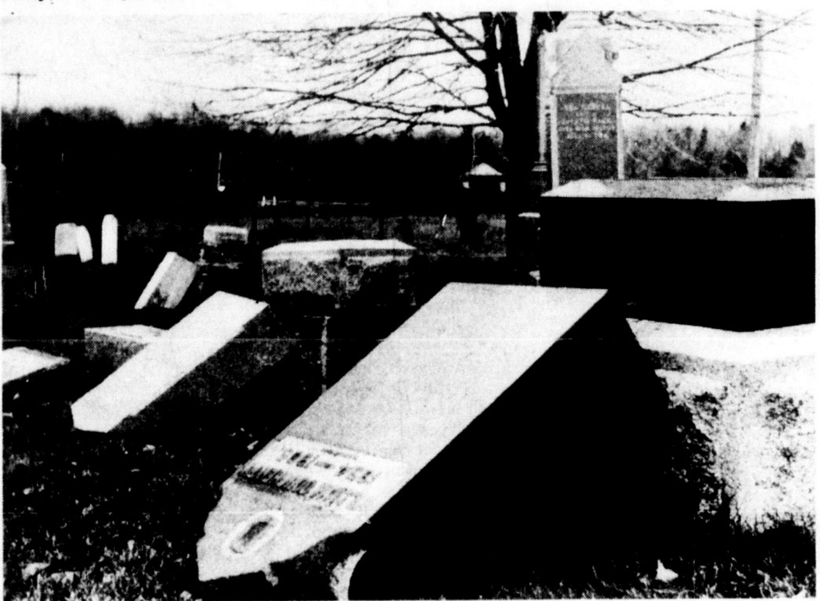
DAMAGE TO A PIONEER CEMETERY a heartbreak.

To get there take Highway 8 north from Highway 401. Follow signs that say north to Highway 85, turn right on Bridgeport St. and then take another right on Bluevale.