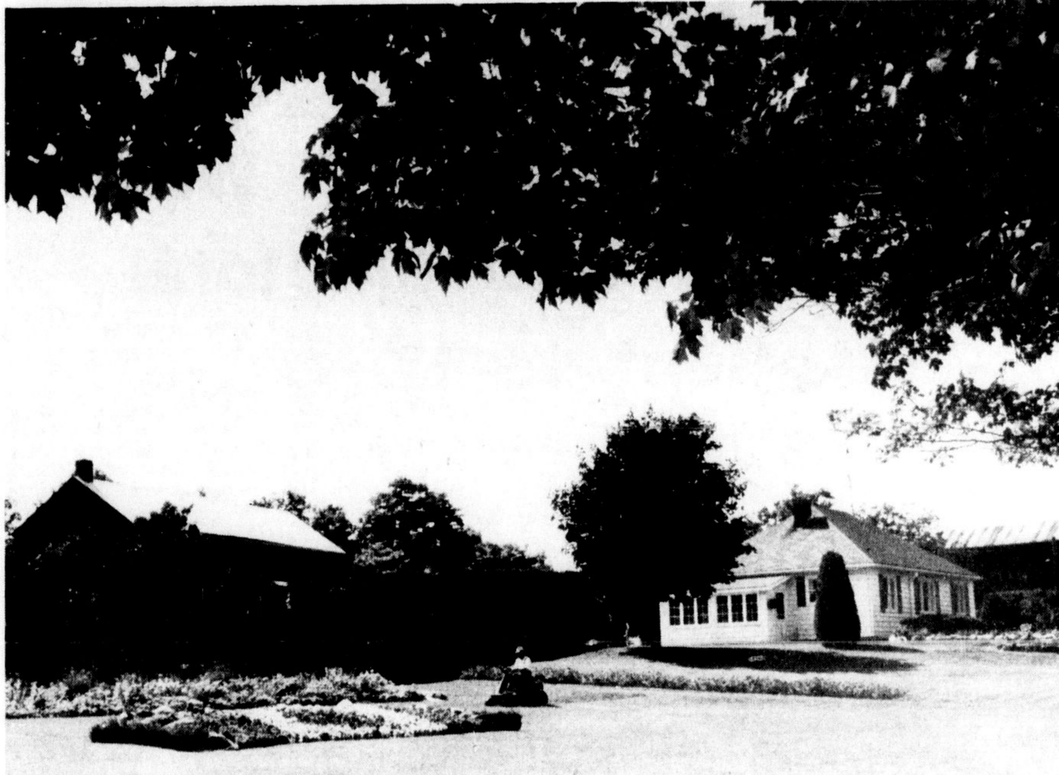
A CANADIAN FLAG made of flowers is foremost in 88-year-old Richard Tinkler's garden

in Kilbride. The Tinklers have been in the market gardening field for over 50 years.