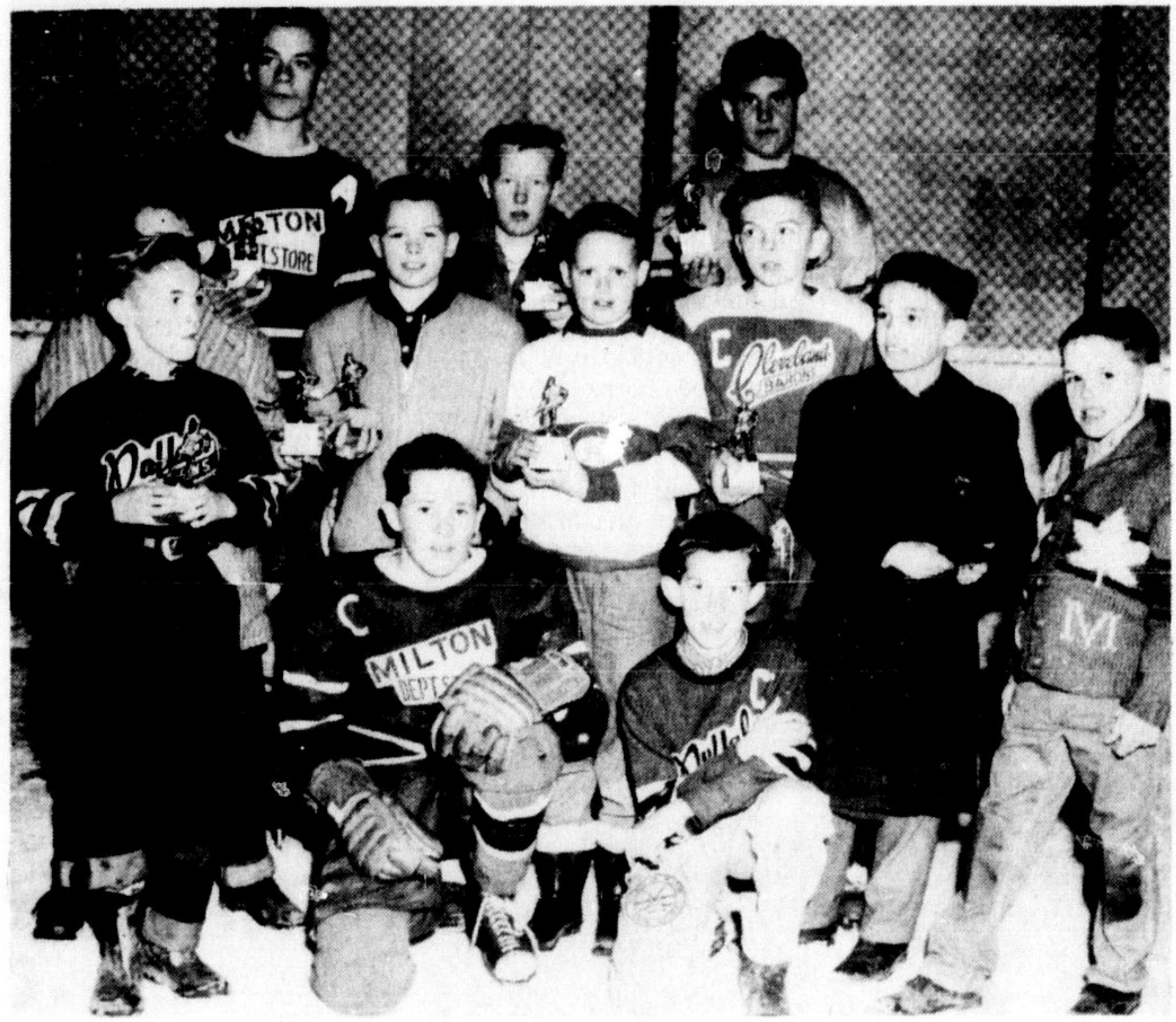
Remember when . . .