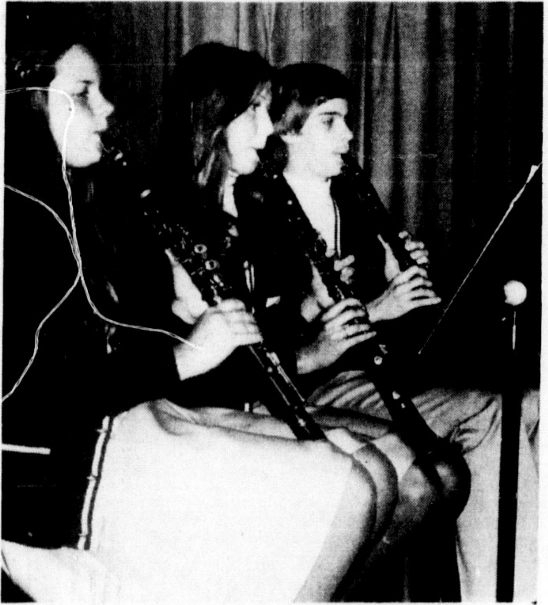
CLARINET PLAYERS in the school's senior band give it their all during the Wednesday mini-concert. Three bands, gymnasts, folk dancers and the school players entertained a crowd.