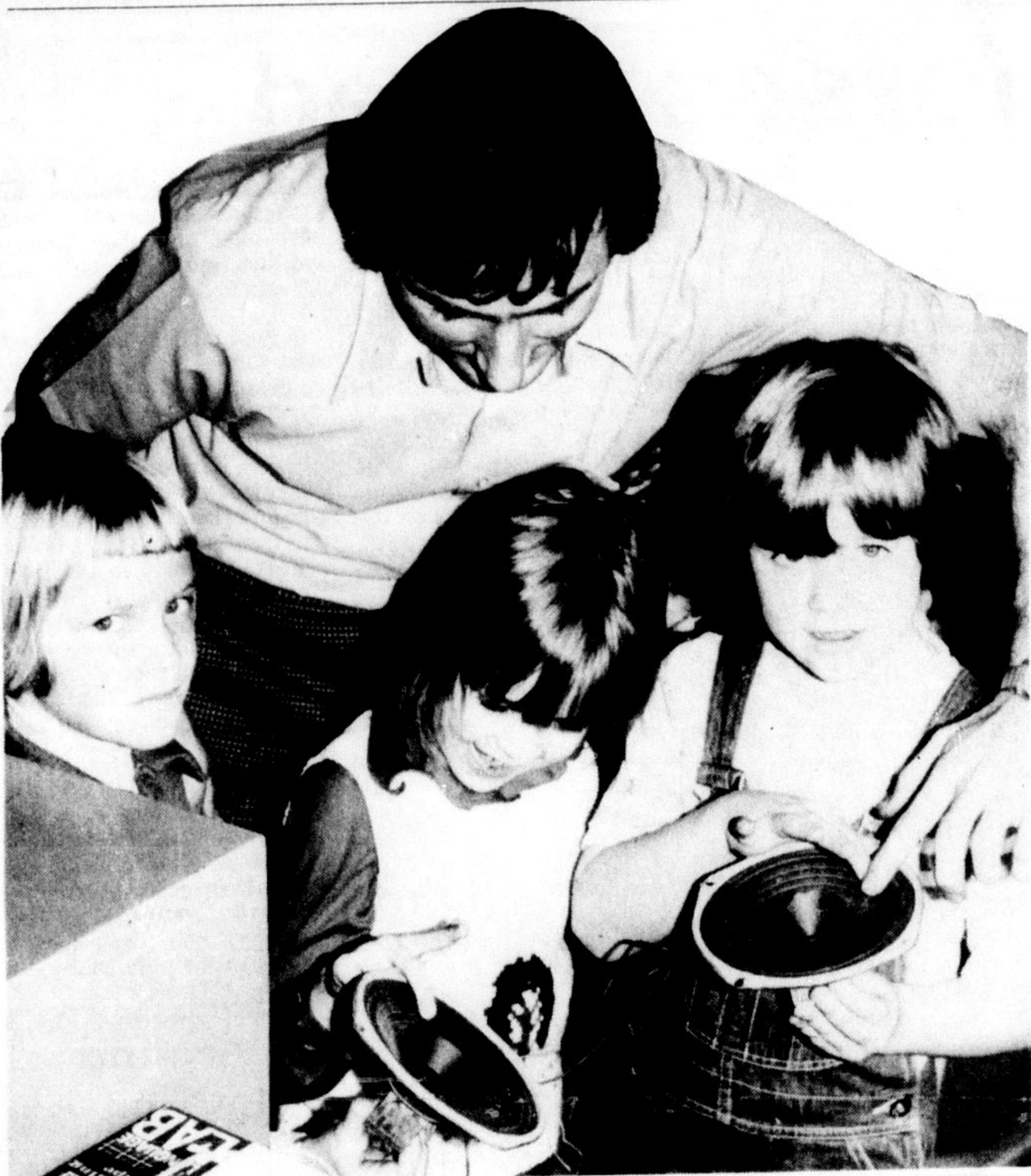
FUN at J.M. Denyes