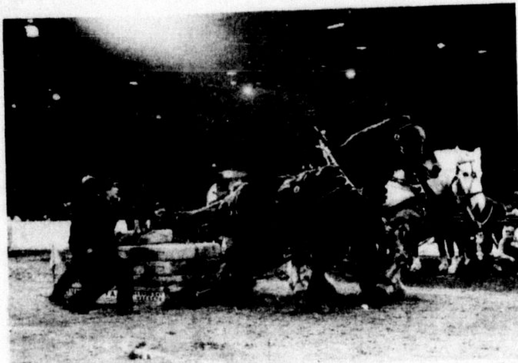
Championship draft horse draws will be among the features of the Canada Farm Show, February 1 to 4, at the Coliseum, Exhibition Place, Toronto.