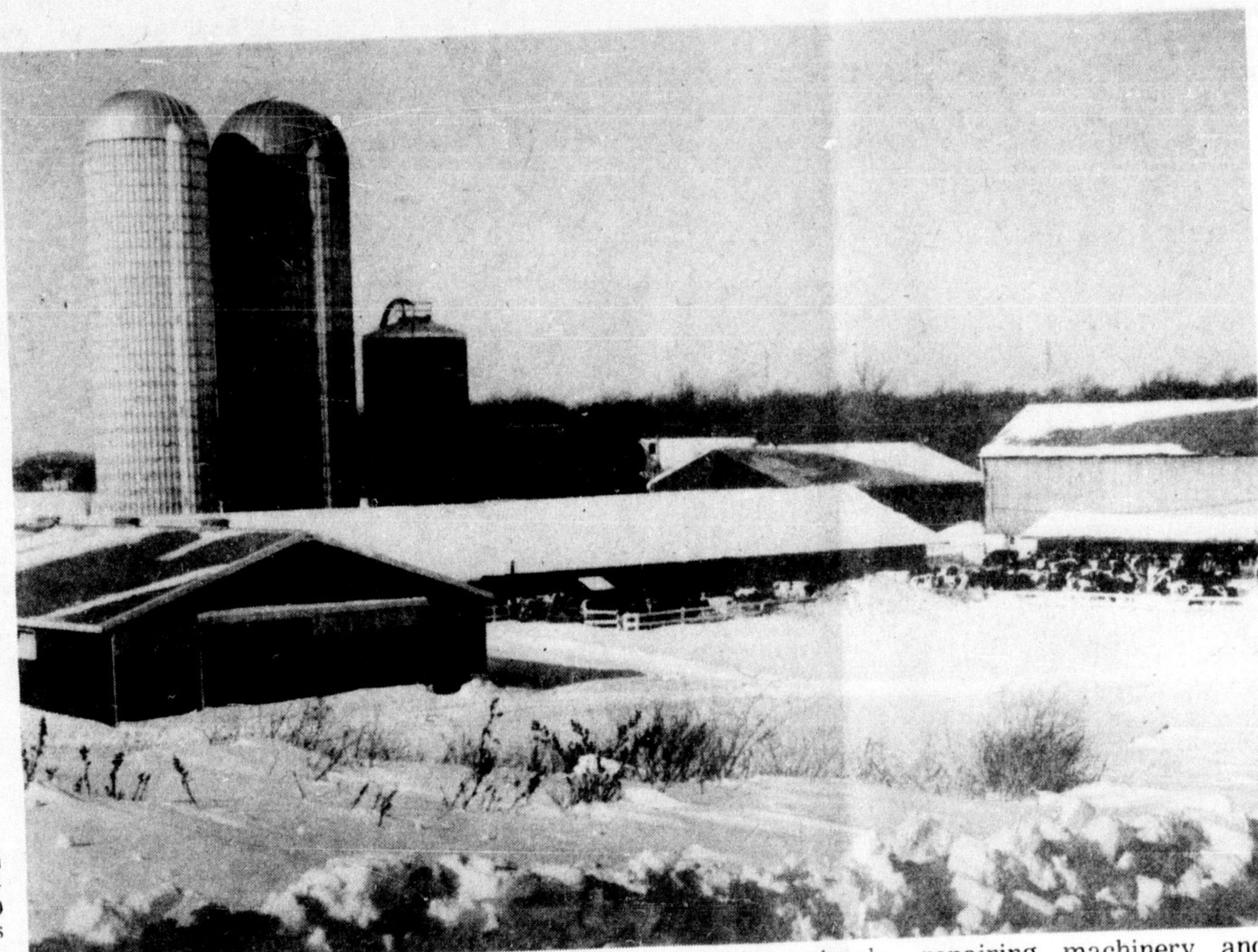
THE CHORES CONTINUE. Ontario farmers continue their farm chores, even in winter when the fields are covered in snow and the earth takes its annual rest. Inside, farmers are busy feeding animals, repairing machinery and making plans for spring planting.

Exhibits at this year's show will be open from 10 a.m. to 6 p.m. daily. Tractor and horse pulling events start at 6 p.m.