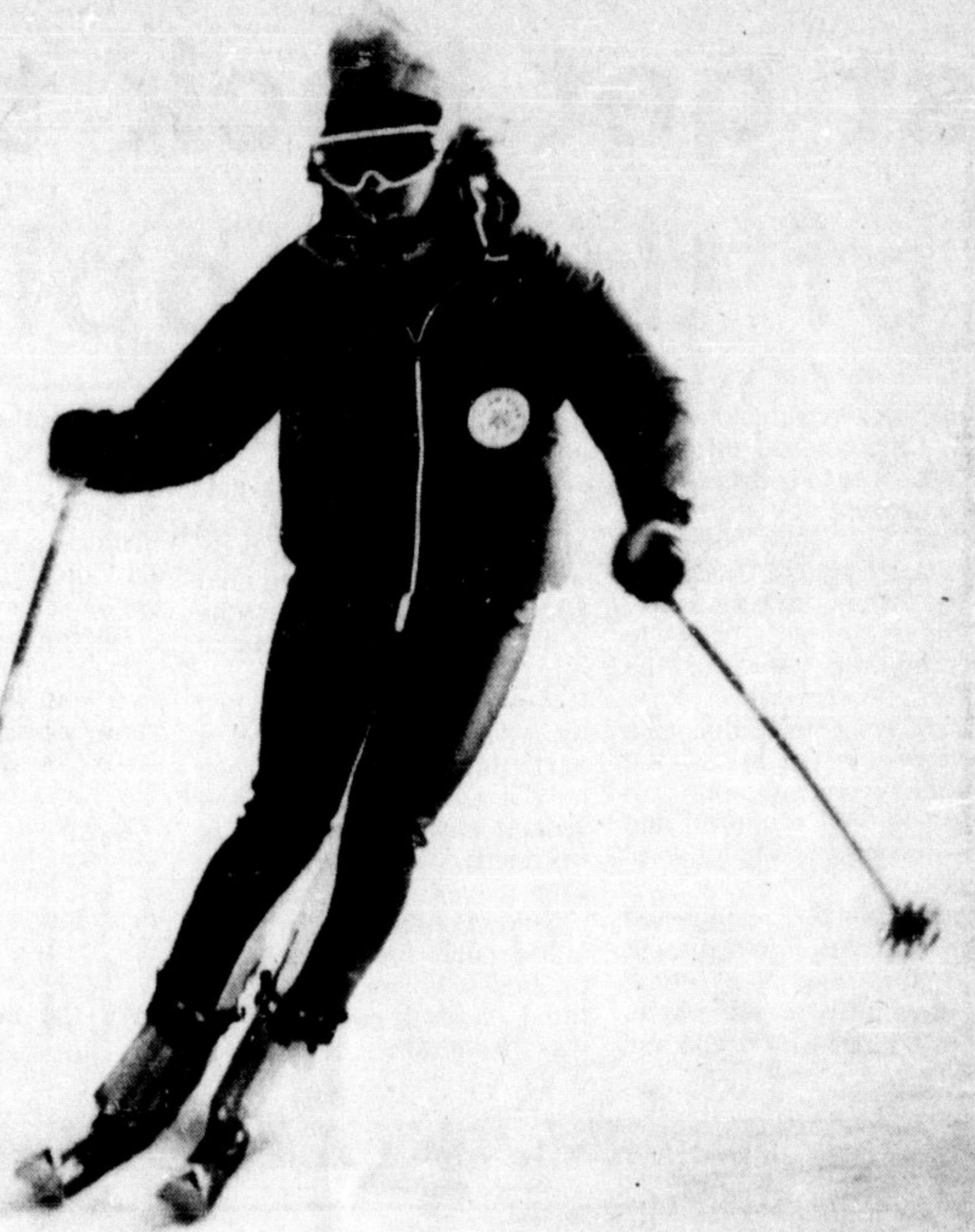
SKIING SEASON is in full swing on the local Glen Eden slopes in Kelso Conservation Area. Western parts of the continent have had a poor snow-fall so far but Ontario has been hit with a heavy fall since late November, making this year one of the best in the past decade for skiing.