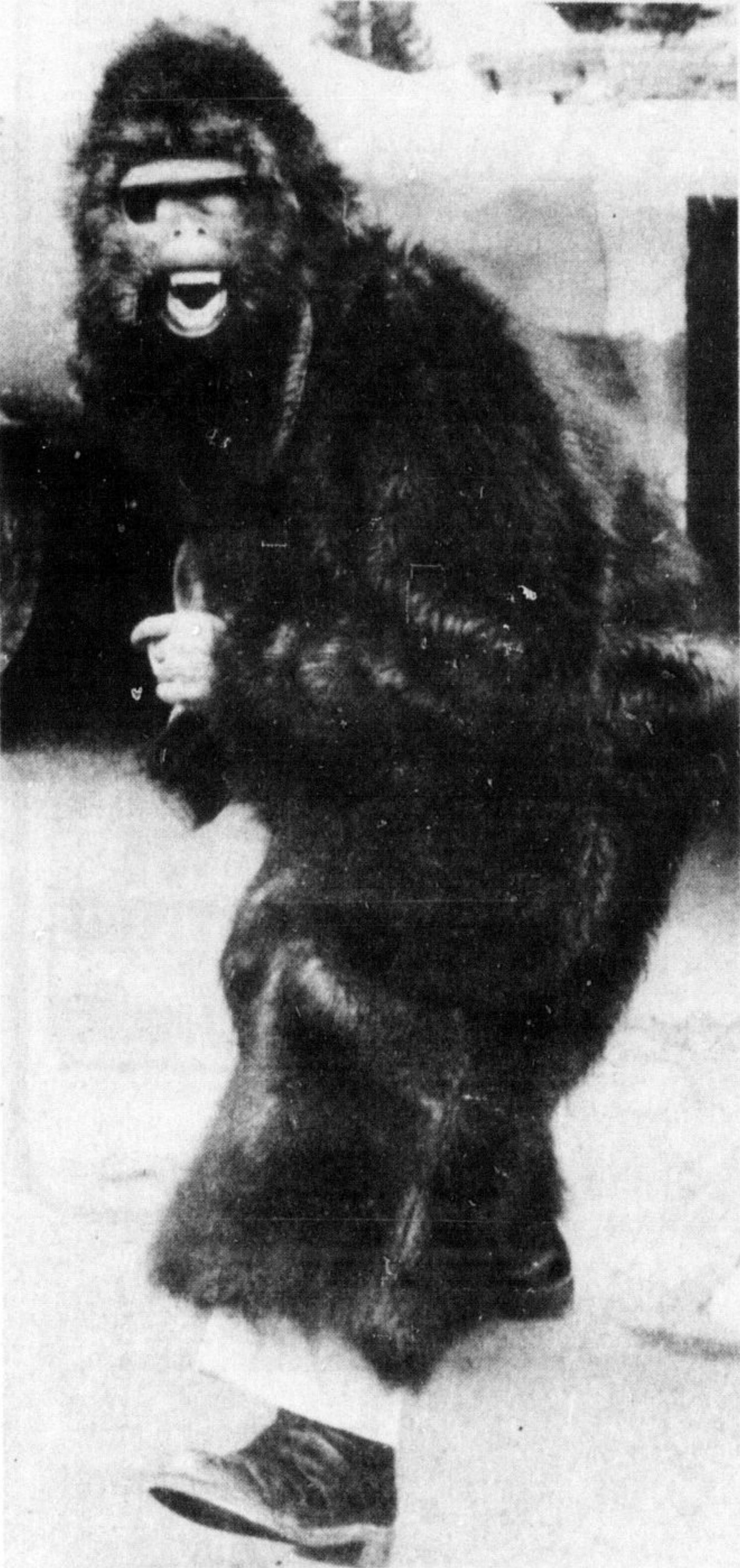
FEROCIOUS CHARACTER menacing the photographer was one of the clowns in Santa's Saturday entourage.