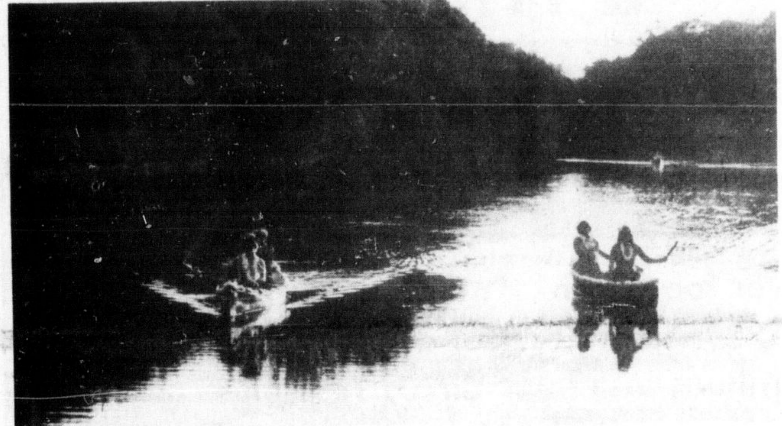
ARRIVING HAWAIIAN STYLE: Sun-washed canoes sail to shore at the mill pond carrying visiting Hawaiian dignitaries to greet the waiting crowd.

Rotary Park became an exotic, palm swept island for a few hours Wednesday night when Milton's summer playground staff presented a Hawaiian luau complete with hula dancers, fire baton twirlers, a fire eater and boar's head feast.