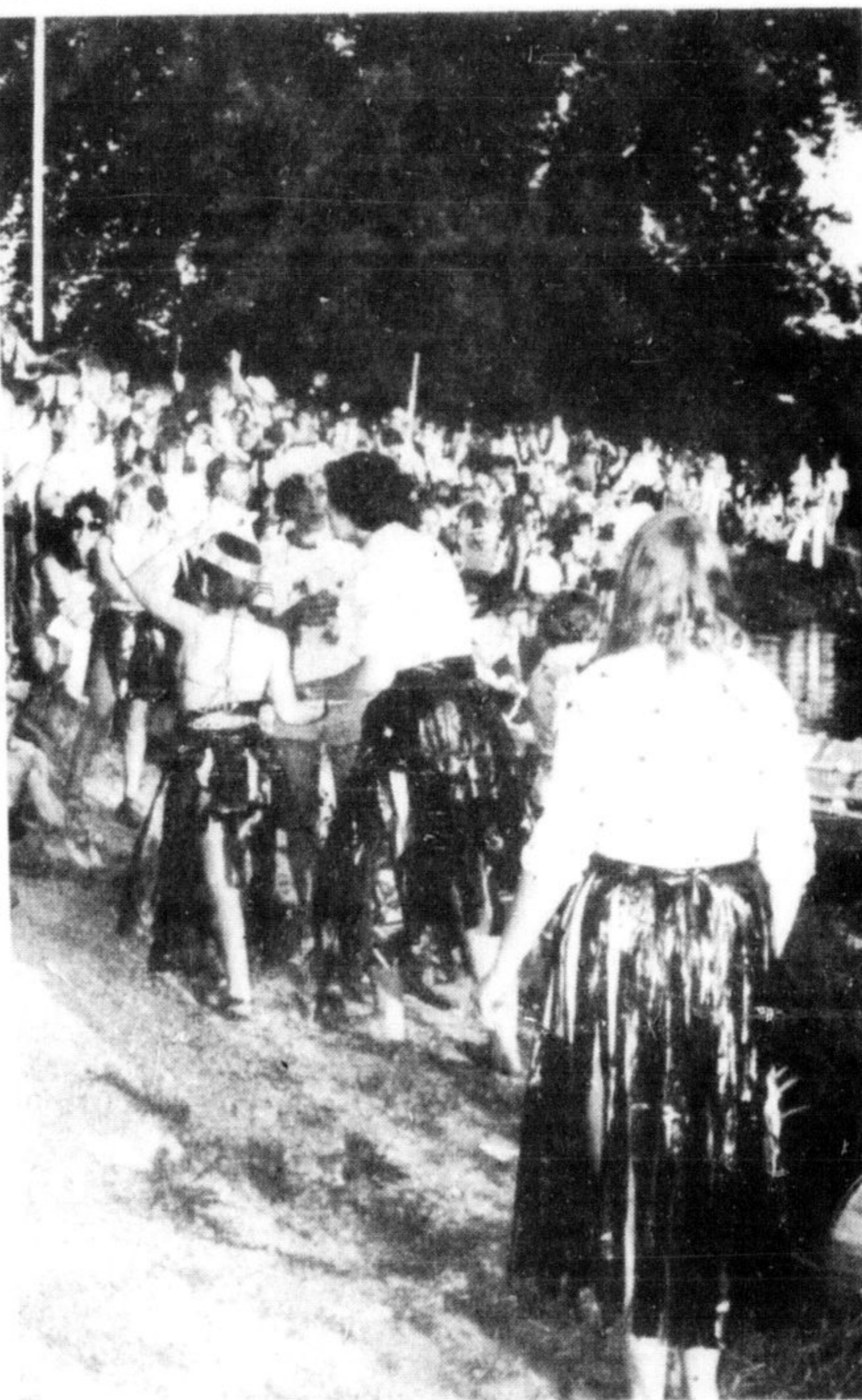
CROWDS GATHERED along the shores of the mill pond to get a look at the visiting Hawaiian prince and princess who arrived by way of canoe for Wednesday night's festivities.