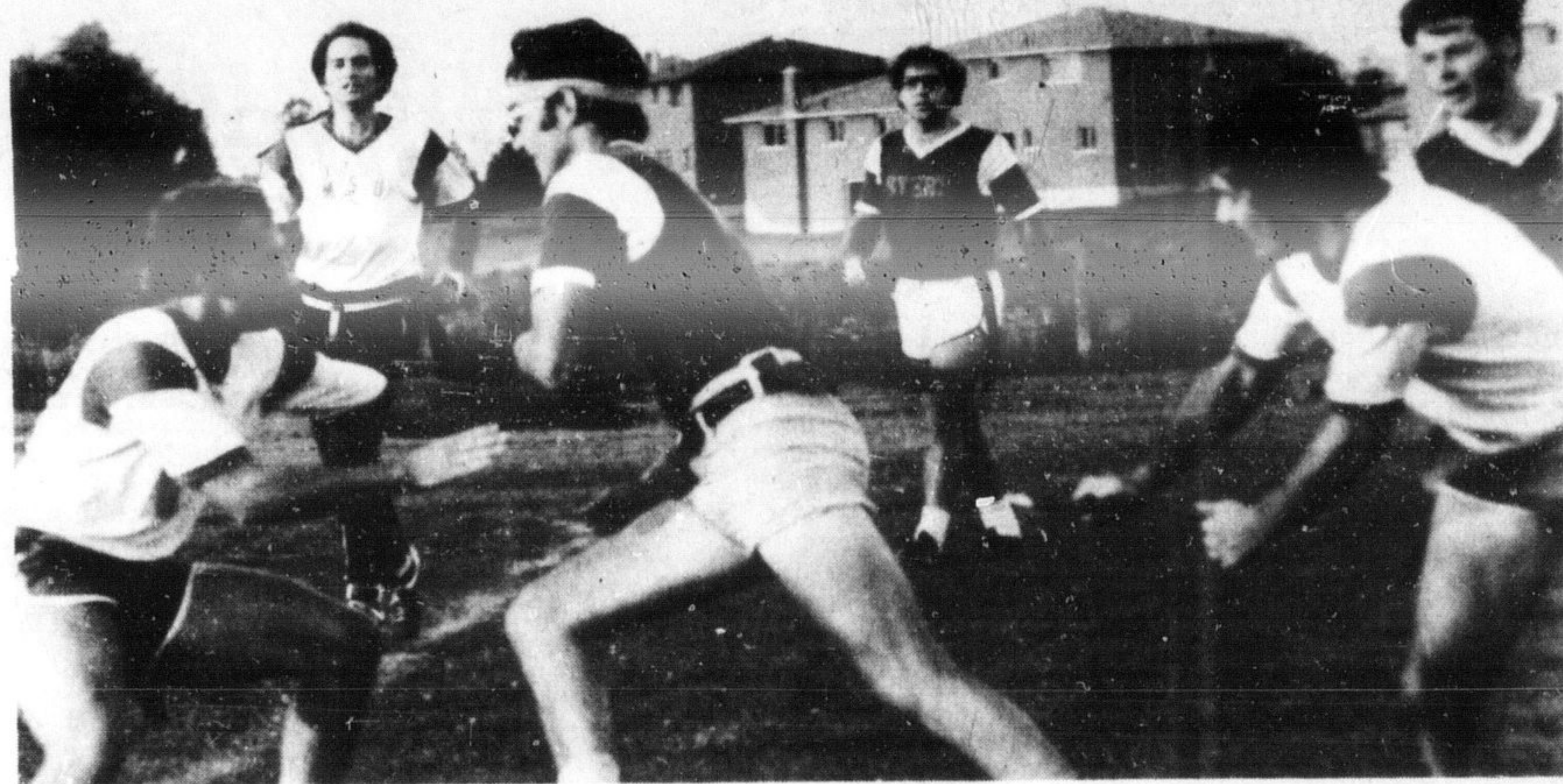
SYERS RUNNER tries to elude the outstretched arms which are reaching for his flags during Thursday's flag football game. Syers beat Milton Sports.