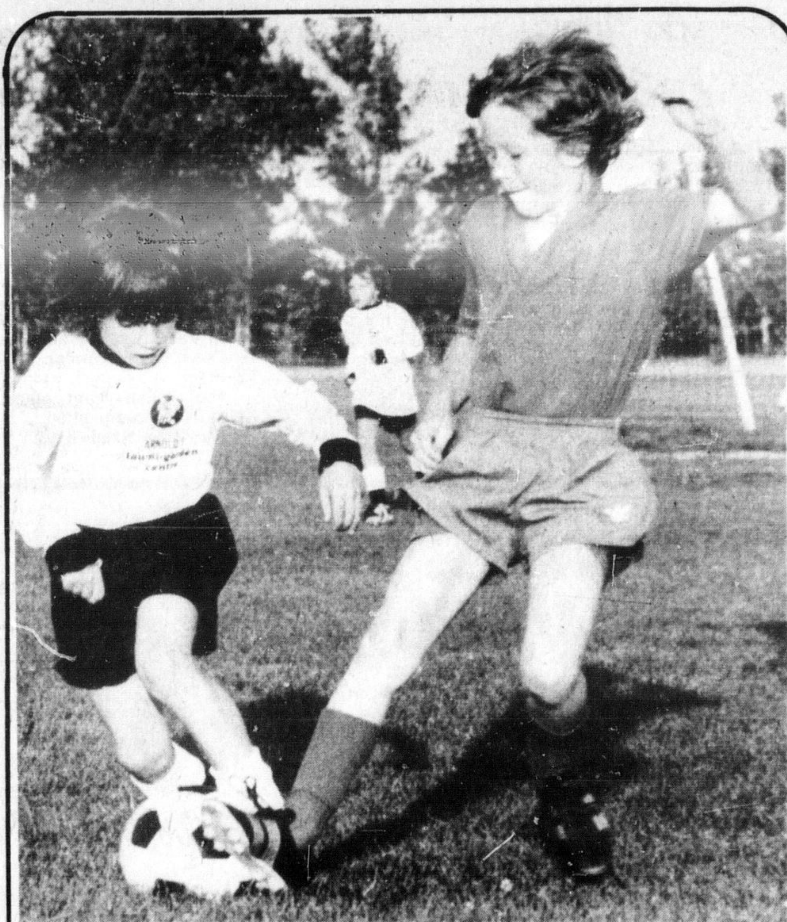
ATOM PLAYERS FIGHT FOR THE BALL at the Limestone-Arnolds game last Thursday. Limestone won 2-8 at E.C. Drury School.