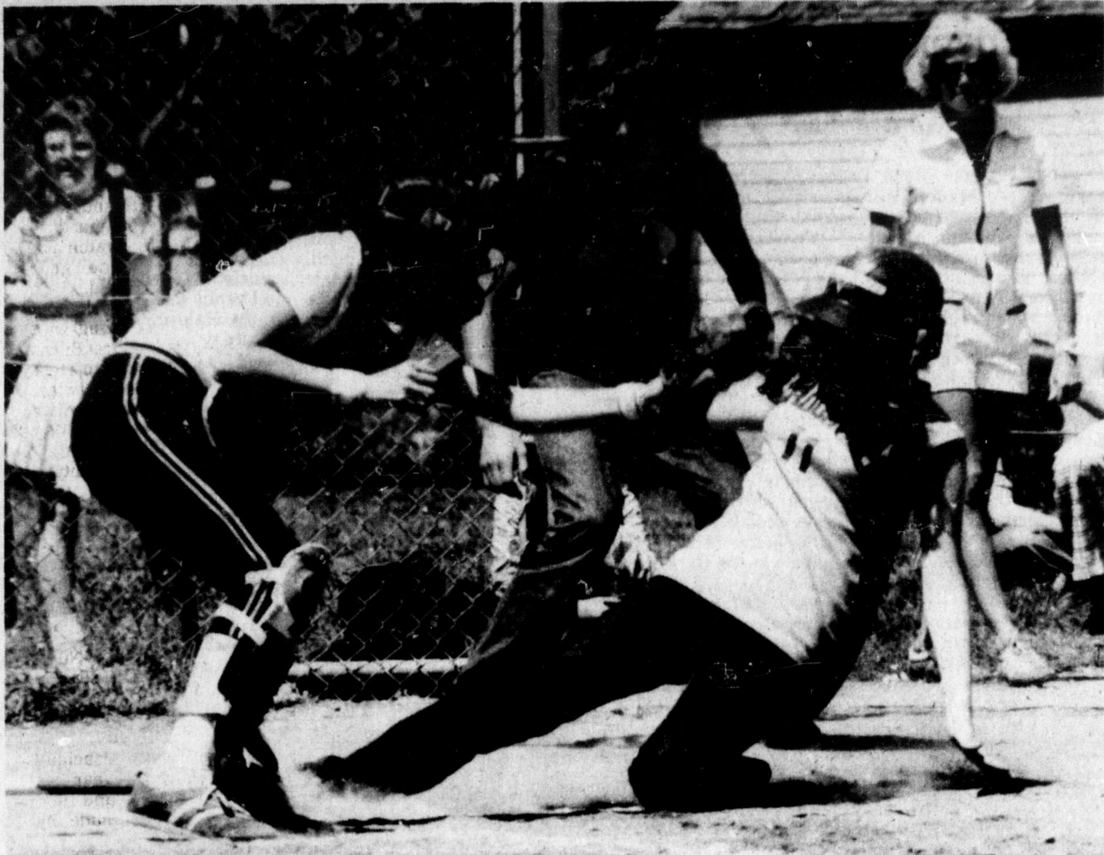
FAIRVIEW CATCHER guards the plate against an attempted steal of home by Brookville's number 11. The umpire watches closely to call the play.