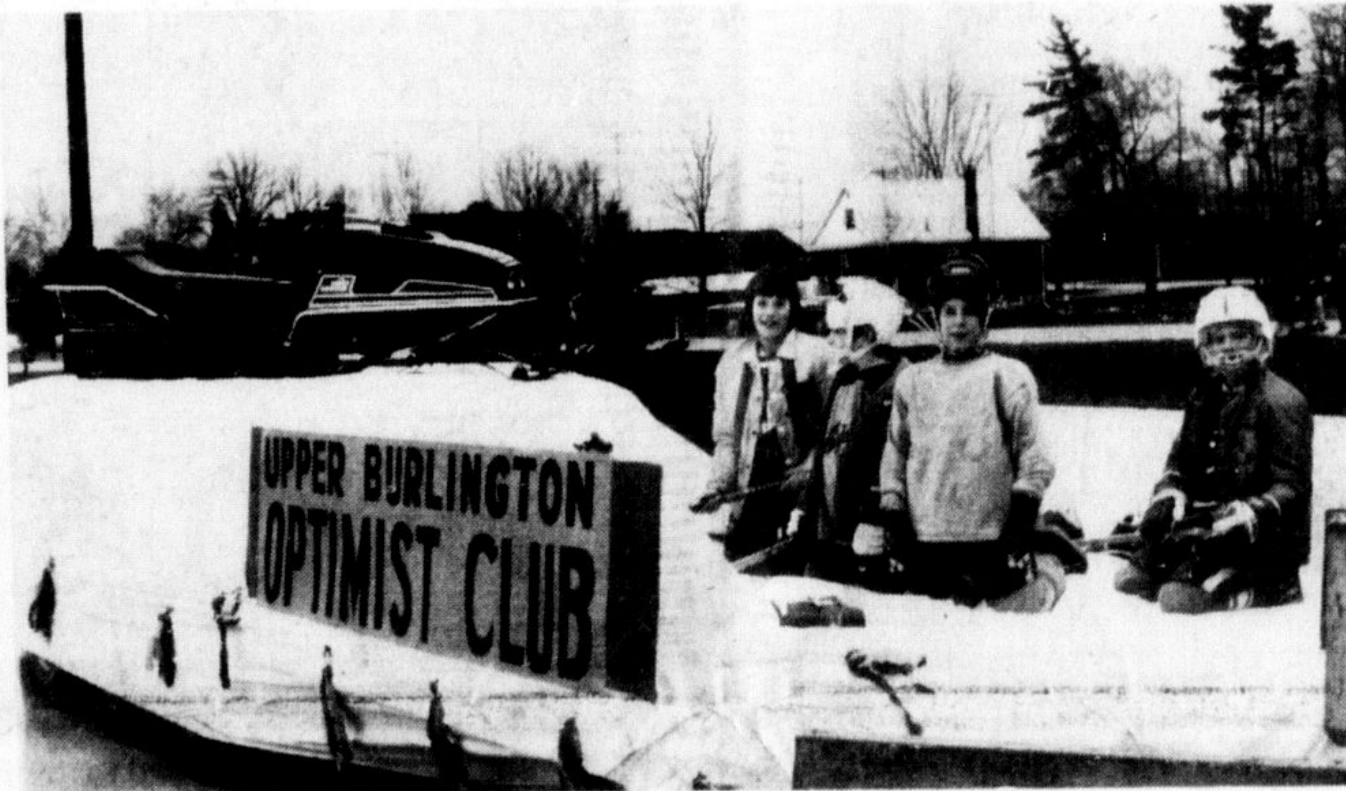
DEMONSTRATING their interest in youth, the Upper Burlington Optimist Club portrayed the winter activities they are interested in with hockey and snowmobiling obvious.