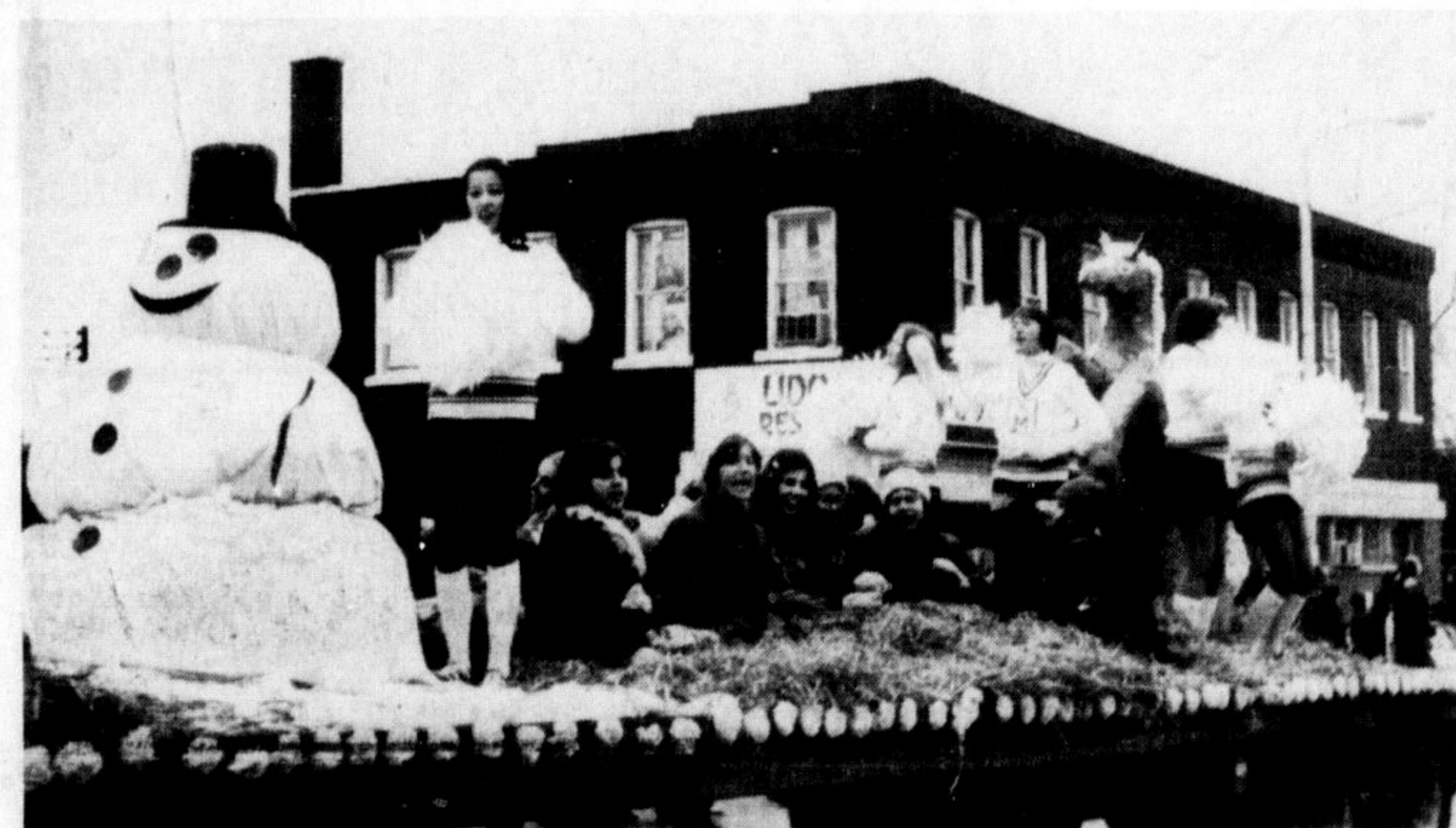
MILTON DISTRICT High School float included cheerleaders, and band and a replica of the Mustang, the school mascot as well as a larger than life snowman.