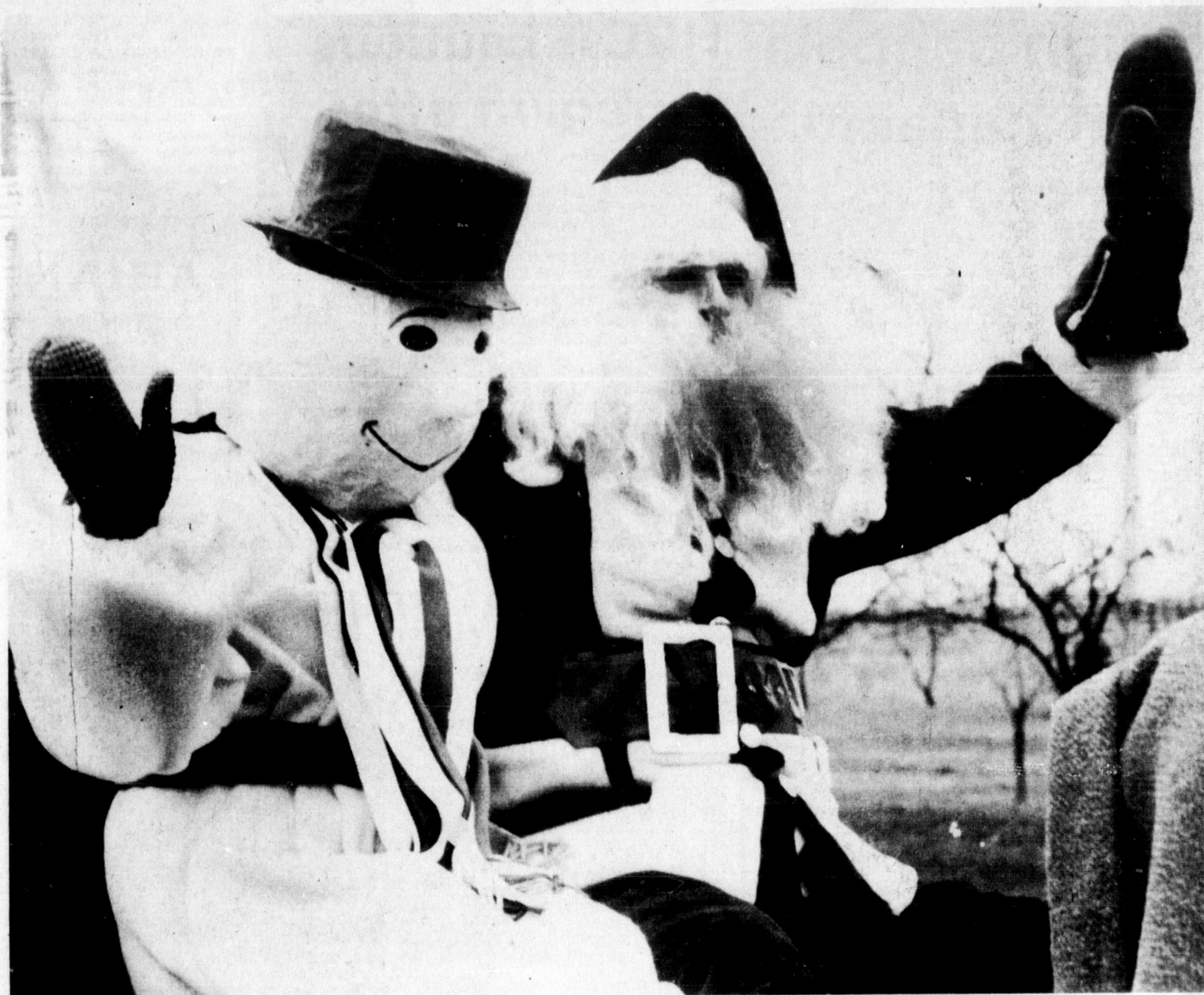
HO HO HO chuckled Santa as he and Milt the Snowman greeted well wishers who thronged the route of the Saturday parade. Milt walked the route but Santa was firmly ensconced on a rubber tired, horse drawn sleigh that was equipped for Milton's pre-snowfall days. An estimated 5,000 to 8,000 lined the two mile parade route for the event.