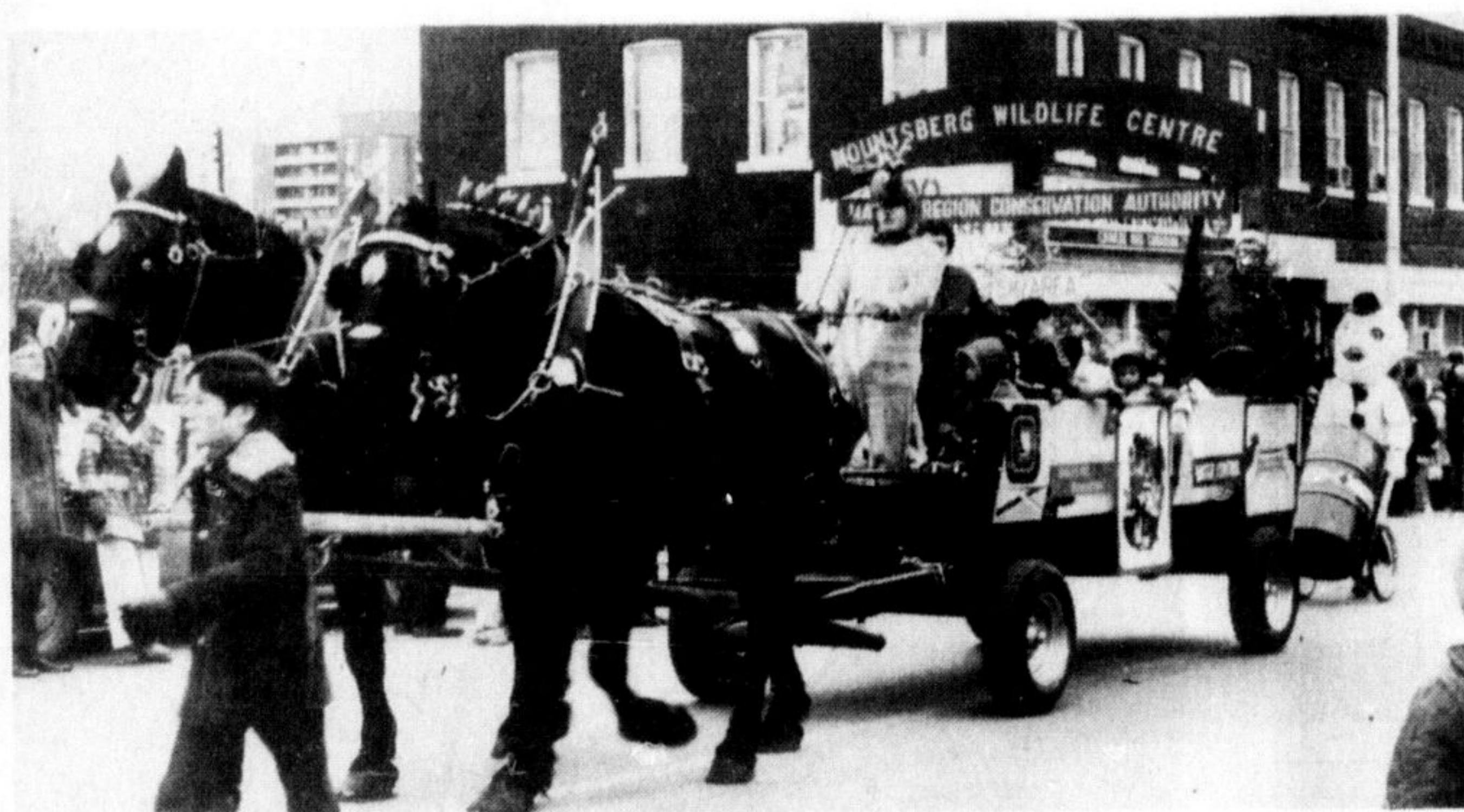
CONSERVATION FEATURES were highlights of the Conservation Authority's horse-drawn float with prominence for the Wildlife Centre at Mountsberg and the Glen Eden ski area at Kelso.