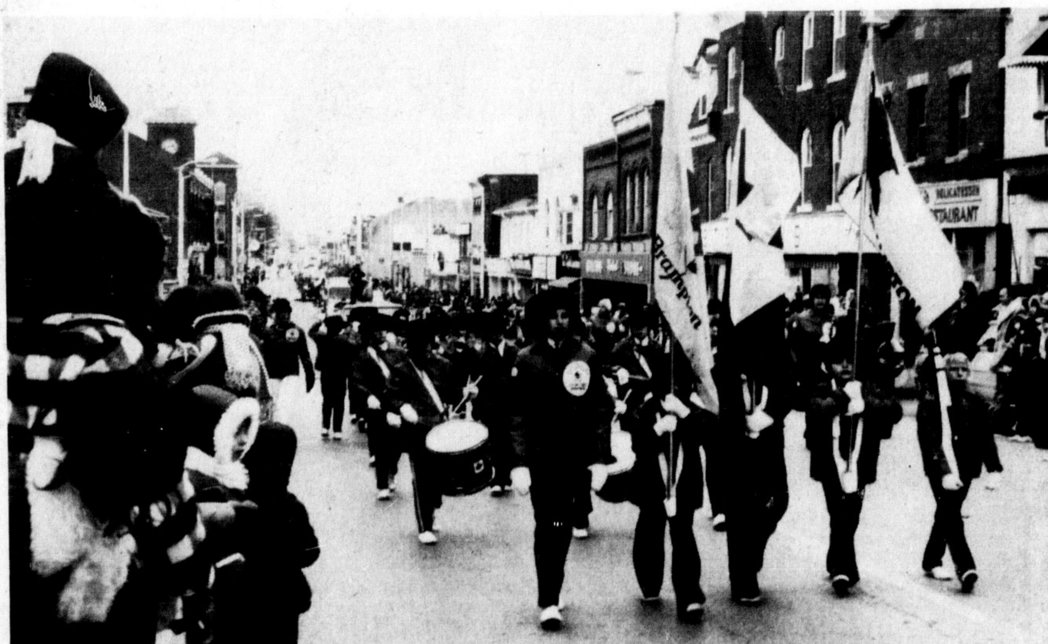
SENATORS' PAGES Drum and Bugle Corps, the junior edition of the Senators from Brampton, walked their second parade of the day to add the zest of music to the arrival of Santa in Milton. Crowds lined much of the route for the 48 entries in the parade that included nearly 800 people.