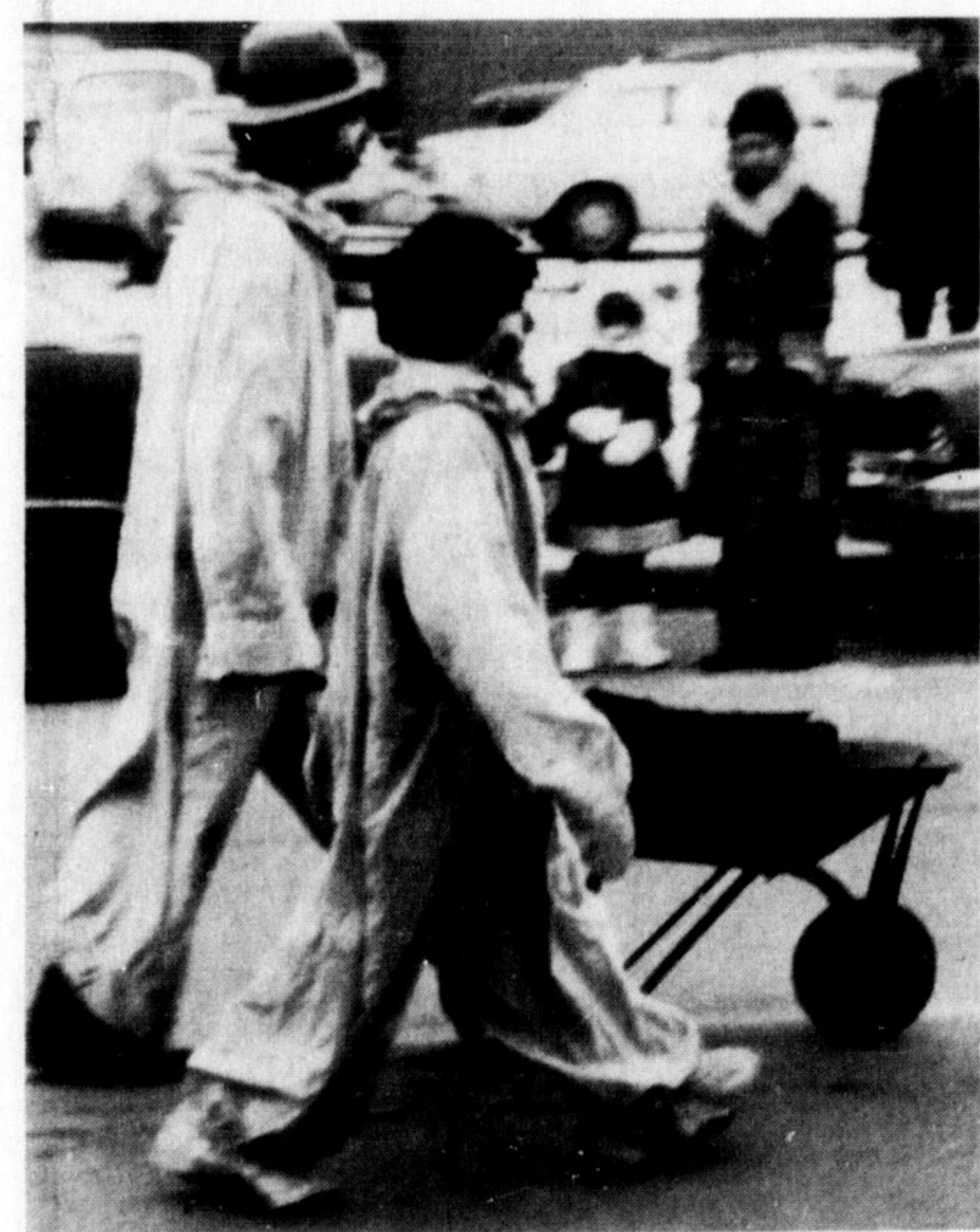
CLOWNS not only handed out candy, they also did an important clean-up job after the horses in the parade. Here two intent "specialists" are alert for action.