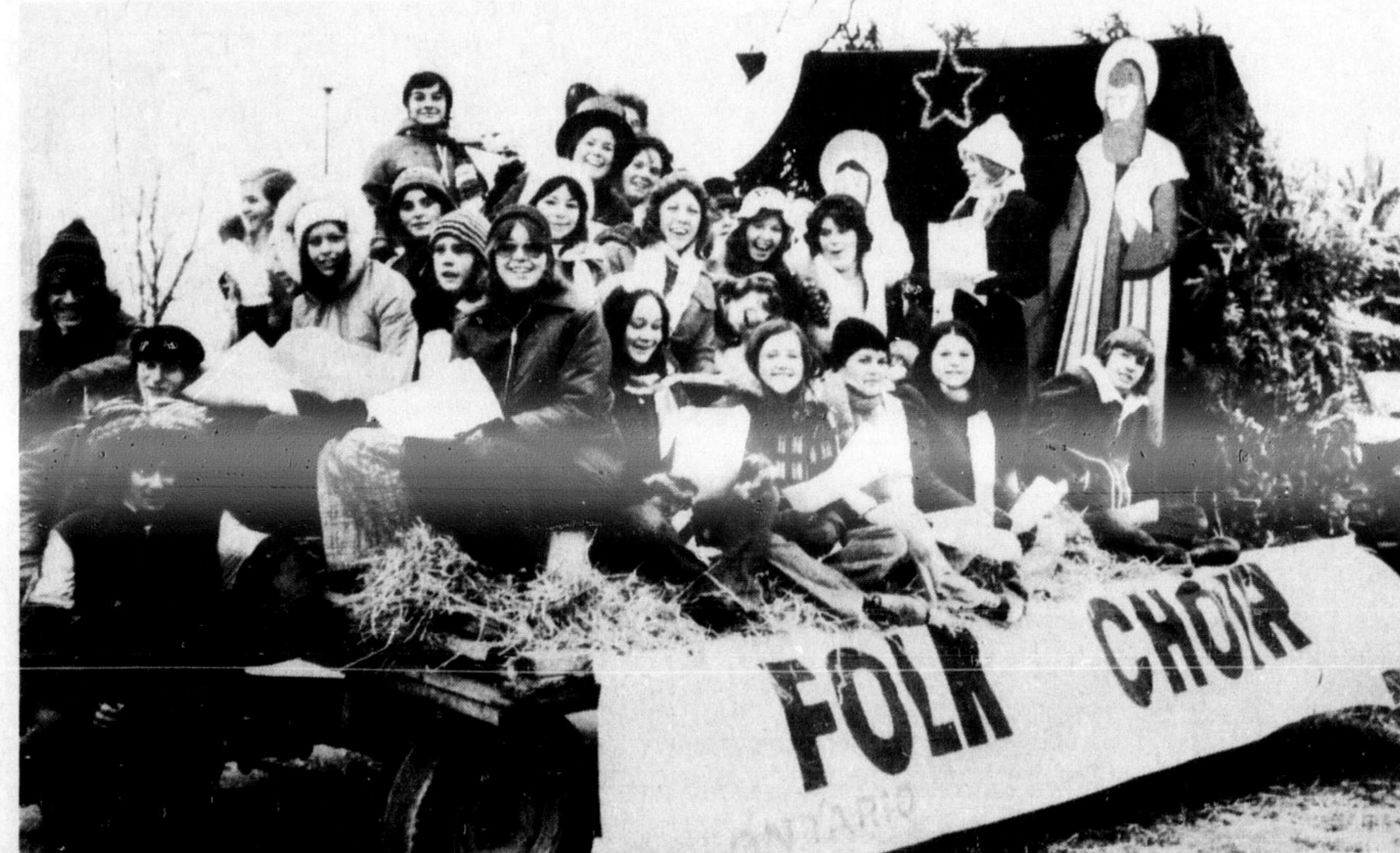
HOLY ROSARY FOLK CHOIR members provided some Christmas music as they participated in the Santa Claus parade. They were among the nearly 800 people who were in the parade.