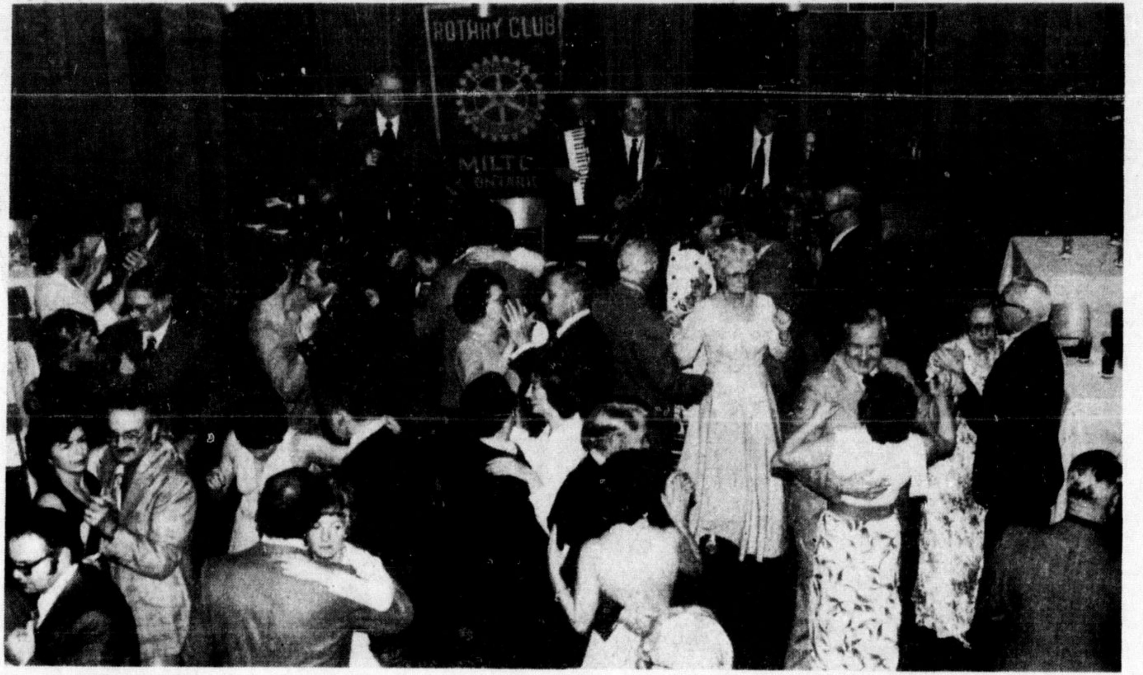
FALL DANCE of the Rotary Club was held Saturday evening at the Union Centre on Martin St. with more than 60 couples present. The dancing followed a buffet dinner. Music for the evening was provided by The Big Five.