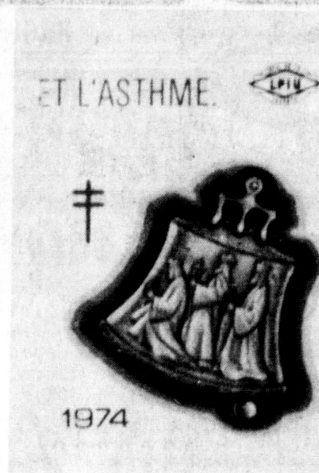
1974 CHRISTMAS SEALS

If, for some reason you do NOT receive your seals, please contact one of the local representatives on the board of directors of