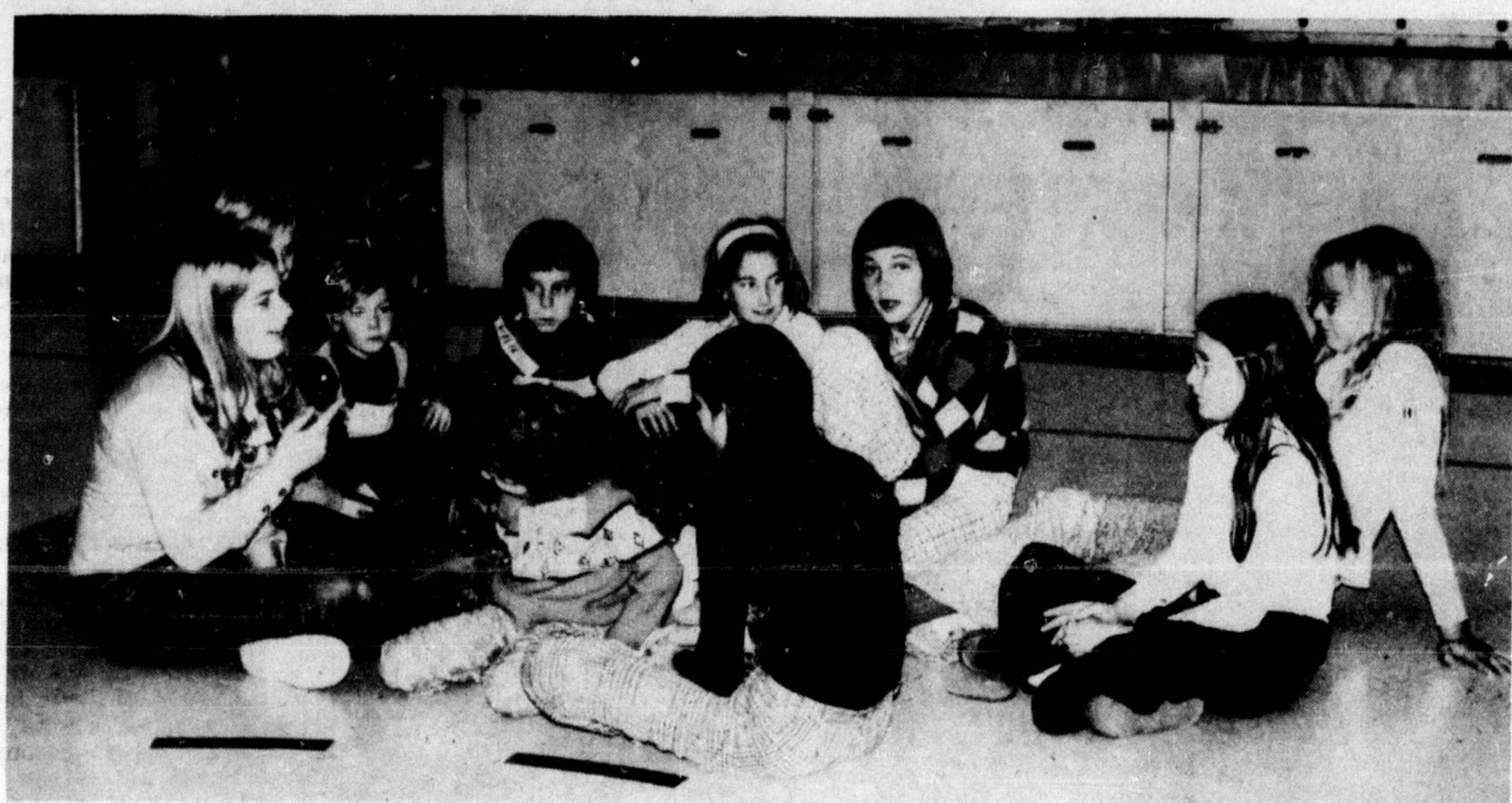
CREATIVE DRAMA sessions started Saturday at Martin St. school under the leadership of