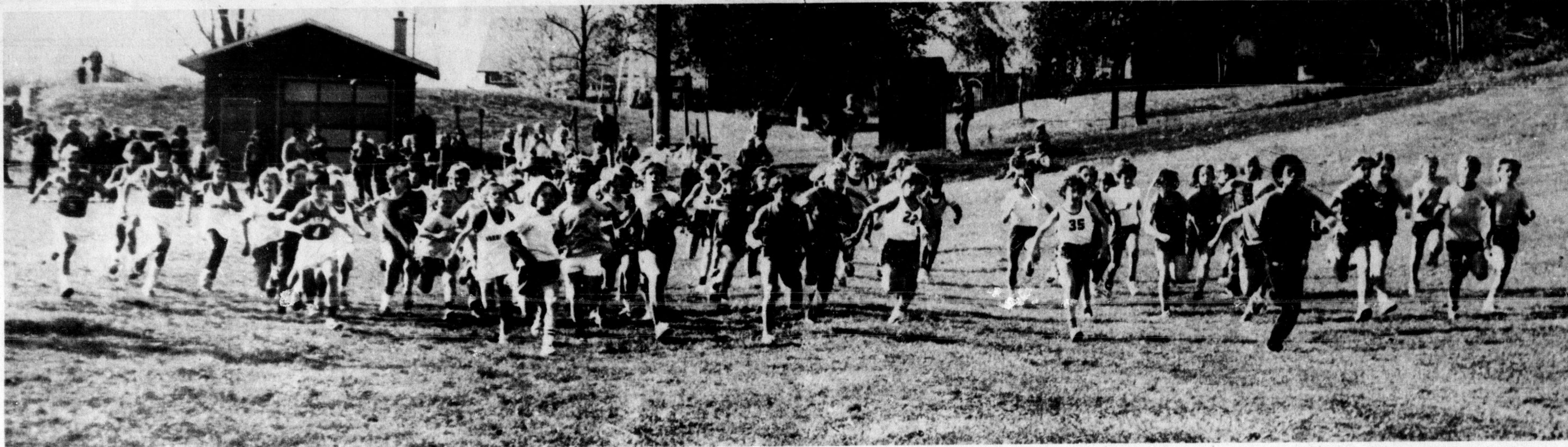
THEY'RE OFF. Junior boys jockey for position off the start of the Halton Public Schools Cross Country meet at the Kelso Conservation Area