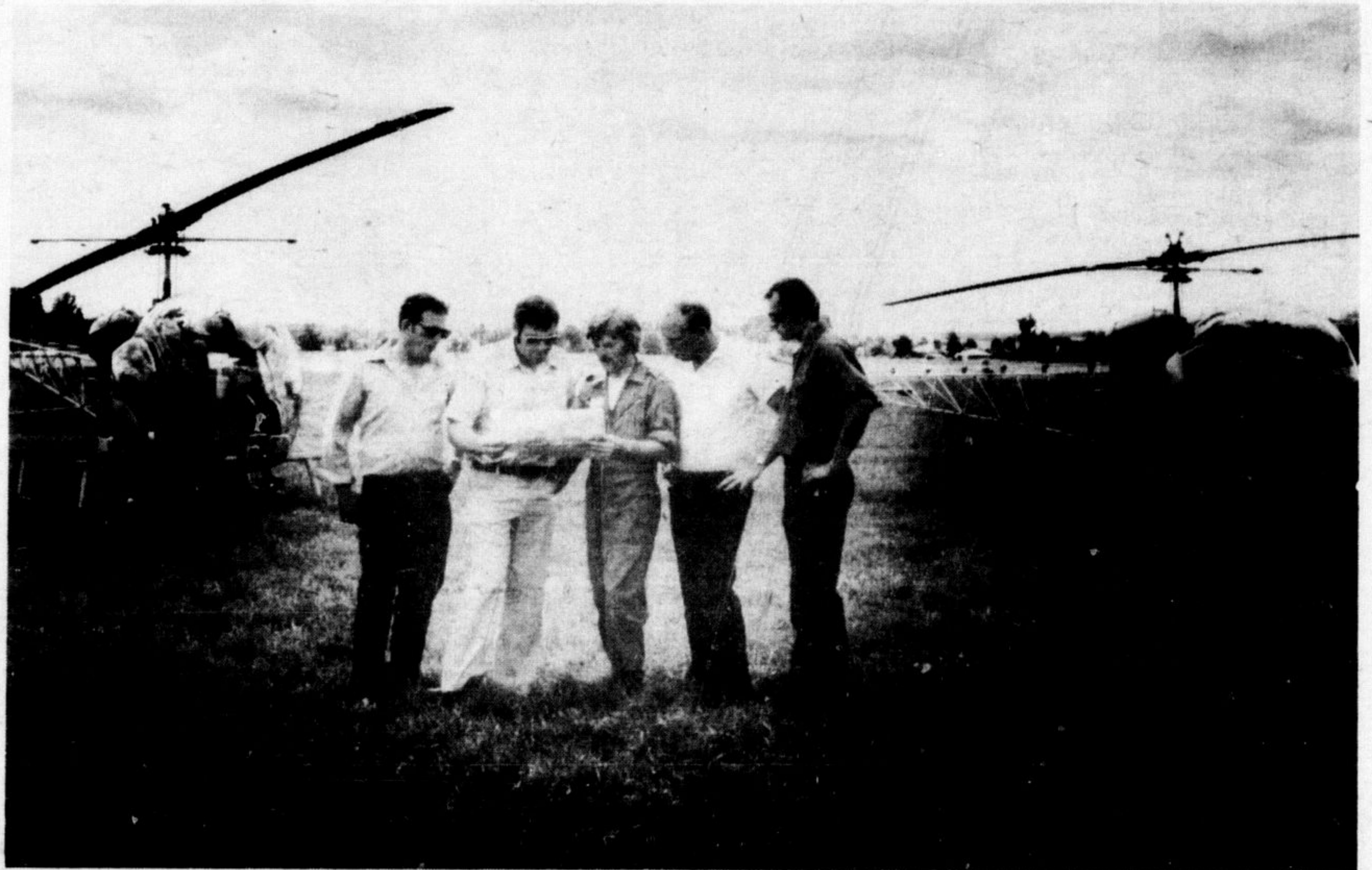
NIAGARA HELICOPTERS LTD. will be bringing a fleet of copters to the International Plowing Match in Halton Hills Sept. 24-28, and offering rides over the site to IPM visitors. One day last week two of the firm's whirlybirds visited the site, the Reid farm on Ashgrove sideroad, to sign a