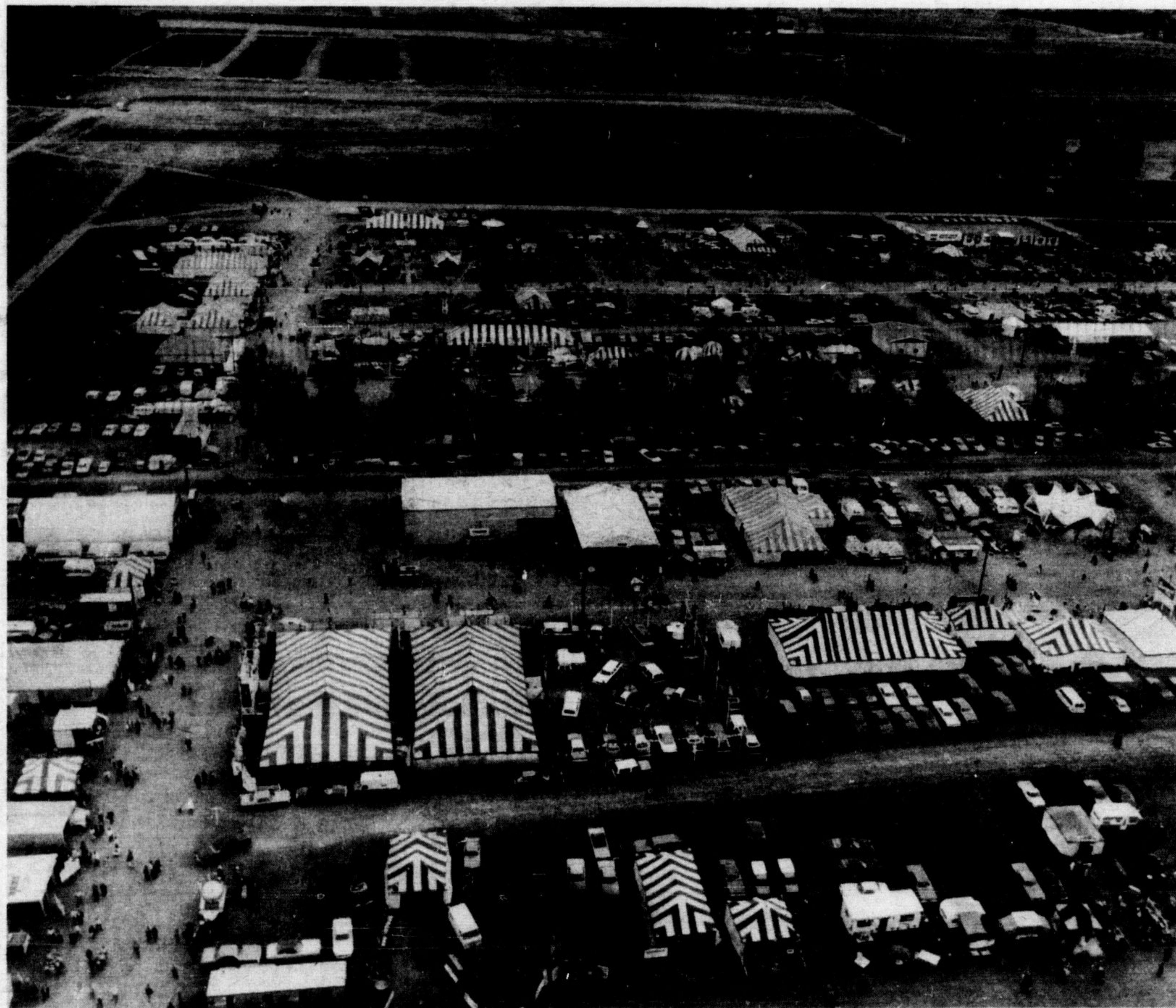
THIS IS TENT CITY, focal point of all International Plowing Matches, where exhibitors and caterers educate and entertain the thousands of IPM visitors. The photo was taken from a helicopter at last year's International in Lambton County. Next week the IPM comes to Halton from Tuesday to Saturday and an even larger tent city, more exhibitors, more displays and expanded plowing classes will be featured.