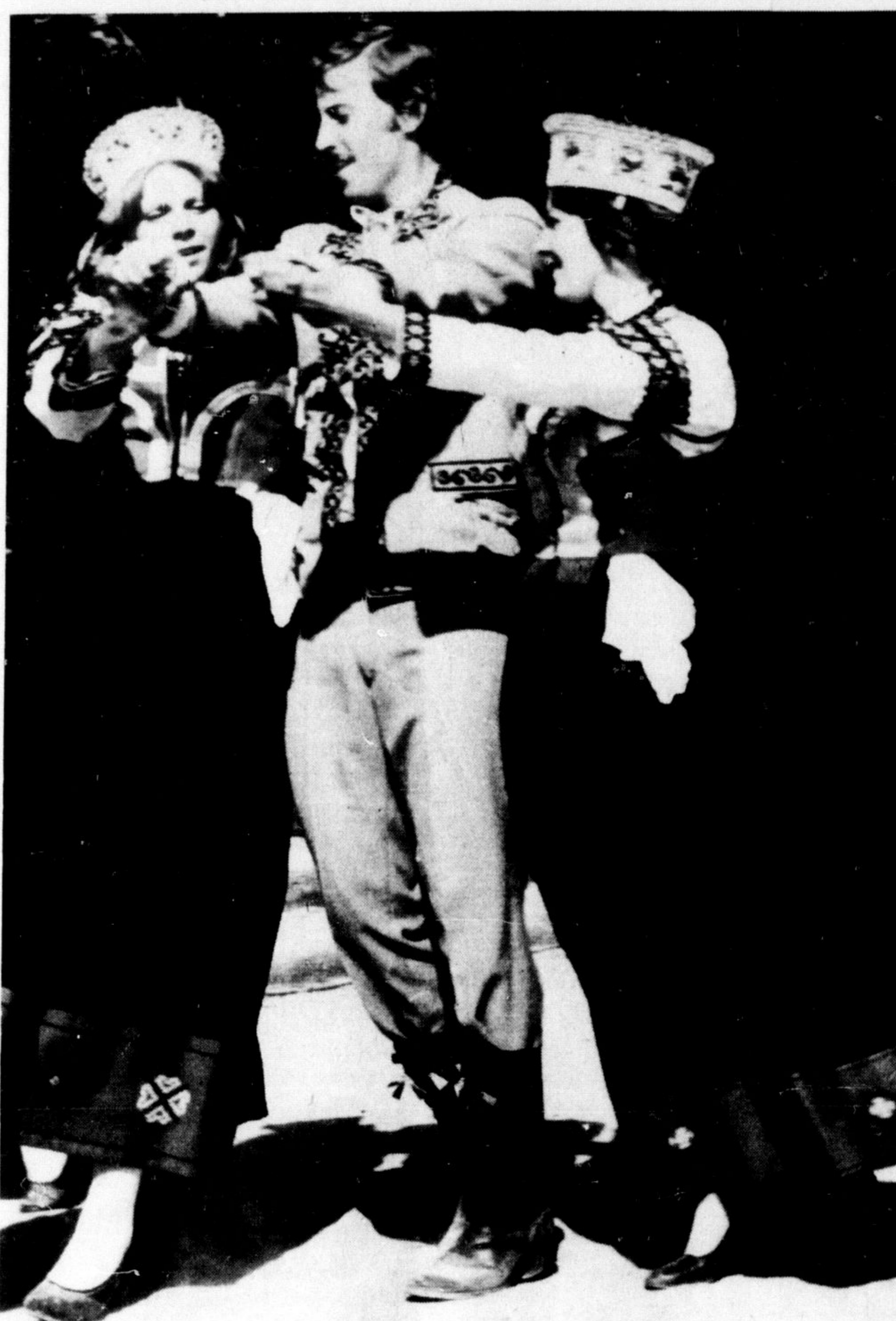
LATVIANS from across Southern Ontario, and a few from the United States came to one of a series of summer weekend festivals at Camp Sidrabene in north Burlington last weekend.