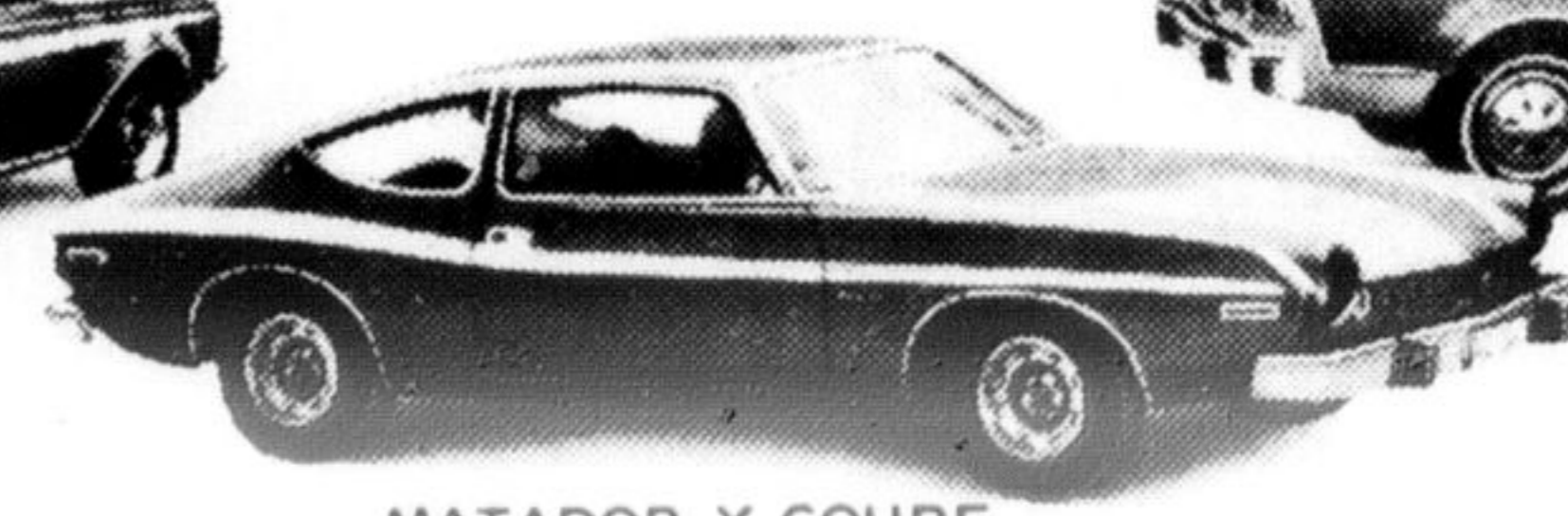
MATADOR X COUPE