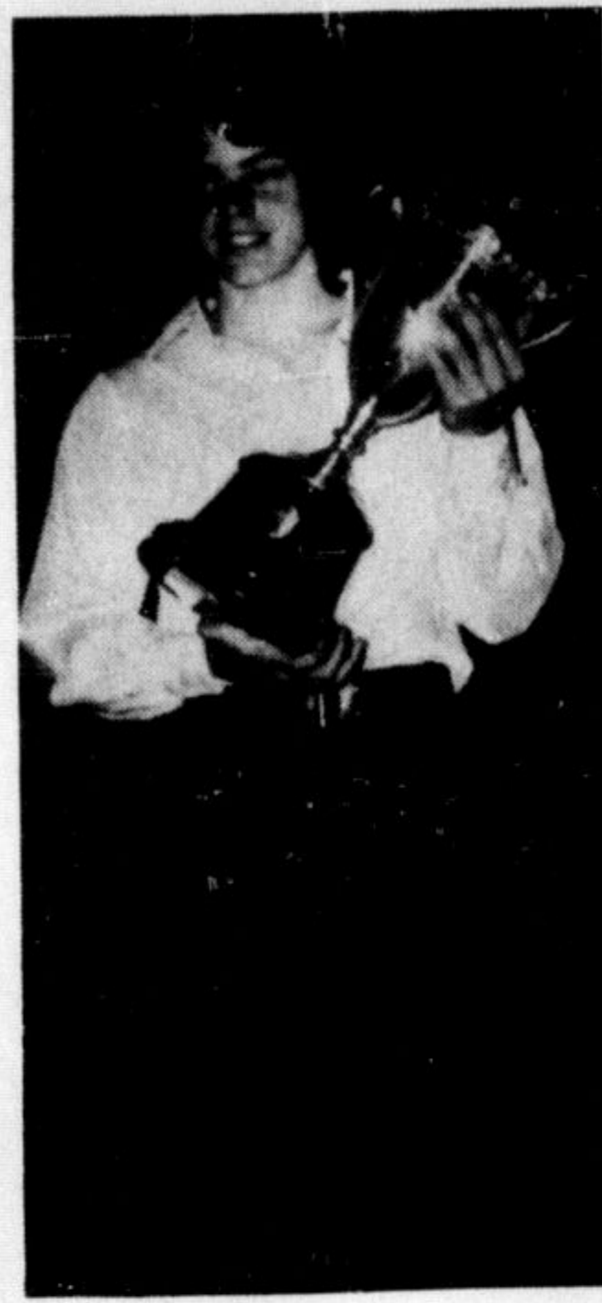
FIRST PLACE for boys' changed voices was won by Martin St. school at the music festival Wednesday in Acton. Milton school board trophy was the prize.