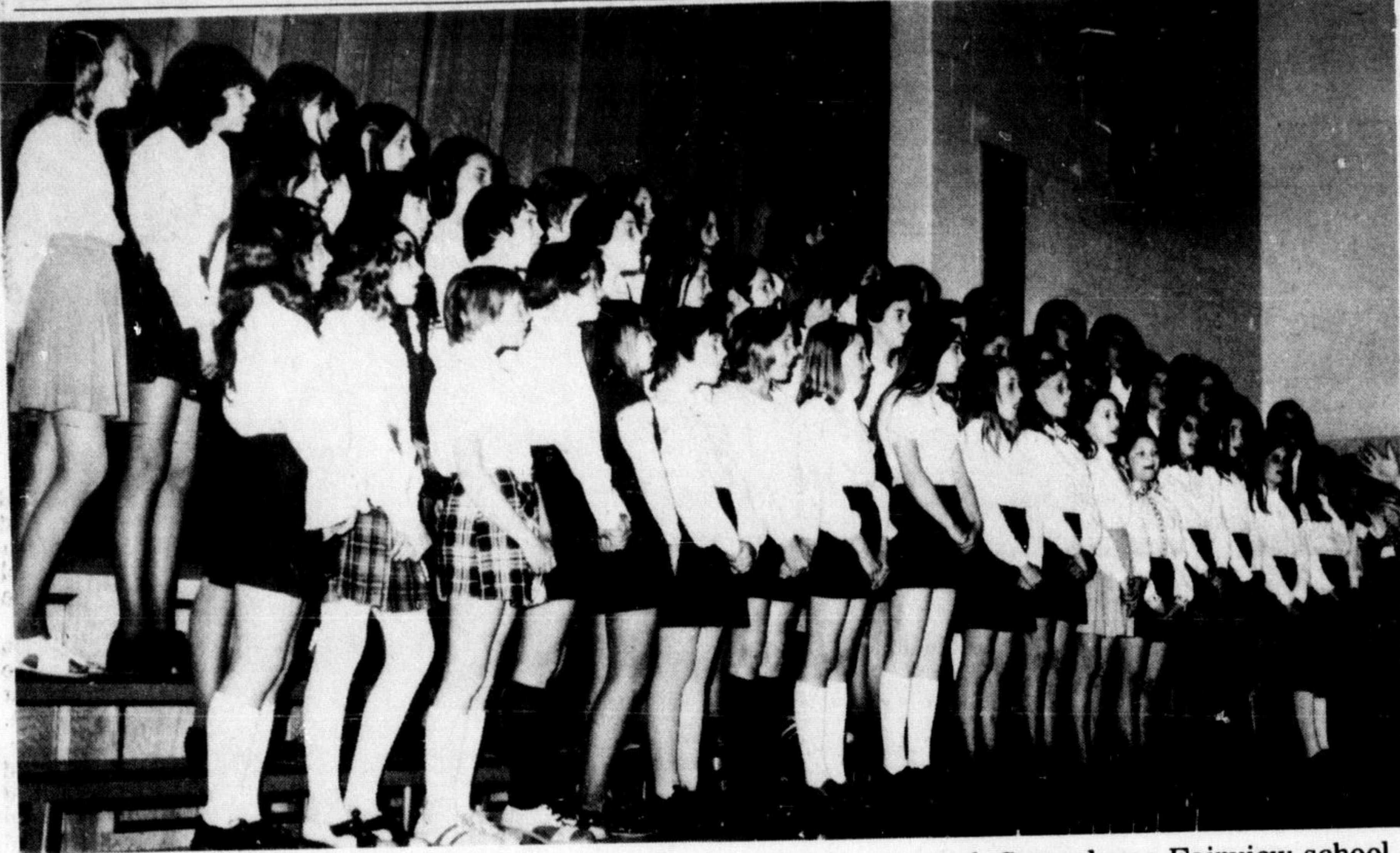
SENIOR CHOIR from Martin St. school brought home a first place trophy from the music festival in Acton Wednesday. They won the Milton Home