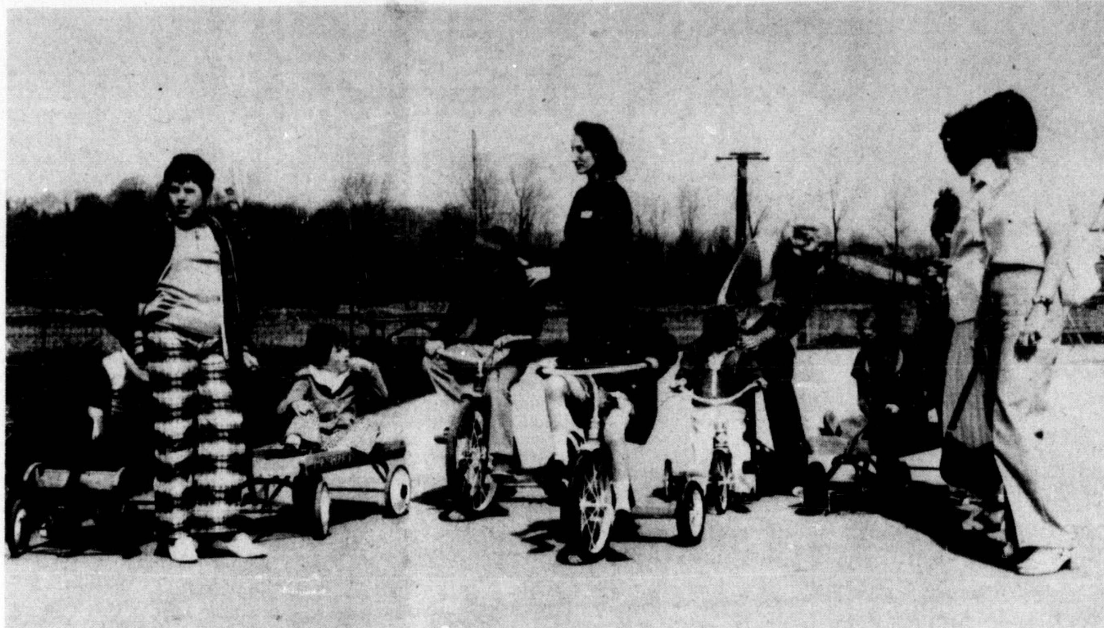
PLAYGROUND EQUIPMENT for the Sunshine School for Trainable Retarded was increased by a wagon and two tricycles when members of the Milton Kinettes visited last week. Hoping to do more for the school in the future, the women

The by-law also outlines the behavior of councillors and methods of dealing with business.