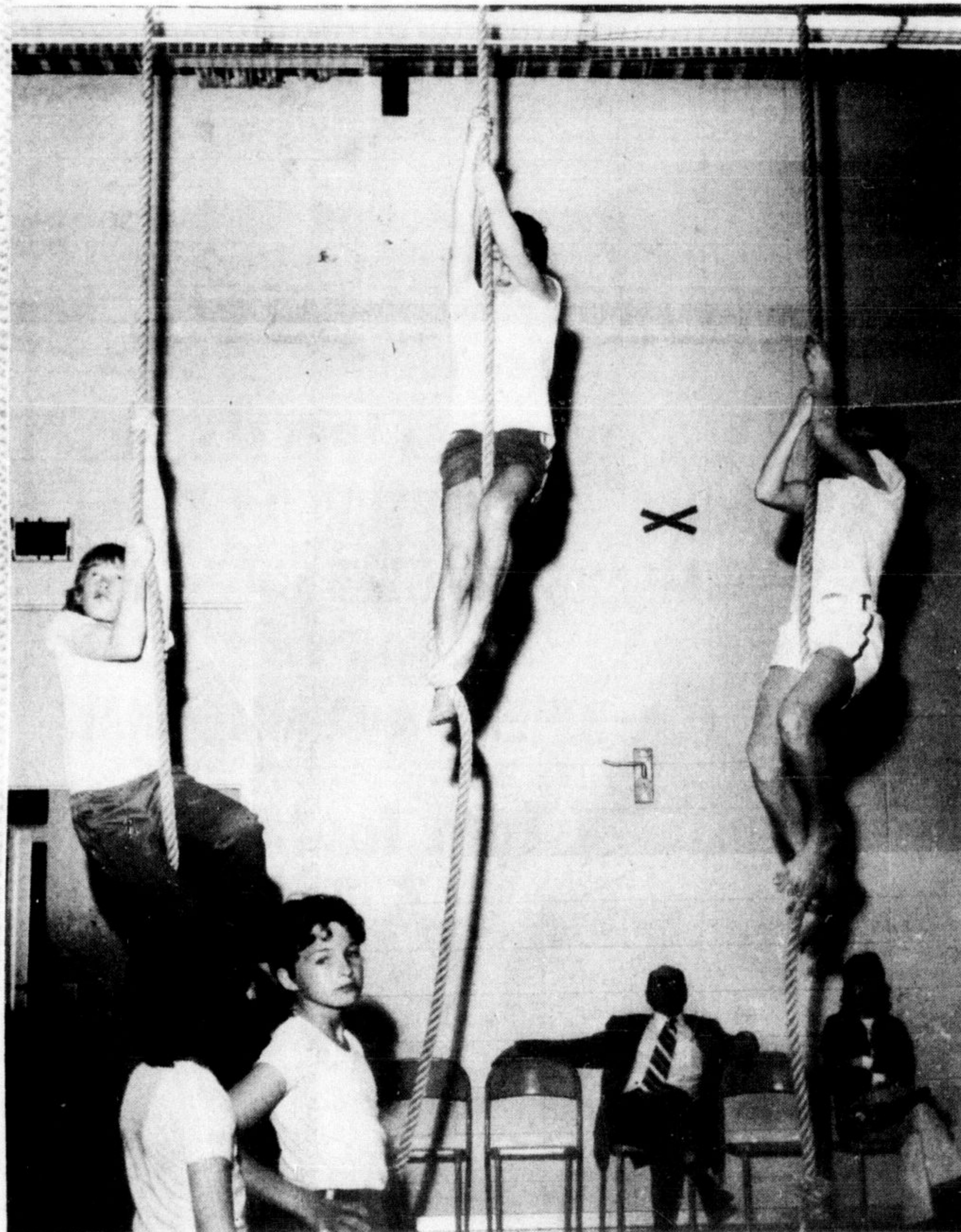
UP, UP, AND AWAY, students at Stewarttown School practice rope climbing during an open house session Thursday night. Parents and trustees visited the school to see some of the programs

LOOK MA, I can fly. Well not quite, but youngsters at Stewarttown School showed visitors they could handle themselves quite well on the trampoline. Parents, administrators and trustees visited the school Thursday. Programs at Harrison, Acton District High School and Stewarttown Senior Public School were on display Thursday night.