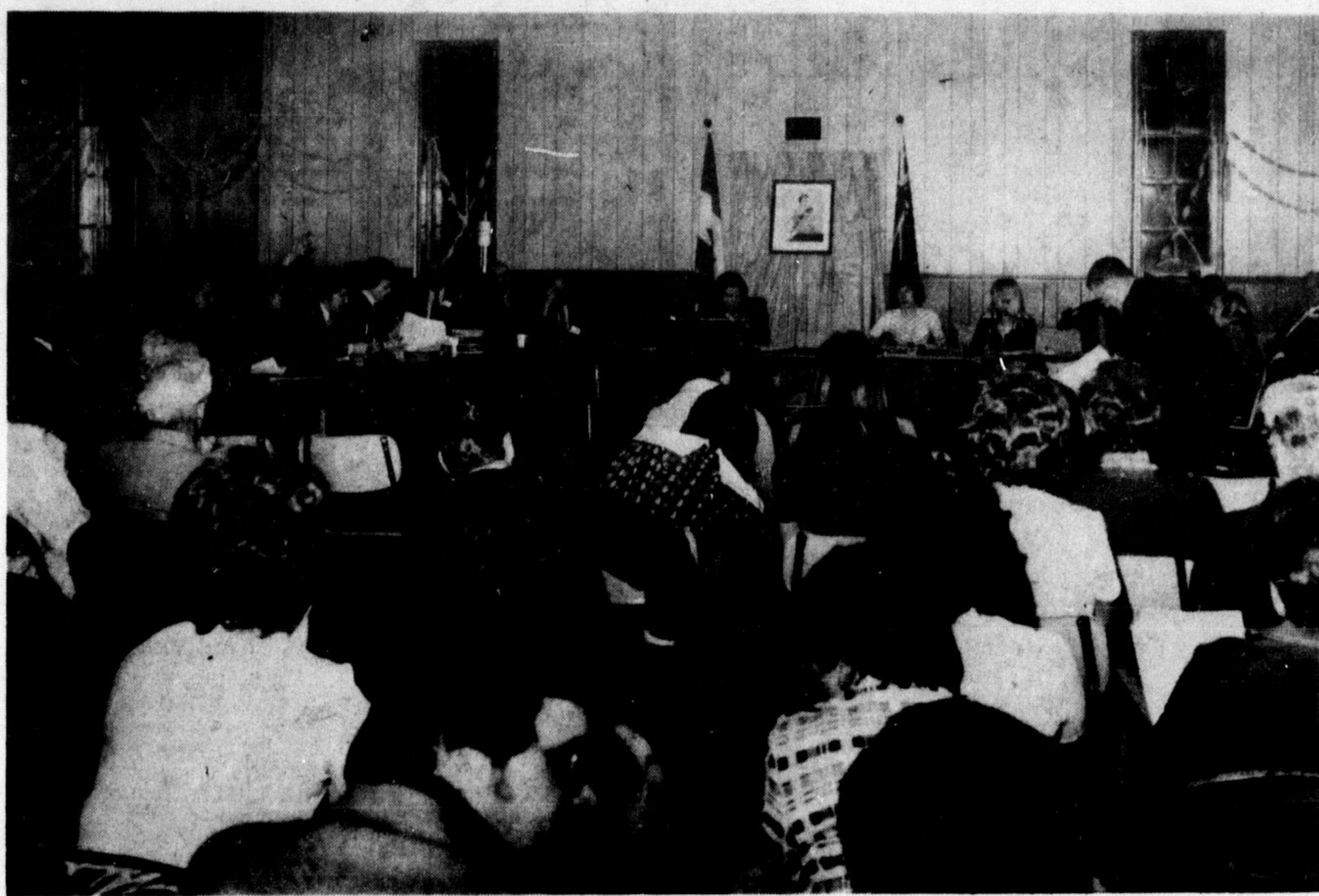
MILTON COUNCIL took to the road Tuesday of last week for one of the regular meetings. The meeting was held in Brookville Hall to increase ratepayer participation and is one of several to be held in outlying areas.