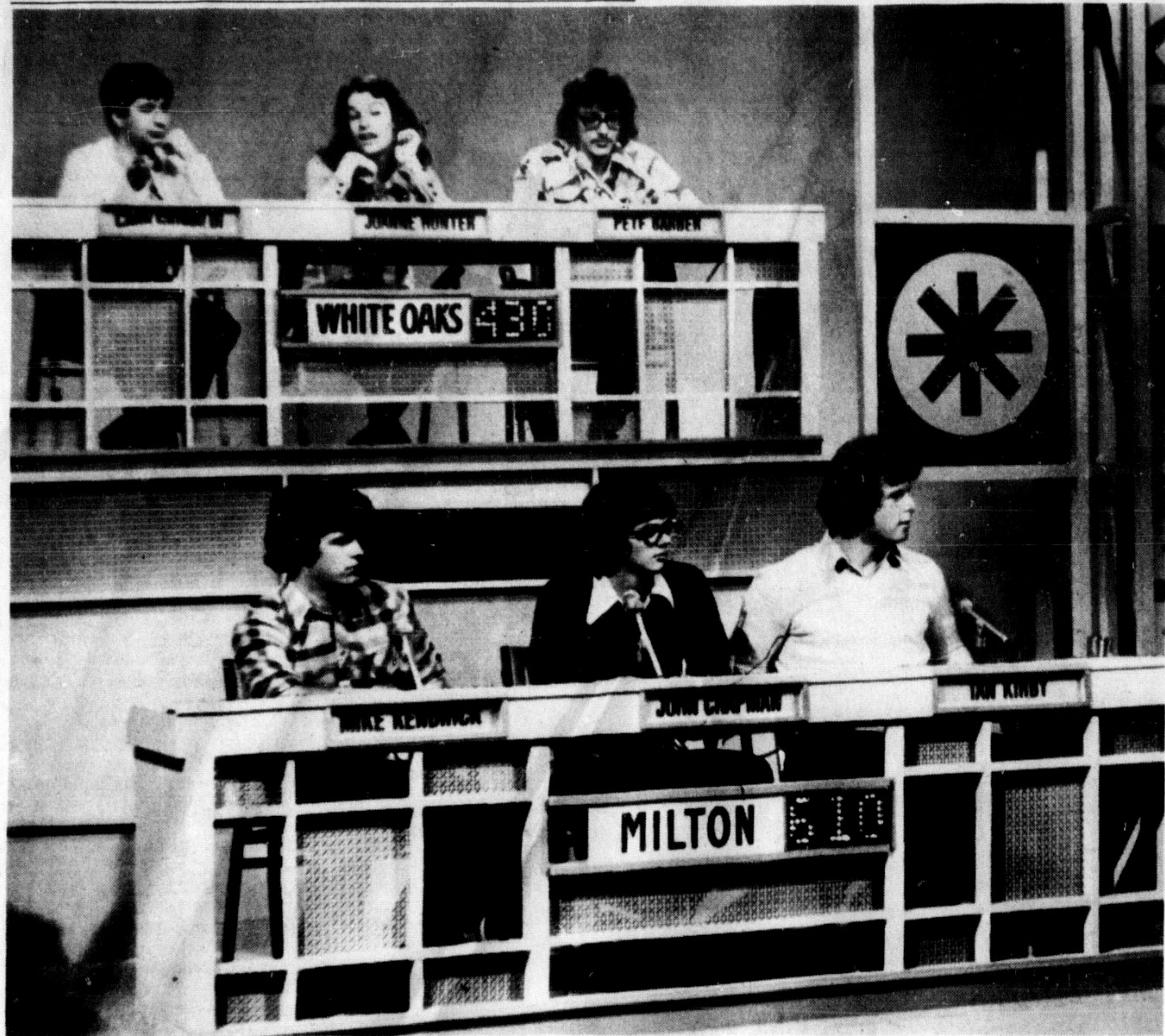
CHAMPIONS—the most intelligent group of students from Hamilton-Wentworth and Halton County high schools are Milton District High School students, according to the game show HI Q.