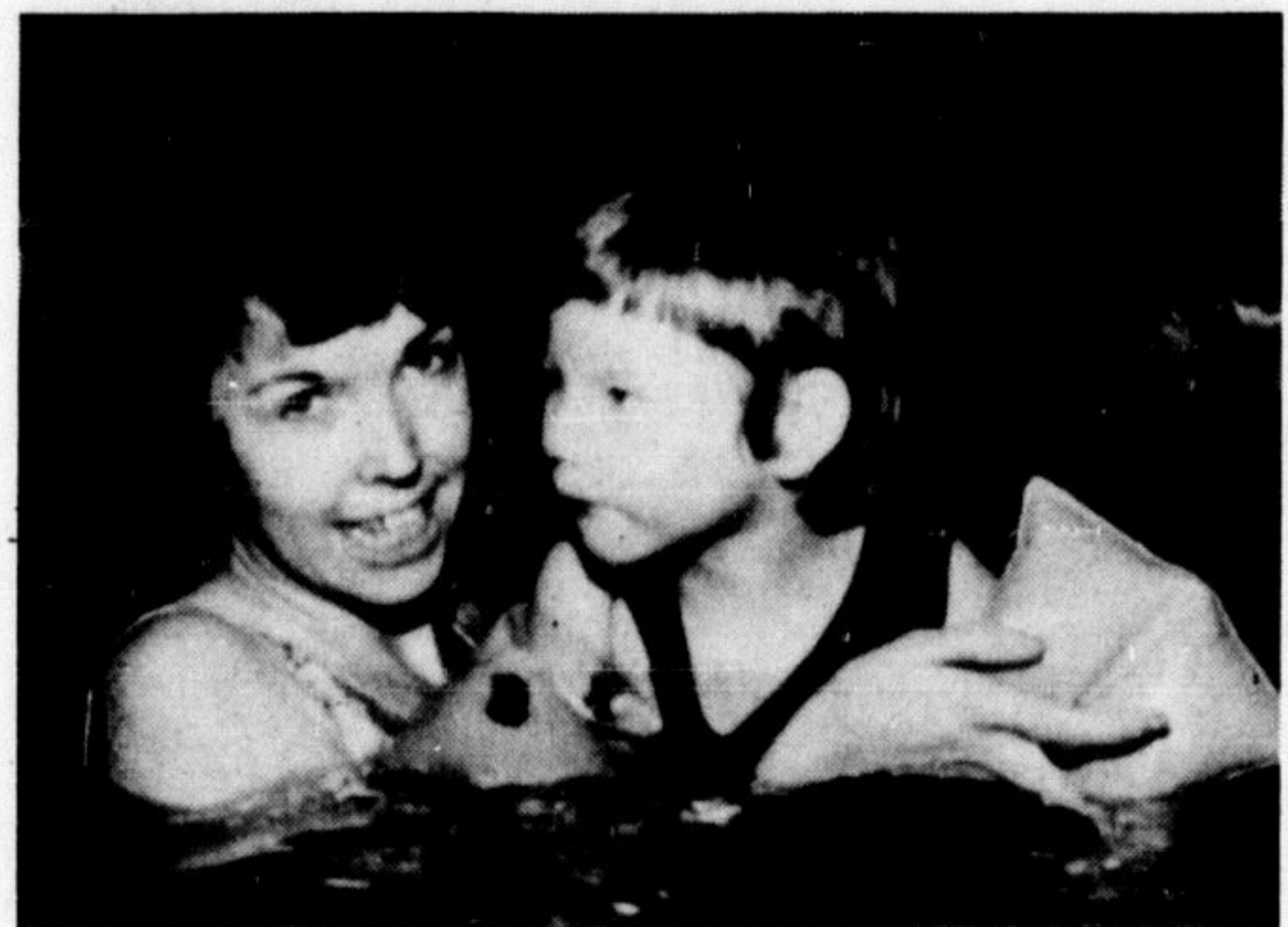
ONE VOLUNTEER to one child is the theme of the swim program for the Tinkerbell nursery school children who use the Credit Valley Club pool free of charge.