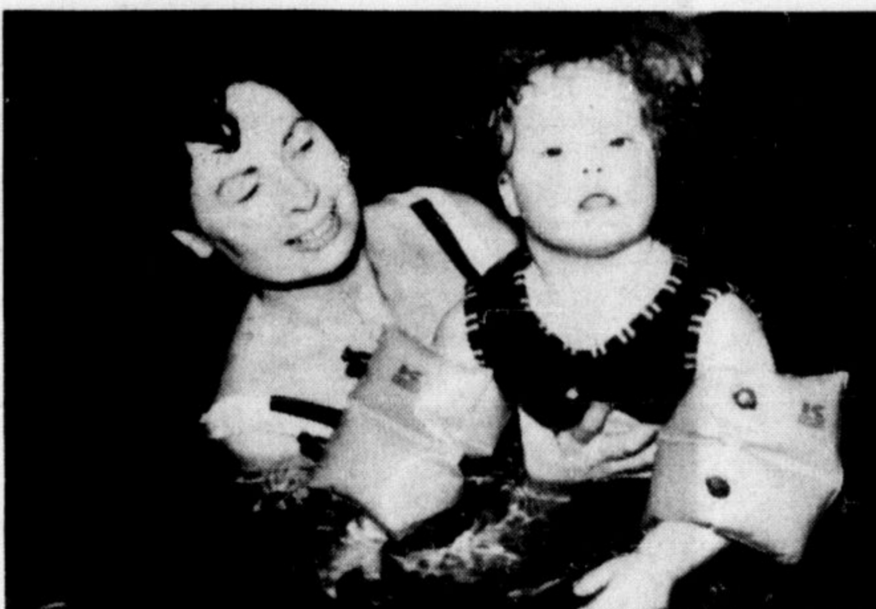
A HELPING HAND gives the young swimmers confidence as they try out the pool at the Credit Valley club.