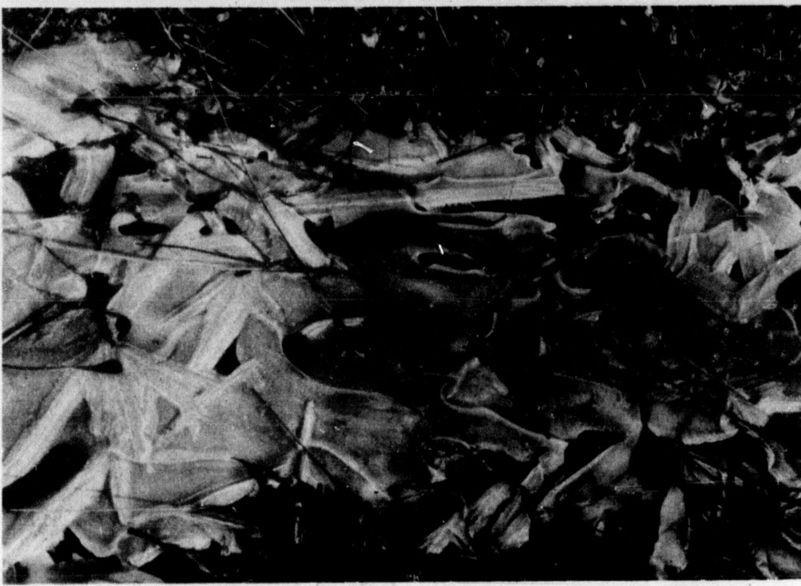
ARTY DESIGN fascinated our photographer. Can you figure it out? It's a thin patch of ice in a ditch along a rural roadside.

Dear Sir: I see where the two teachers responsible for the visit of two lesbians and two homosexuals to a grade 12 health class at M. M. Robinson High School, are greatly "exercised" about avoiding "distortion, dishonesty, or misinformation."