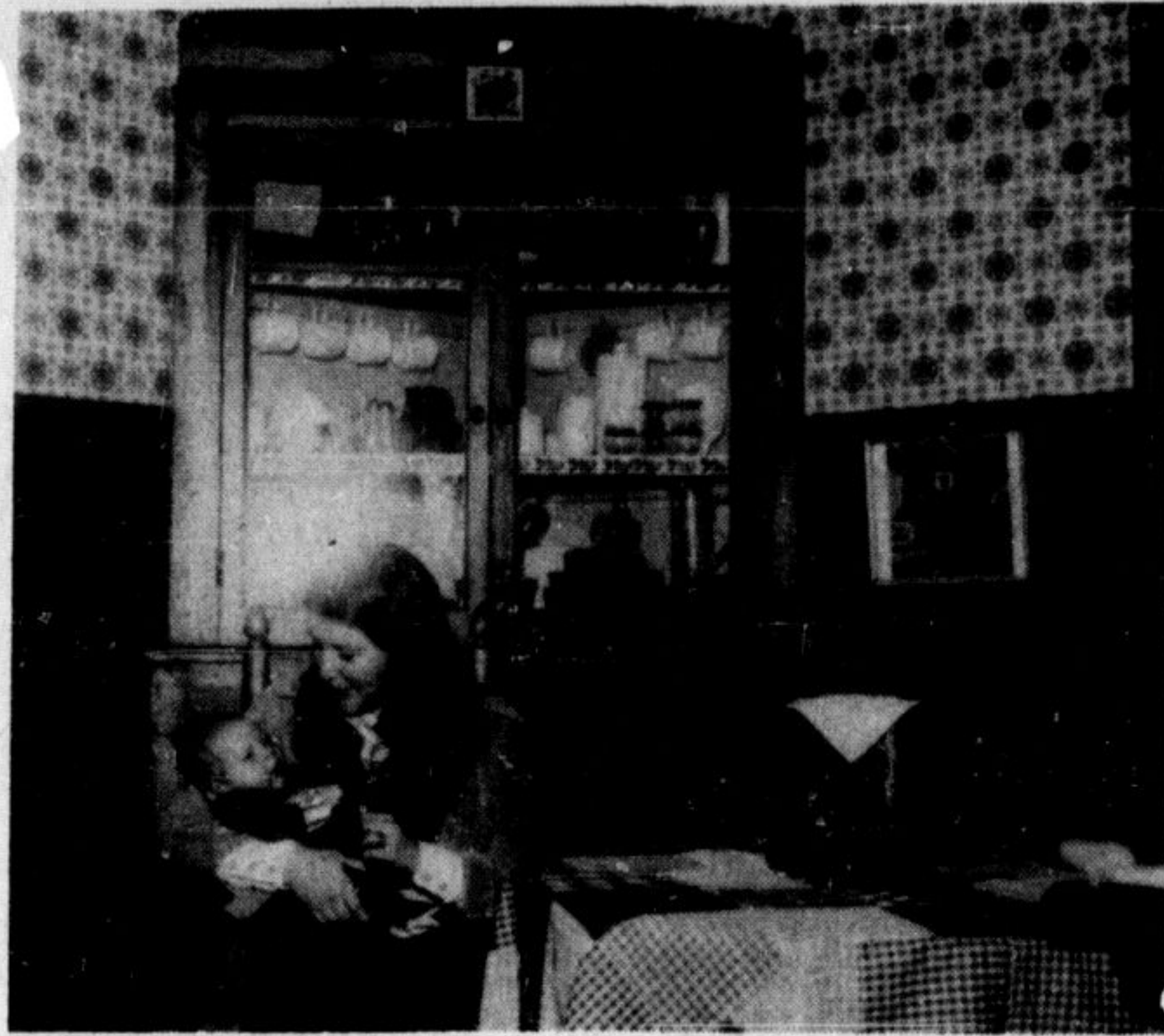
INTERESTING KITCHEN has the original built-in pine cupboard and high wainscoting. Bonnie holds Coby at the round table with its crazy quilt cloth.

Hand-made quilts adorn the beds in the other two rooms. The master bedroom is restored to include the simple comforts of a birch and butternut washstand holding the old English bowl and jug.