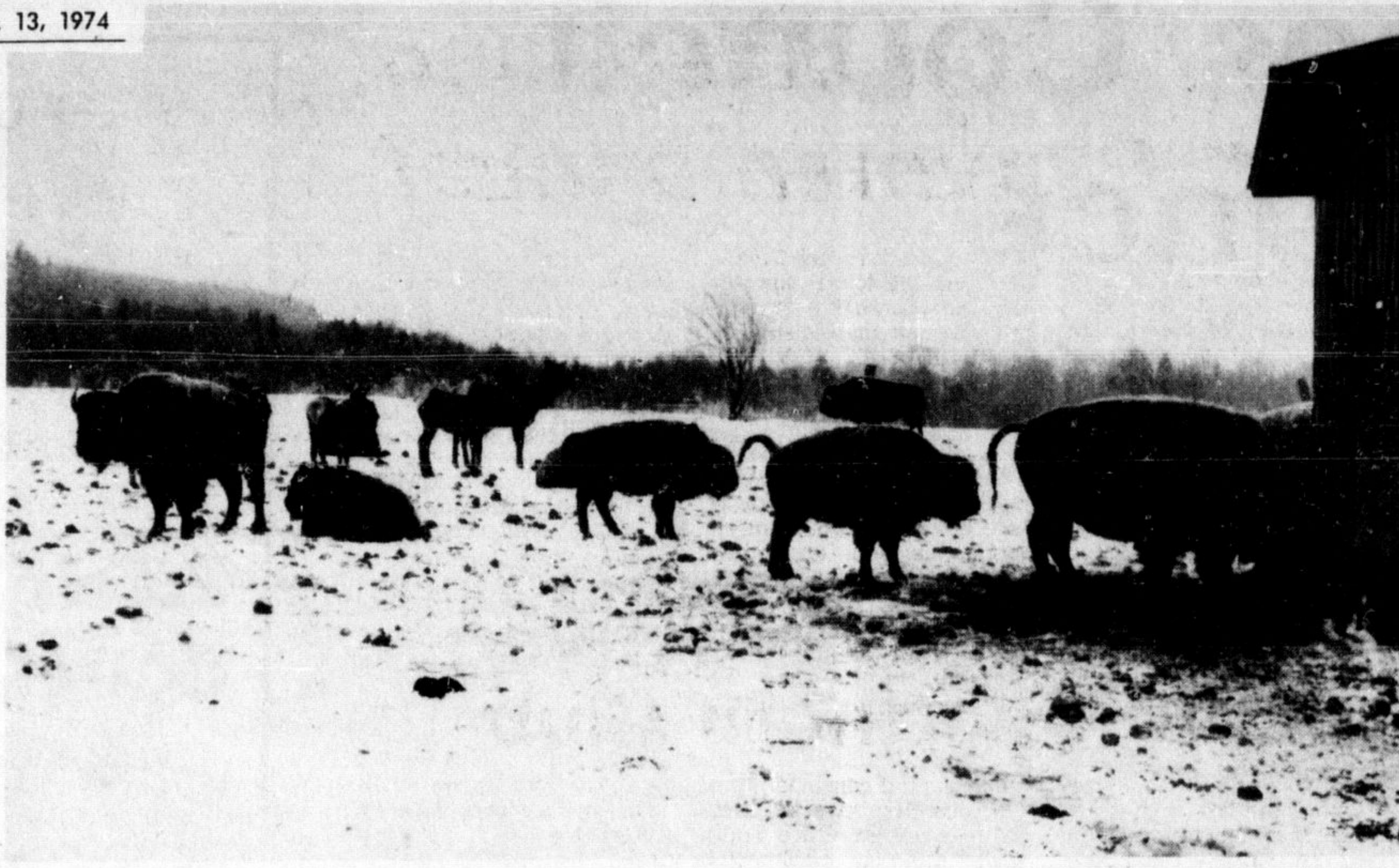
THE FENCE surrounding the buffalo and elk herd at the Rattlesnake Point conservation area has been moved closer to the feed hut to allow conservation area patrons a closer look at the beasts.

—Halton Plowmen are busy promoting the 1974 International Plowing Match, being held in Esquesing Sept. 24 to 28.