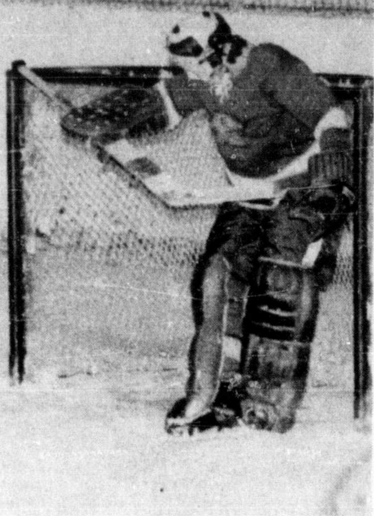
CAN I STOP IT?

These are comments which could have come from the Beamsville goalie during the game against the Milton Mustangs Monday. The Mustangs, Milton's high school hockey team, defeated Beamsville 7-1