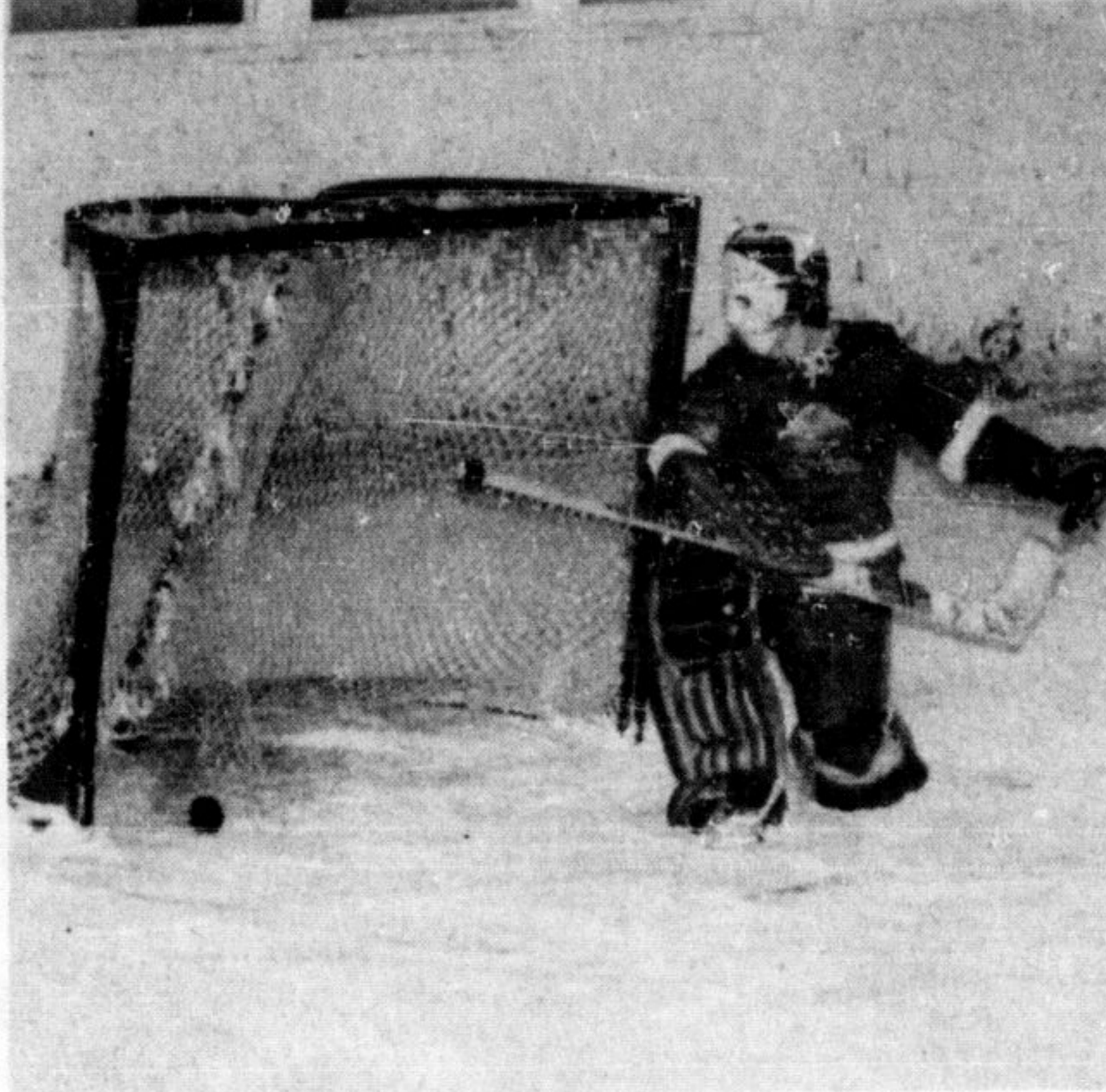
OOPS I MISSED.

These are comments which could have come from the Beamsville goalie during the game against the Milton Mustangs Monday. The Mustangs, Milton's high school hockey team, defeated Beamsville 7-1