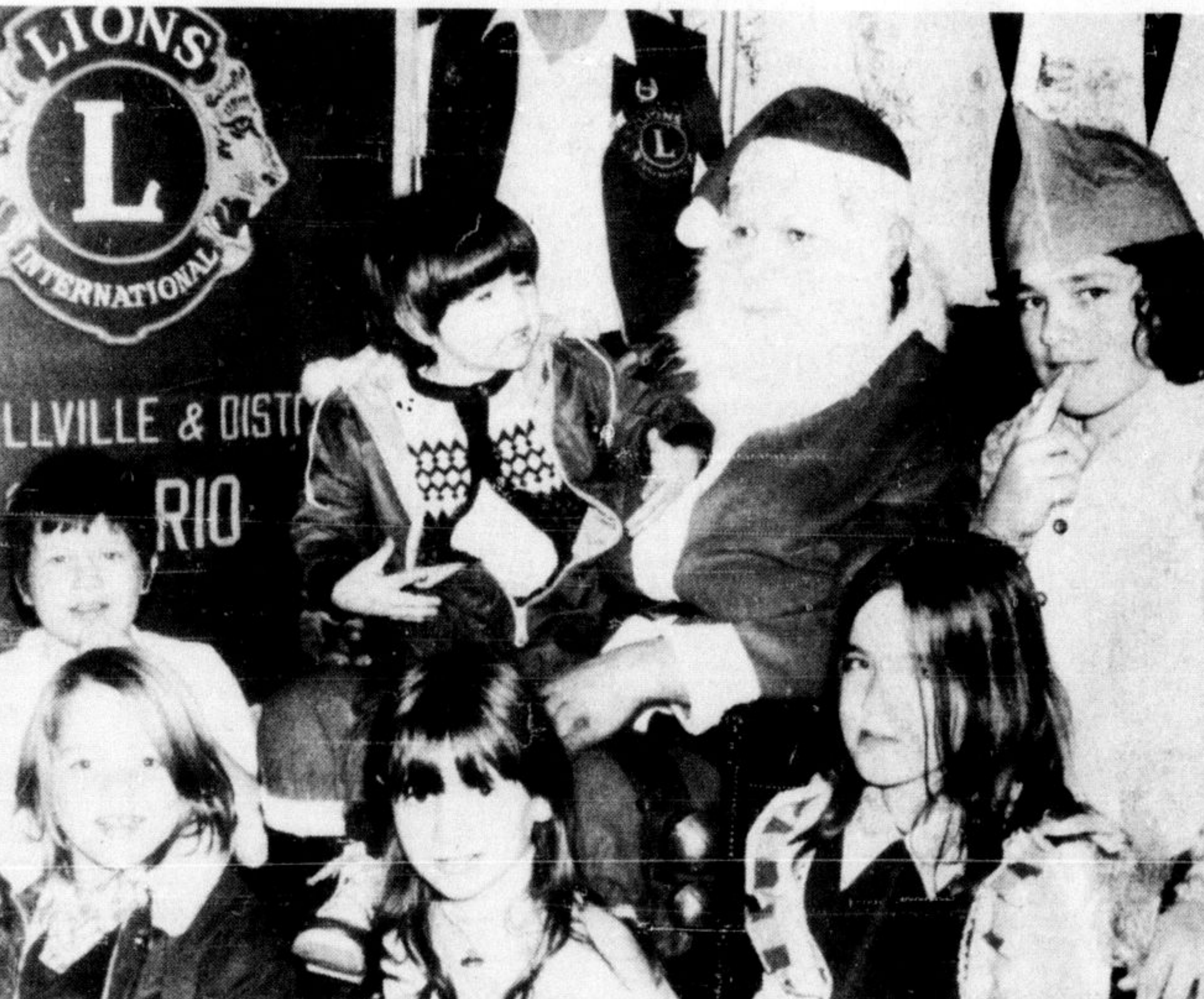
CAMPBELLVILLE KIDS crowded 'round Santa when the jolly old saint paid a visit to the Lions Club Christmas party at the Masonic Hall Saturday. Lions distributed candy to all the local children.